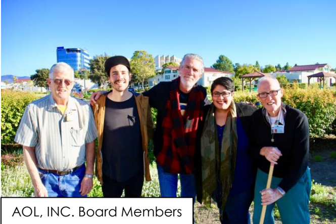
AOL, INC. Board Members

I am sure we can all agree that January felt like a long month. Nevertheless, it was filled with exciting ministry opportunities we want to share with you. These past two months have felt like a whirlwind, as we learn what it takes to not only move a ministry forward, but all the behind the scenes work it takes to keep moving towards our goals. We are learning that it is a process of waiting and being faithful with