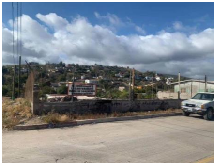
Empty lot by Casa Josué