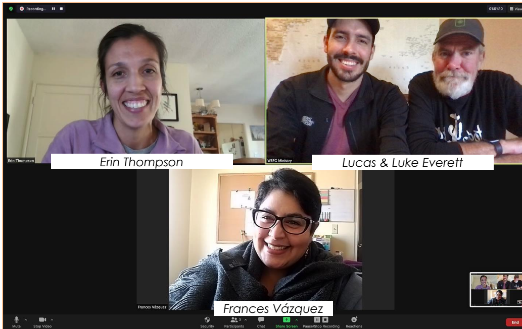
2021 Angels of Love, INC Board Members