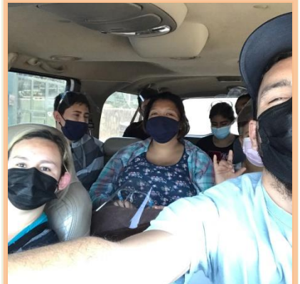
Transporting the Deaf to the vaccine site