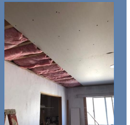
New ceiling and insulation