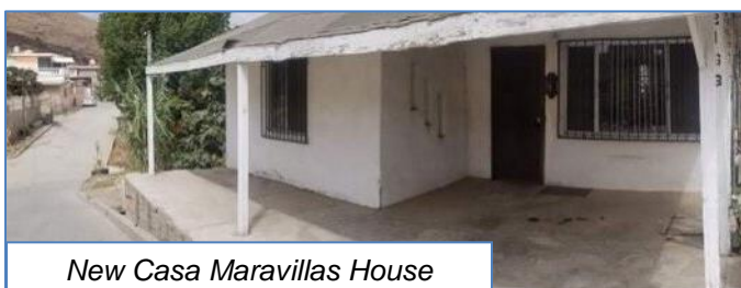
New Casa Maravillas House

Good news! We just signed the lease for a temporary house for Casa Maravillas. The house is located about five minutes away from the Deaf association and from Frances' apartment in a relatively safe neighborhood. The great thing about the house is that it is fully furnished with three bedrooms, a bathroom, kitchen and living room. It