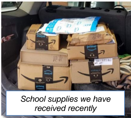
School supplies we have received recently

One of the things we have been blown away constantly is God's faithfulness and how God moves through people to come alongside this ministry with prayer, giving, and encouragement. Our latest goal is to help our local Deaf teachers and students start the school year well with all the school supplies they need. We set up an Amazon Charity List through our nonprofit Angels of Love, INC. to make the donation process as smooth as possible. We are thankful for the people who have taken their time to purchase something off the list. If you are passionate about education and interested in helping us out, you can contact us through our website or our email