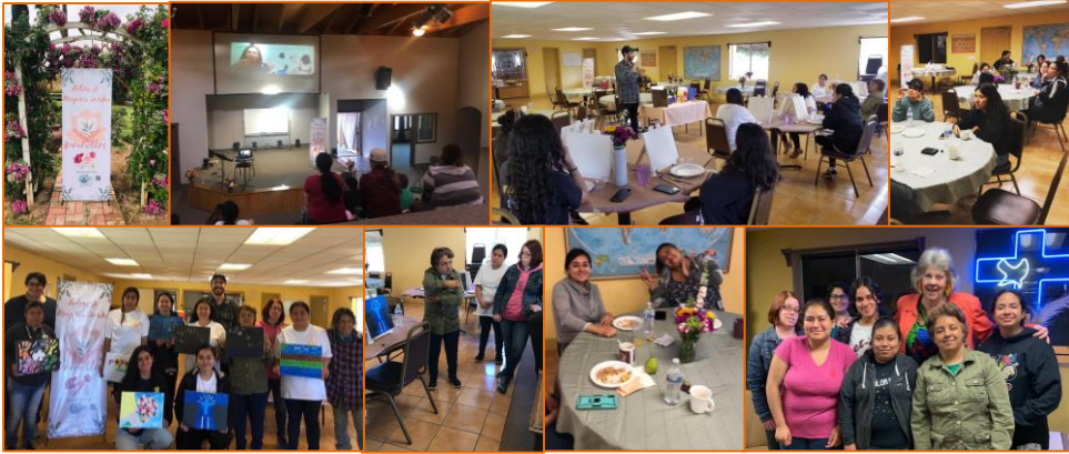
Highlights of our first Deaf women's retreat!