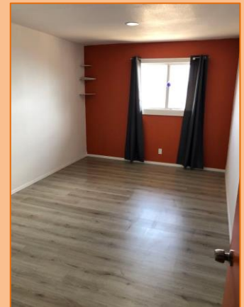
Finished room #2 at CJ