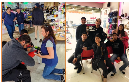
Young Deaf individuals receiving shoes

These types of tangible acts of love allow us to foster a deeper relationship with the Deaf community. During the time that they are in the store trying on different pairs of shoes, we are looking for opportunities to connect, pray, and further bless each Deaf individual.