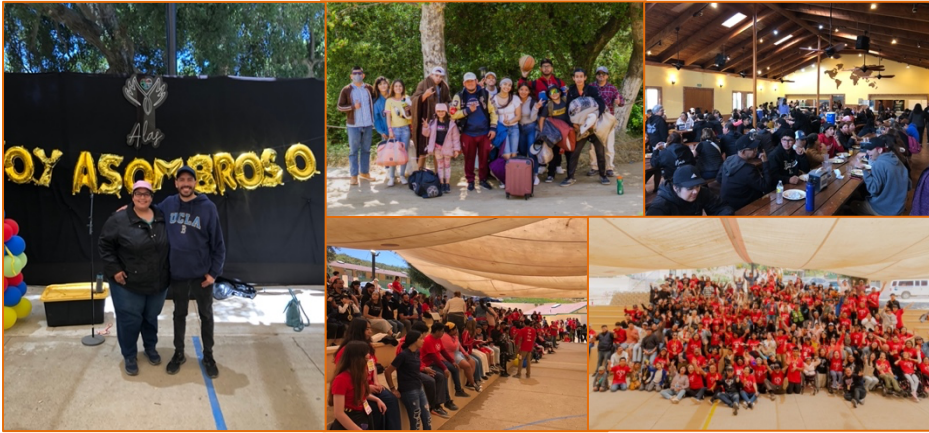
Alas Christian Camp at Agua Viva where we sponsored 20 Deaf individuals