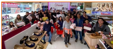
Everyone at the shoe store