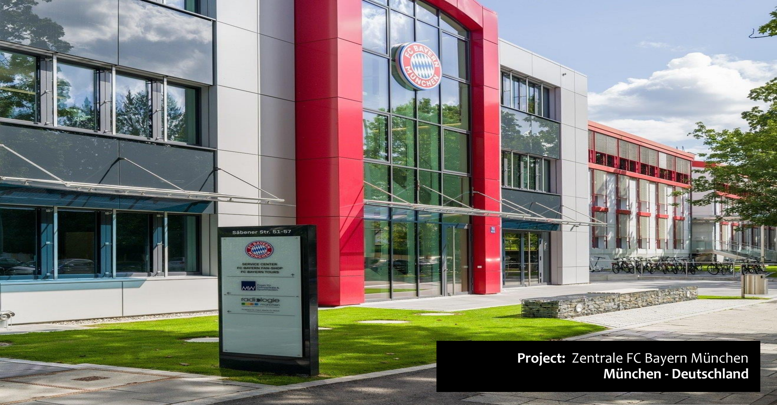
Project: Zentrale FC Bayern München München - Deutschland