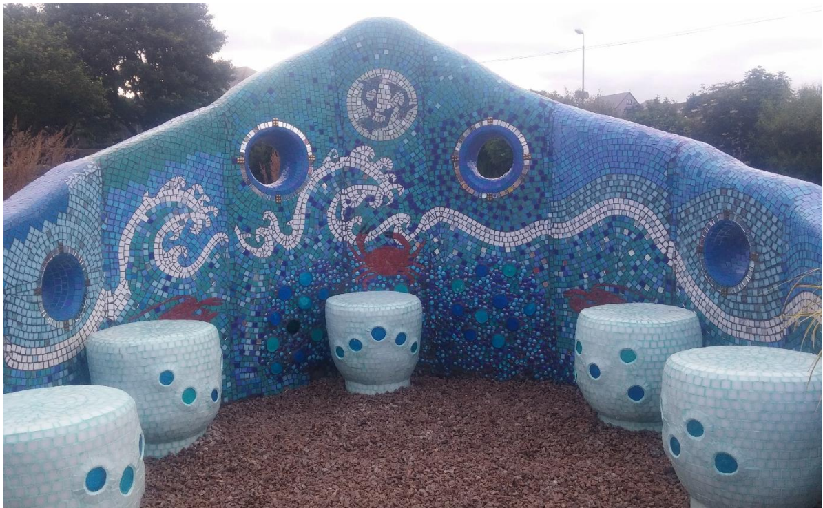
Final sculpture design showing redesign for safety, and glass inserts from community workshop sessions