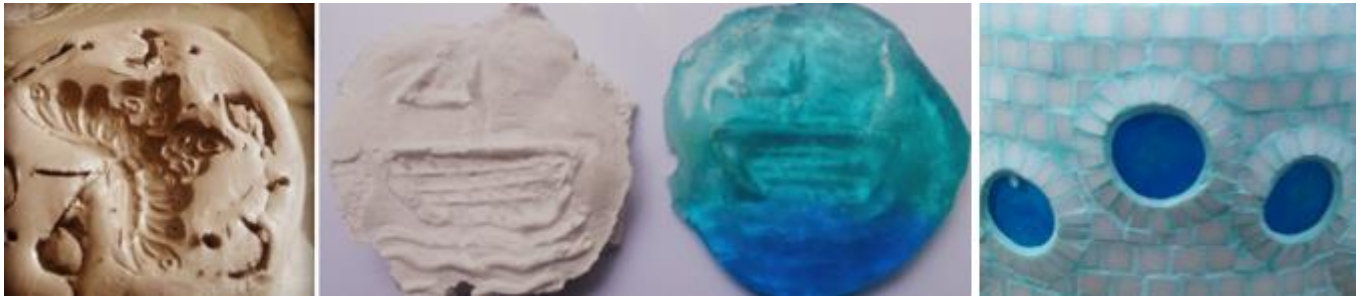
Glass artwork made during artist residency community participant workshops