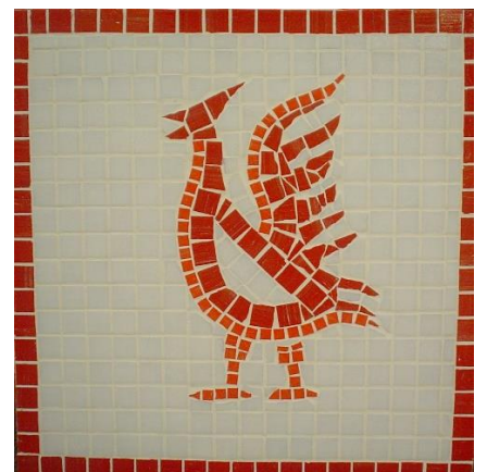
Mosaic panels made by young people who were participants in the project