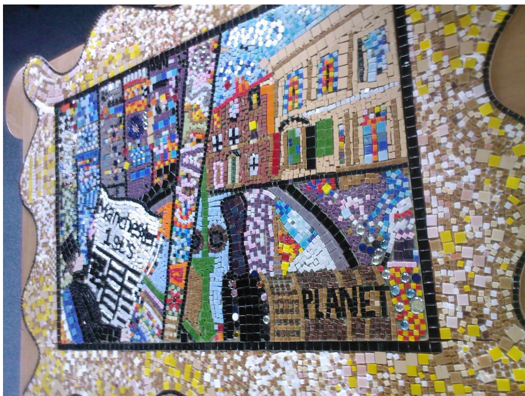
Mosaic panels made by families using the education programme at the museum