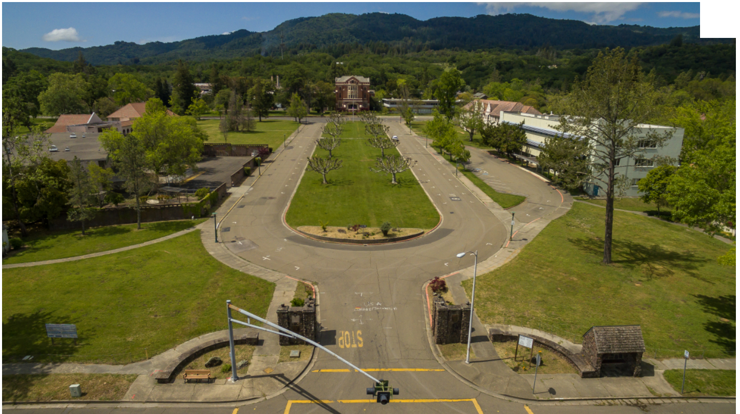
Sonoma Developmental Center main entrance along Arnold Drive looking west from the state owned former mental institution at Eldridge in the Sonoma Valley near Glen Ellen, May 10, 2023.

GLEN ELLEN >> County 'blindsided' as developer seeks to add more housing after plans approved