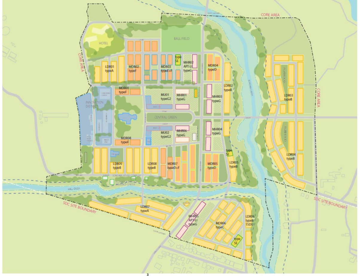
SDC-pd-082423 PDF Page 17