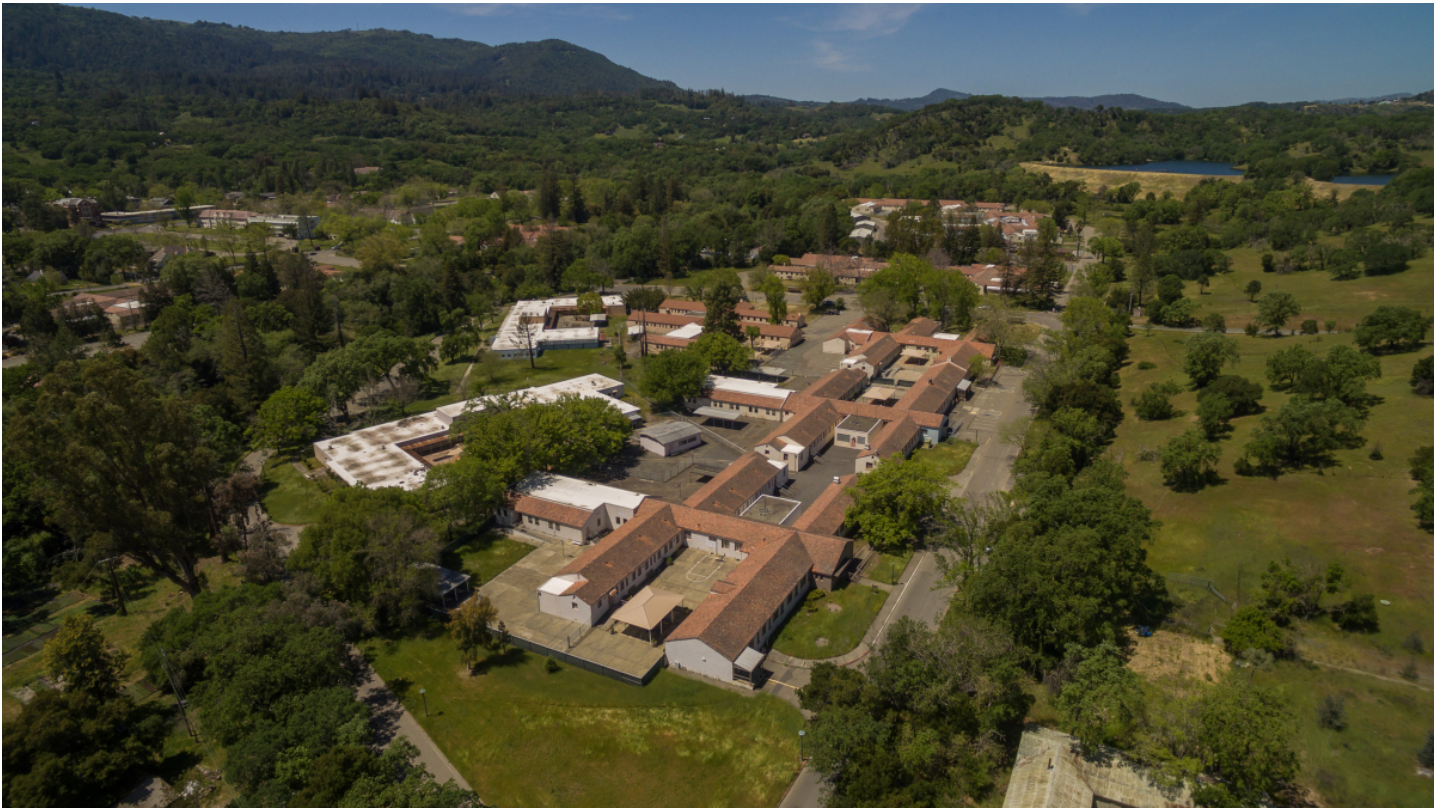
Sonoma Developmental Center looking west from building #51 “Judah.” Railroad street borders the state owned former mental institution at Eldridge in the Sonoma Valley near Glen Ellen, April 27, 2023.