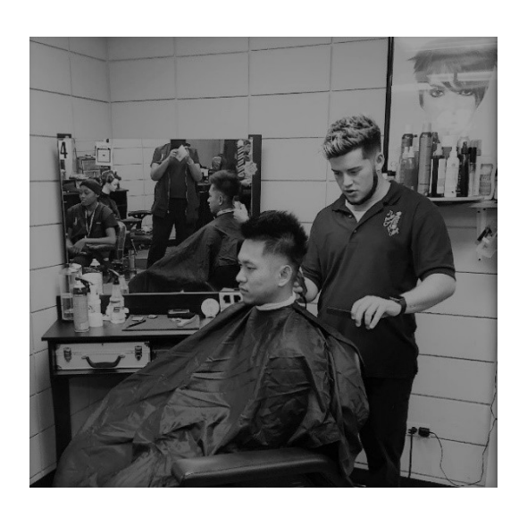
Hands on Training