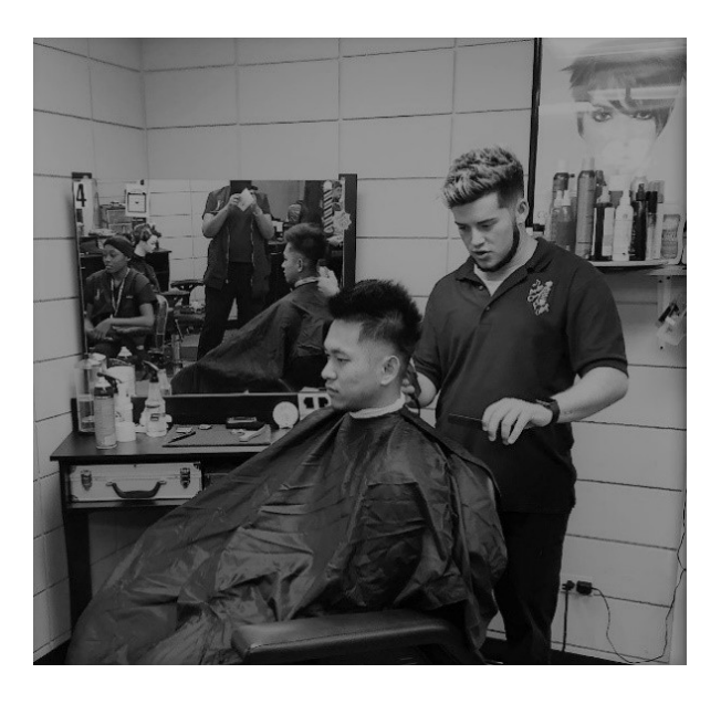
Hands on Training