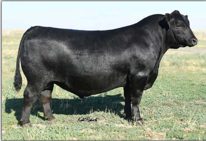
EXAR Cover The Bases 0819B - Sire of Lot 13A

SIRE: EXAR Cover The Bases 0819B ACT BW 85