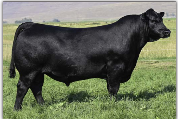
J Trademark 1037 - Sire of Lot 11A

• Breeding information available sale day.