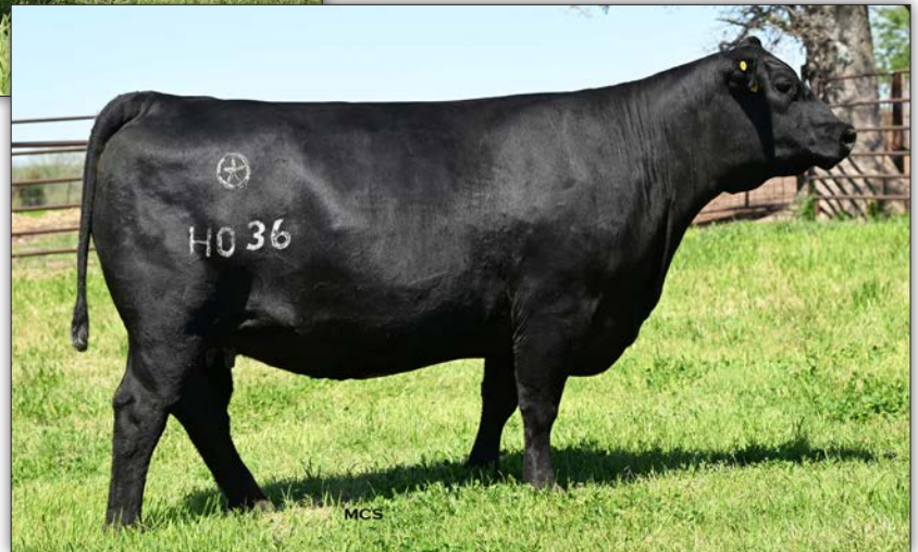
Lone Star Sunbeam Belle H036 - Dam of Lots 19A and 19B