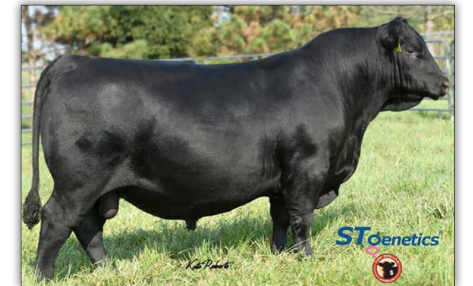
Poss Winchester - Service sire for Lots 51-54

• Dam posts progeny ratios of 1@89 for BW; 1@111 for WW; and 1@101 for YW.