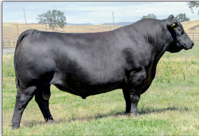
E&B Plus One - Sire of Lot 7