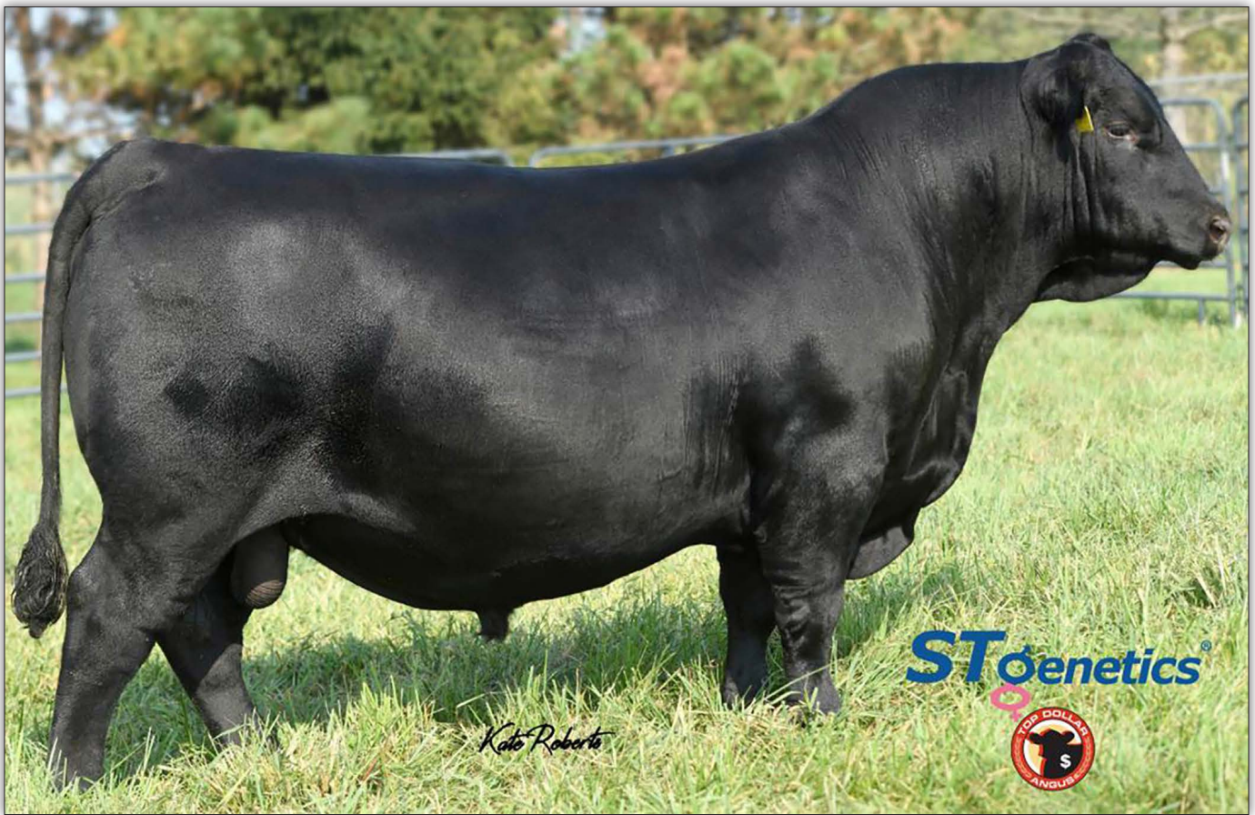
Poss Winchester - Sire of Lots 20A and 20B

The sire of Lots 20A and 20B, Winchester, was the top-selling feature bull from the 2022 Poss sale. He's one of Clarity's highest $C sons and a maternal brother to Poss Rawhide, while adding a productive and proven donor dam to his portfolio. Winchester is big footed, bold ribbed, and deep bodied with genetic, phenotypic, and maternal merit to be captured in one package and he transmits these attributes to his progeny as is evident in these two daughters.