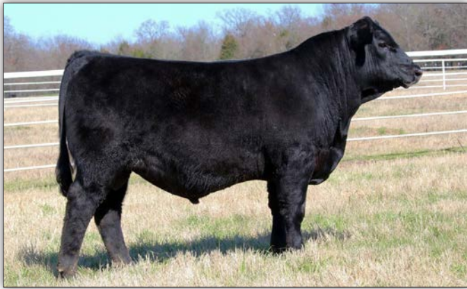
T C A Eastwood - Sire of Lots 24 and 25