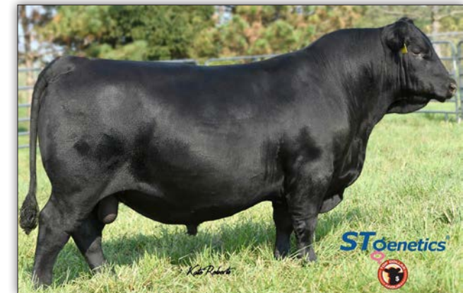
Poss Winchester - Service sire of Lots 51-54