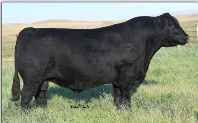
EXAR Monumental 8628B - Sire of Lots 26 and 27