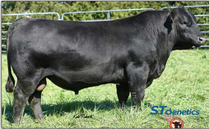
Connealy Clarity - Sire of Lot 52