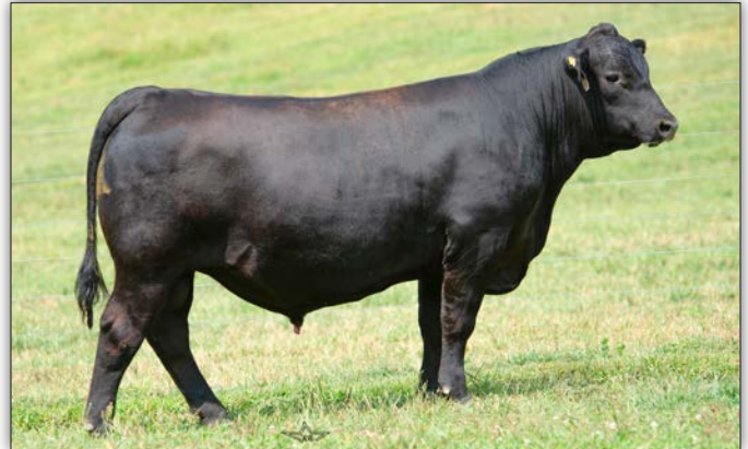
Roseda Powerball23 F091 - Sire of Lot 56 and paternal grandsire of Lot 55

• AI bred on 4/2/2023 to B I G Fleetwood.