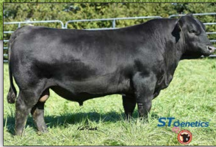
Connealy Clarity - Sire of Lots 1 and 2