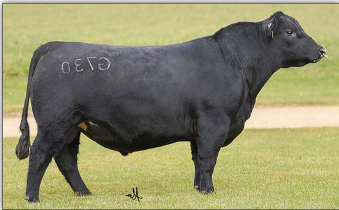
Yon Top Cut G730 - Sire of Lot 53