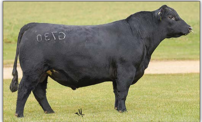
Yon Top Cut G730 - Sire of Lot 30