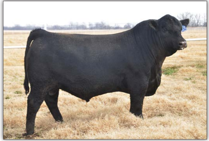
EXAR Something Special 9997B - Sire of Lot 15

• Dam posts progeny ratios of 1@88 for BW.