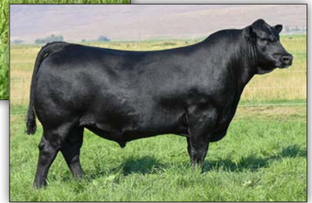
J Trademark 1037 - Sire of Lot 2A