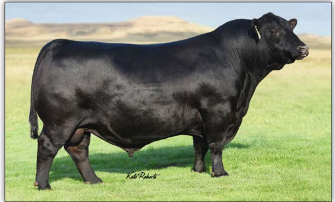
V A R Power Play 7018 - Sire of Lot 29