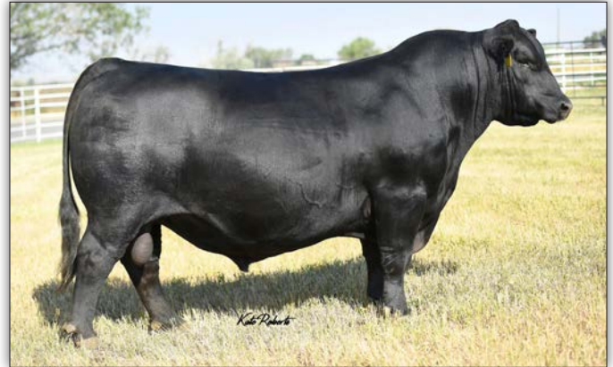
DB Iconic G95 - Sire of Lots 50 and 51

• Dam posts progeny ratios of 1@89 for BW; 1@111 for WW; and 1@101 for YW.