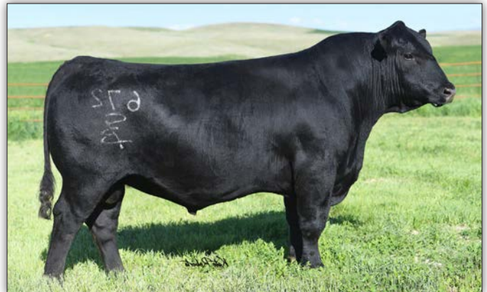
GB Fireball 672 - Sire of Lot 58

• Will be AI'd to K A Kindred prior to sale.