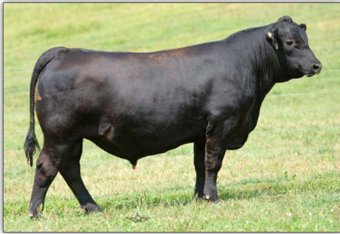
Roseda Powerball23 F091 - Sire of Lots 5 and 6