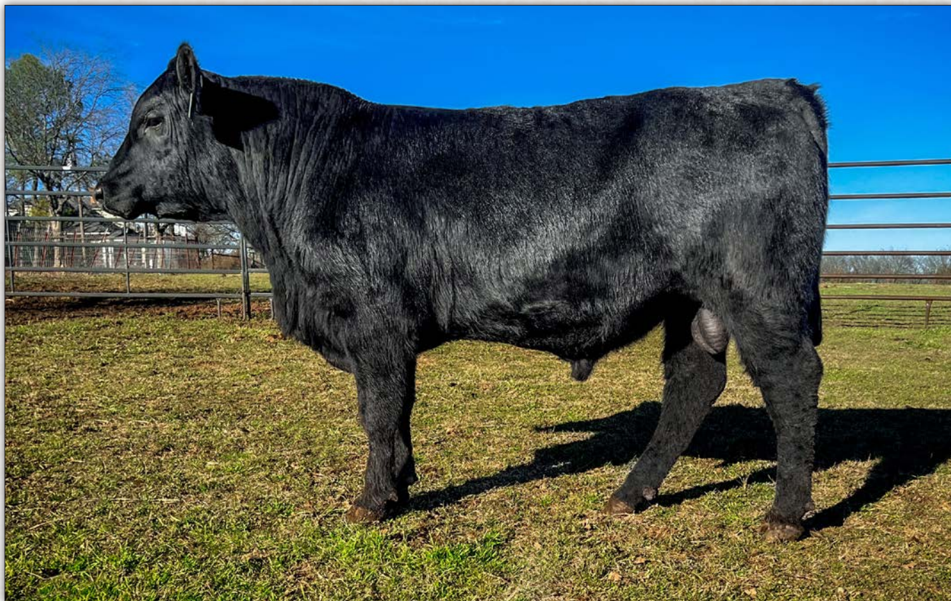
Lone Star Goalkeeper H236 - Lot 1