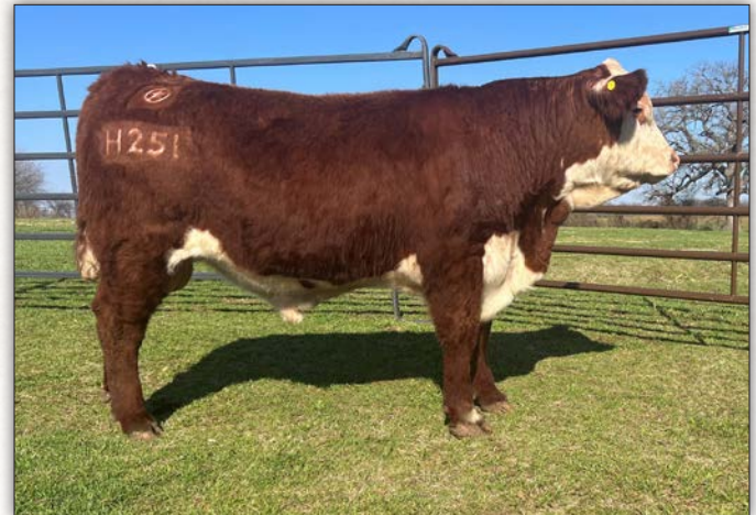
Lone Star Encore H251 ET - Lot 11

SCHU-LAR 5N OF 9L 3008 [S00][CH][DLF][HYF][EF] SCHU-LAR 208 OF 1H 121 ET [D00][HYF] MSU TCF REVOLUTION 4R [S00][DLF][HYF][EF][MDF][DBF] JW 718 VICTORIA 9106 [D00][DLF][HYF][EF] TH 121L 63N TUNDRA 16S [DLF][HYF][EF] TH 62N 3L KELSEY 22R [DLF][HYF][EF] NUW 73S W18 HOMETOWN 10Y ET [S00][CH][DLF][HYF][EF][MSU][DF][MDF] TH 97S 126X NICKY 48Z [DLF][HYF][EF]