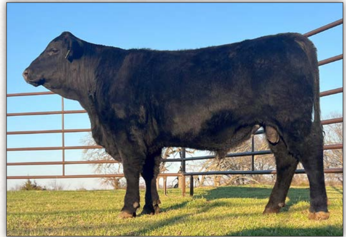
Lone Star Clarity H249 - Lot 20