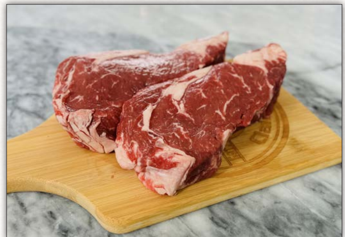
We have a few half beefs available this spring.