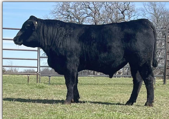
Lone Star Power Play 2403 - Lot 25