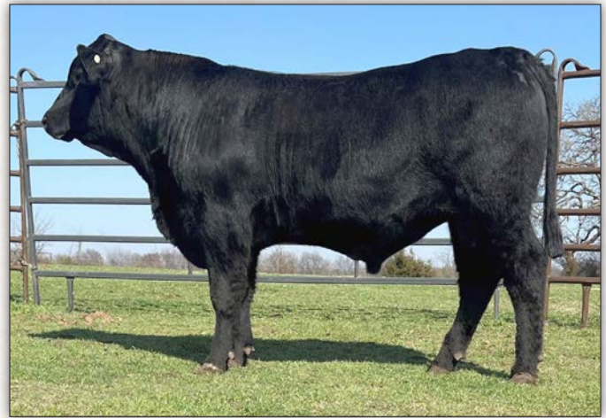
Lone Star Ashland 2291 - Lot 2