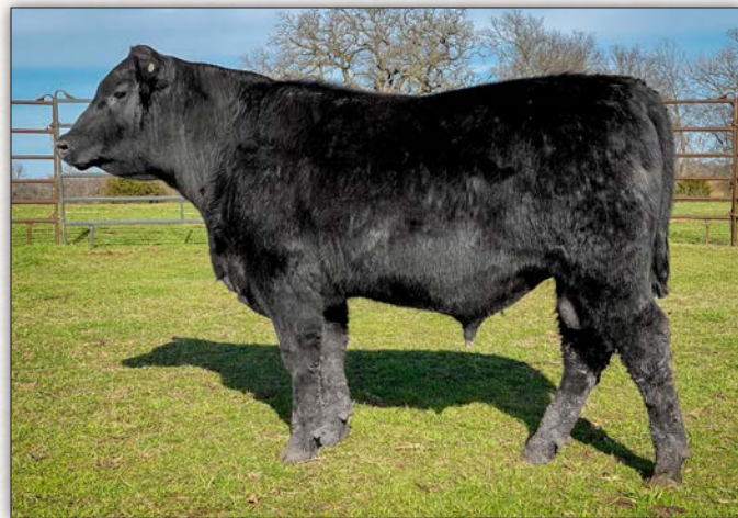
Lone Star Revolution 2023 - Lot 8