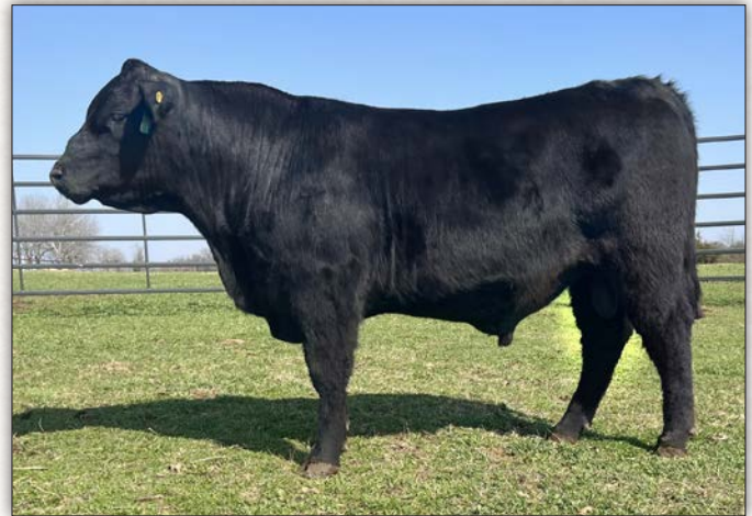
Lone Star Ashland 2297X - Lot 3