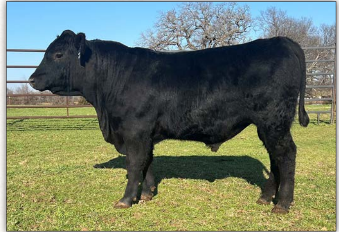
Lone Star Iconic 2271B - Lot 9