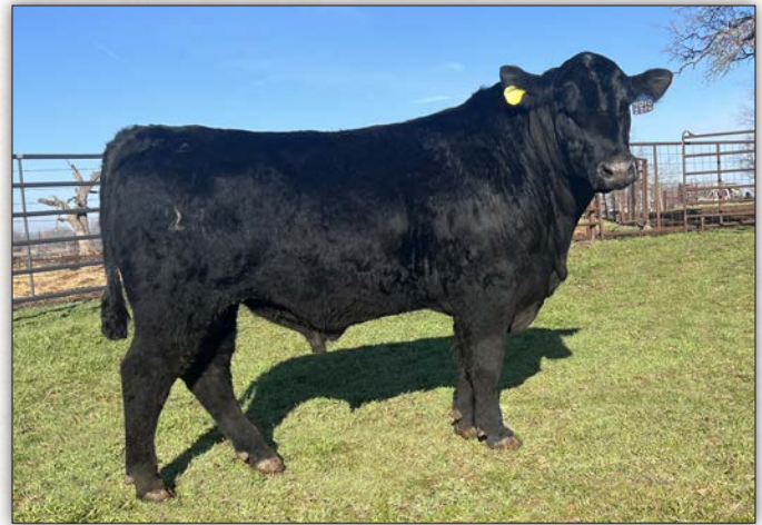
Lone Star Advance 2206 - Lot 29