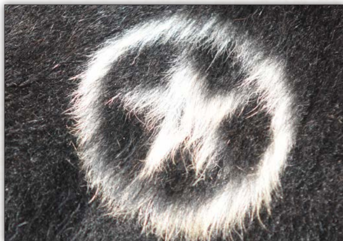
Trust the Lone Star.