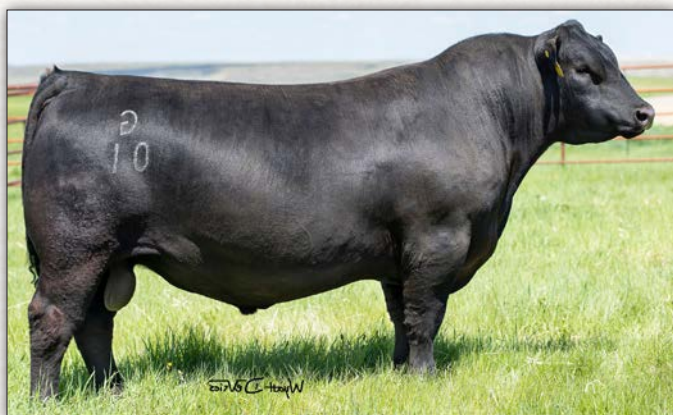
Baldridge SR Goalkeeper - Sire of Lot 1