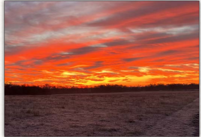
Sunrise January 1, 2024. Nice way to start the new year.

SCHU-LAR 5N OF 9L 3008 [S00][CH][DLF][HYF][EF] SCHU-LAR 208 OF 1H 121 ET [D00][HYF] MSU TCF REVOLUTION 4R [S00][DLF][HYF][EF][MDF][DBF] JW 718 VICTORIA 9106 [D00][DLF][HYF][EF] TH 121L 63N TUNDRA 16S [DLF][HYF][EF] TH 62N 3L KELSEY 22R [DLF][HYF][EF] NUW 73S W18 HOMETOWN 10Y ET [S00][CH][DLF][HYF][EF][MSU][DF][MDF] TH 97S 126X NICKY 48Z [DLF][HYF][EF]