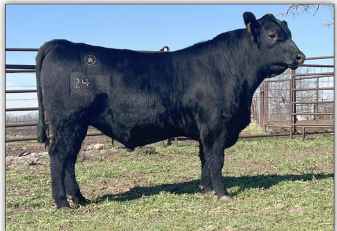
Lone Star Storm 2411 - Lot 57