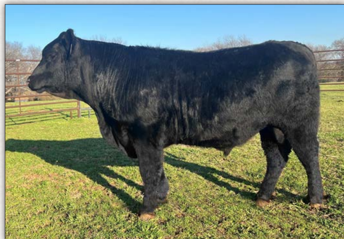
Lone Star Ashland 2251 - Lot 34