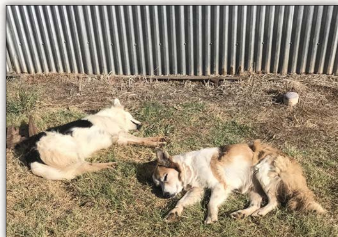
The coddogs and I are having no problems with this early spring