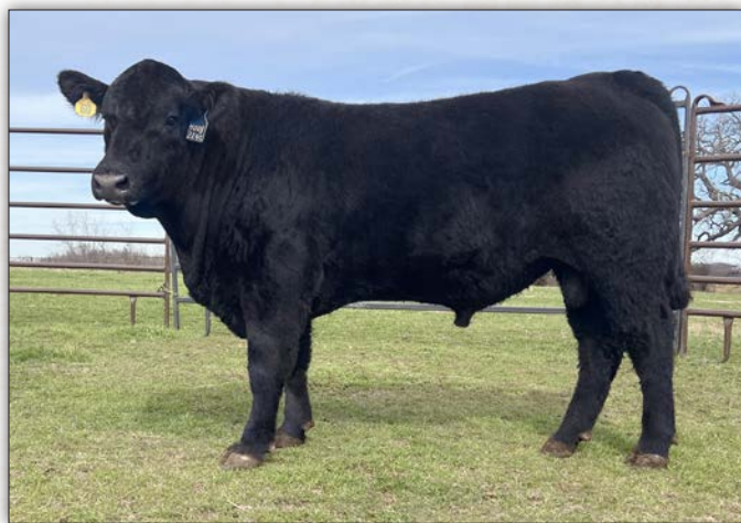
Lone Star Special 2245 - Lot 60