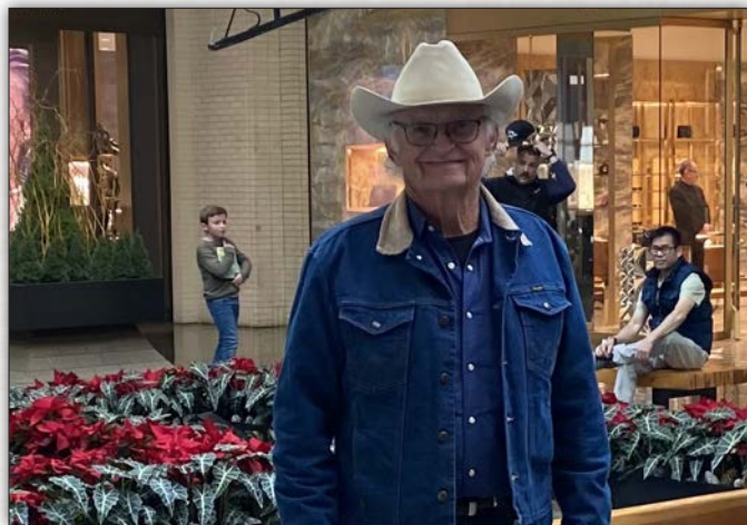
A Christmas tradition is shopping at North Park.