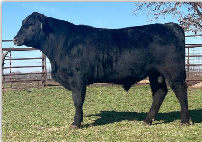
Lone Star Hometown H232 - Lot 40