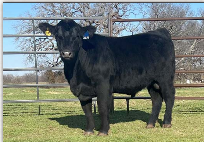
Lone Star Ashland 2273B - Lot 32