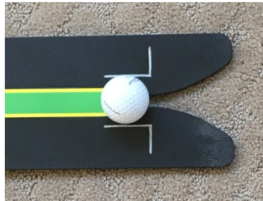
Eyes Inside Target Line

You can see on the above picture that the ball just touches the two lines on either side. You will see this once your eyes are directly over the target line.