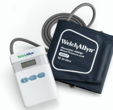
CONFIRM Welch Allyn ABPM 7100 Blood Pressure Monitor