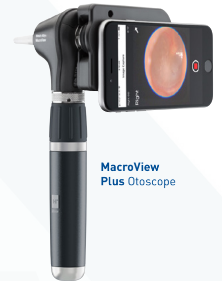
MacroView Plus Otoscope