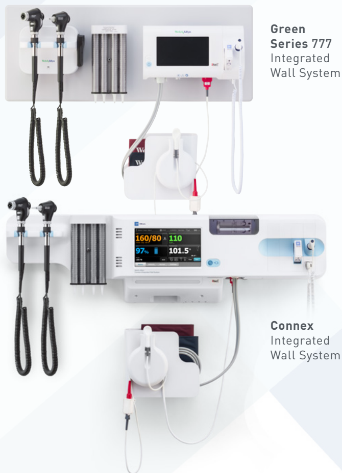
Green Series 777 Integrated Wall System

Put the diagnostic tools you need to collect vital patient data within arm's reach. Both of our wall systems — the Welch Allyn Green Series 777 Integrated Wall System and the Welch Allyn Connex Integrated Wall System — have you covered. Examine the eyes and ENT structures with our next-generation wide-view ophthalmoscopes and otoscopes and capture blood pressure, temperature and SpO 2 within one, easy-to-install system.