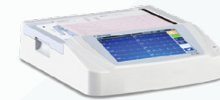
ELI 280 Resting ECG

Our VERITAS resting ECG algorithm provides high-fidelity data to support better decision-making.