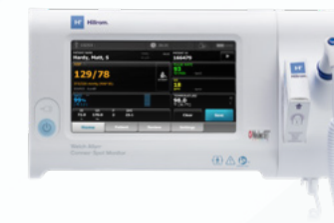
IDENTIFY Welch Allyn Connex Spot Monitor

That's where we come in. See how our Welch Allyn vital signs devices, automated blood pressure monitor and home blood pressure monitoring solutions can help you detect, confirm and manage hypertension.