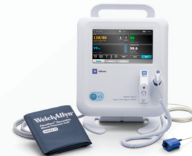
IDENTIFY Welch Allyn Spot Vital Signs 4400 Device