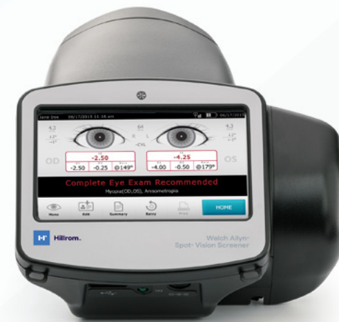
Spot Vision Screener