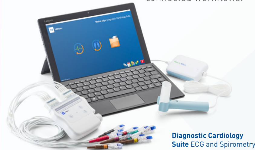
Diagnostic Cardiology Suite ECG and Spirometry

Baxter's cardiopulmonary devices and software can help you address cardiorespiratory concerns in primary care with our simple, secure, connected workflows.