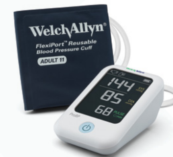
MANAGE Welch Allyn Home Hypertension Program