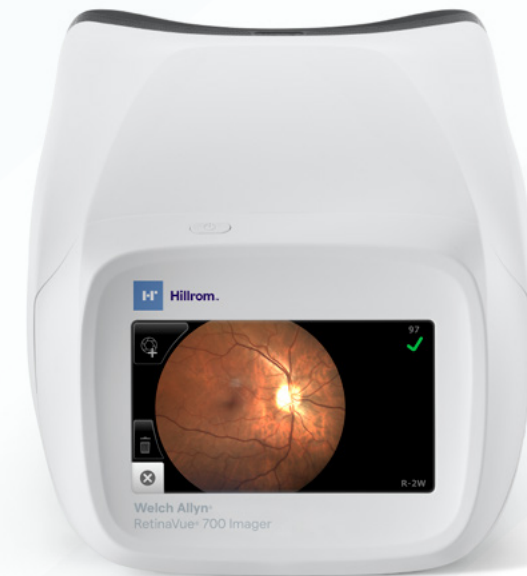
RetinaVue 700 Imager

The Welch Allyn RetinaVue care delivery model makes diabetic retinal exams simple and affordable for community health centers.