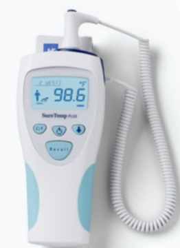
SureTemp Plus Oral/Axillary/Rectal Thermometer

Advance your temperature routine with Welch Allyn oral and ear thermometers. Quickly and accurately capture temperature readings across multiple body sites that are comfortable for patients.