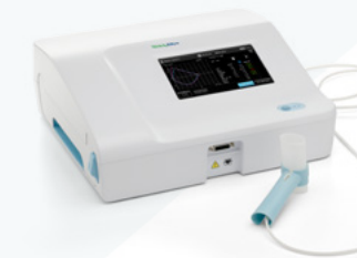
CP 150 Resting ECG with Optional Spirometry