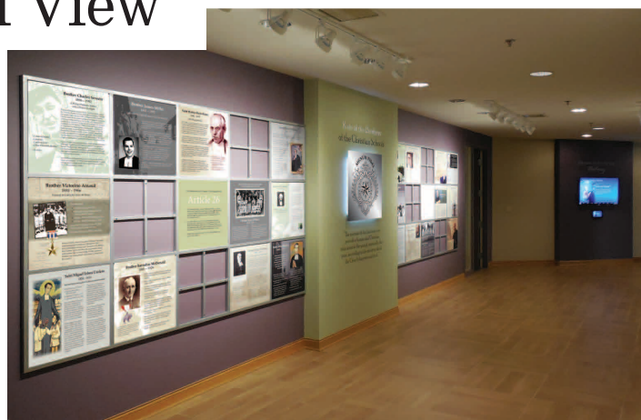
Lasallian Hallway of History

Exciting news...Stage One of the CBS remodeling project is complete. Stage One included repainting select interior walls in accent colors, which coordinate with the CBS palette of colors; the remodeling of the front lobby and Boardroom foyer area, which is now referred to as the "Lasallian Hallway of History"; the "Lasallian Mission Wall" outside of the employee lounge, which features the large collage of Lasallian student photos; and the "Leadership Wall" outside of Office Services which showcases portraits and biographies of CBS' leaders. The cooperation and hard work of many employees made this year-long project a reality. Kudos to: