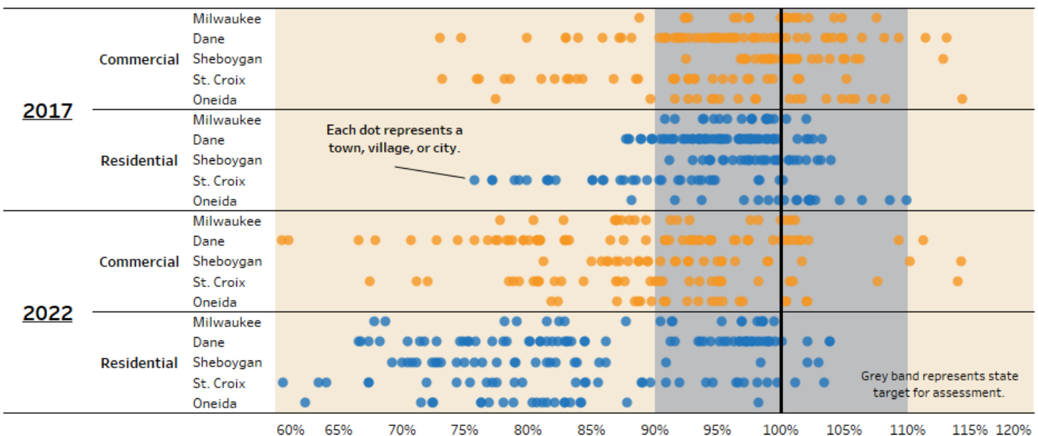
Figure 3: Commercial Property Now Assessed Closer to Market Value Than Residential Property Assessment ratios for commercial and residential properties in selected counties, 2017 vs. 2022

As Figure 3 on the previous page shows, the median assessment ratio in 2017 for commercial property across all 160 communities was 96.9%, whereas for residential property it was 95.8%. In just 26 – or 16.3% – of those municipalities were the two classes of