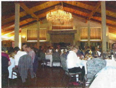
Kautz Ironstone Winery Music Room