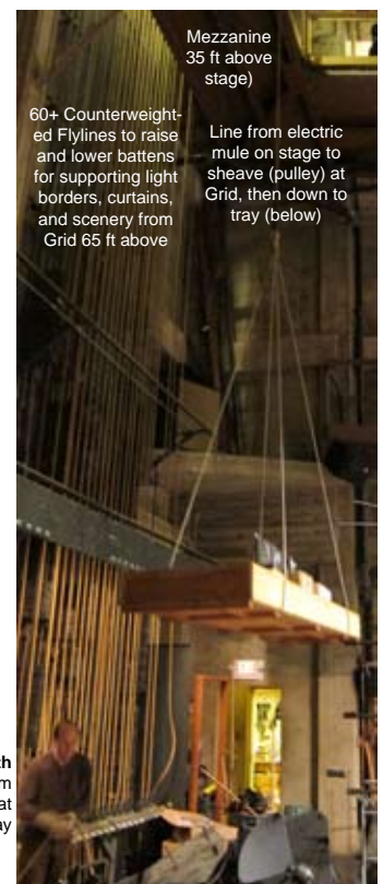
Mezzanine 35 ft above stage)

But there is a lot you didn't see. Have you ever wondered where the CDs and Records that are for sale are stored? And what about the huge A-Frame signs showing where to come in, and other such things? Many of these and other things are stored high up on the mezzanine where the diaphones and extra organ pipes live.