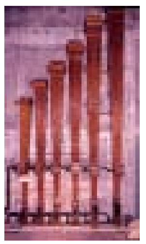
The 32' Wood Diaphone Set. The six pipes each play two notes by opening a trap door at the top.