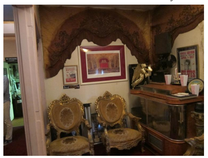
Majestic Theatre Lobby