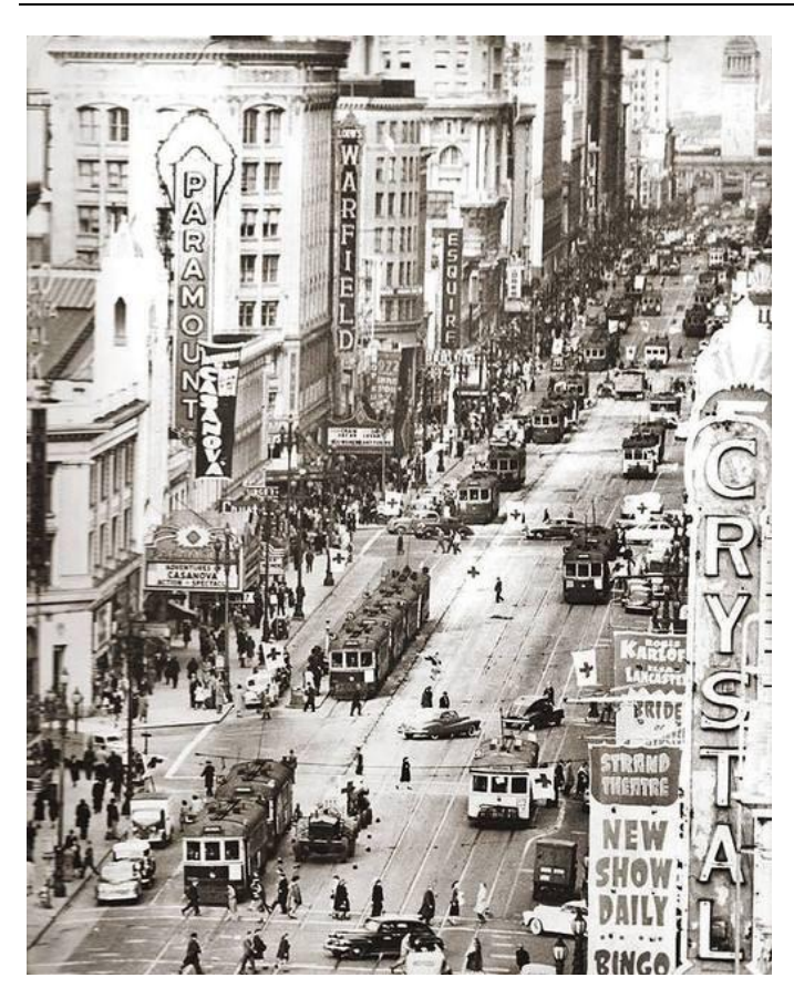
Market Street, San Francisco in the day...