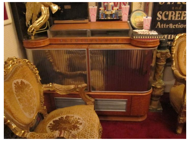
Majestic Theatre Lobby