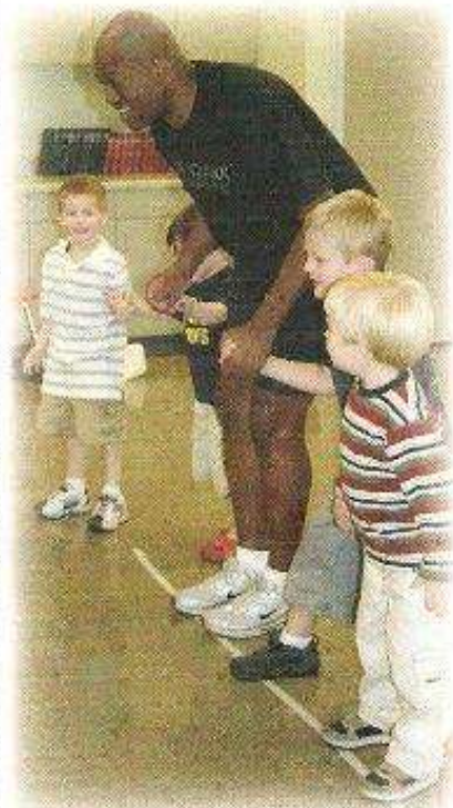
At play at First United Methodist Church Richardson.