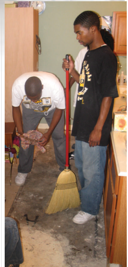
▲ College brothers help clean widow's flooded home.