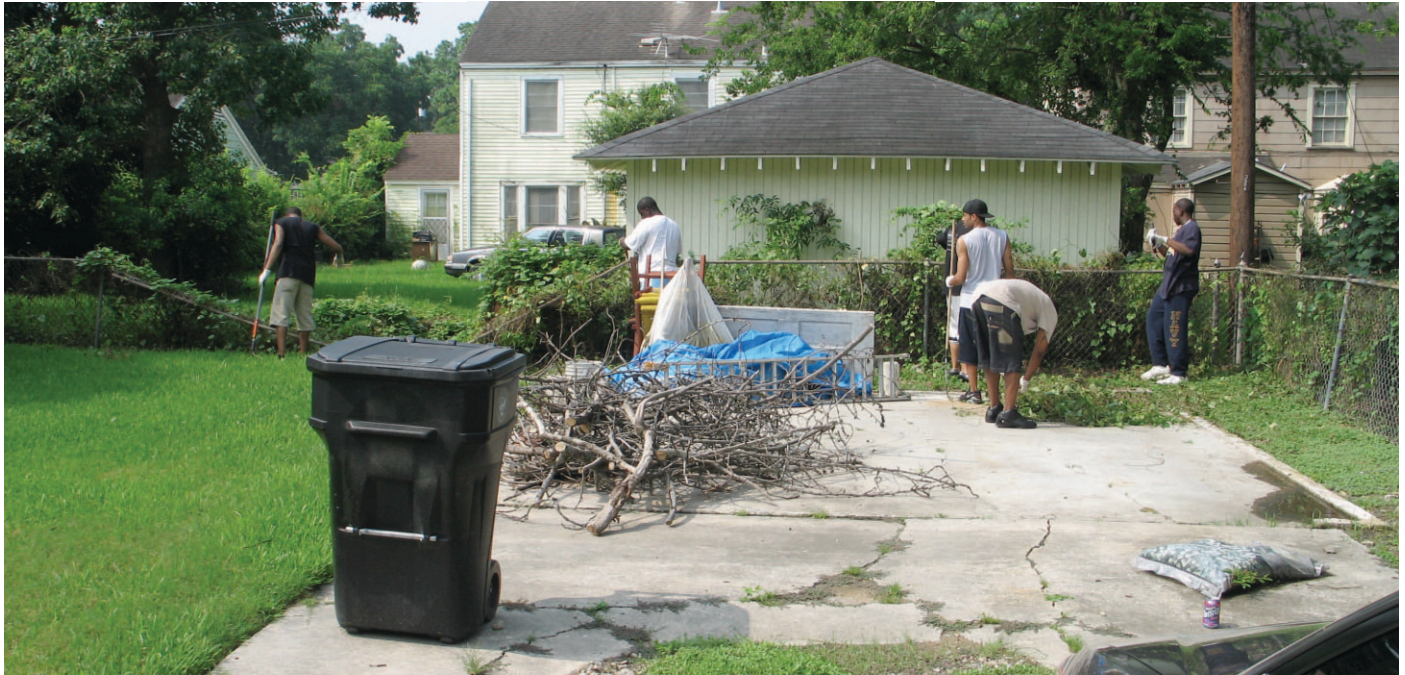
College brothers landscape and repair Alpha widow's fence.

The National Office will provide a template for operation, education, and training on the Brother's Keeper Program. The National Office will also assist in identifying and recommending qualified assistance programs, funding support, and key contacts for the program.