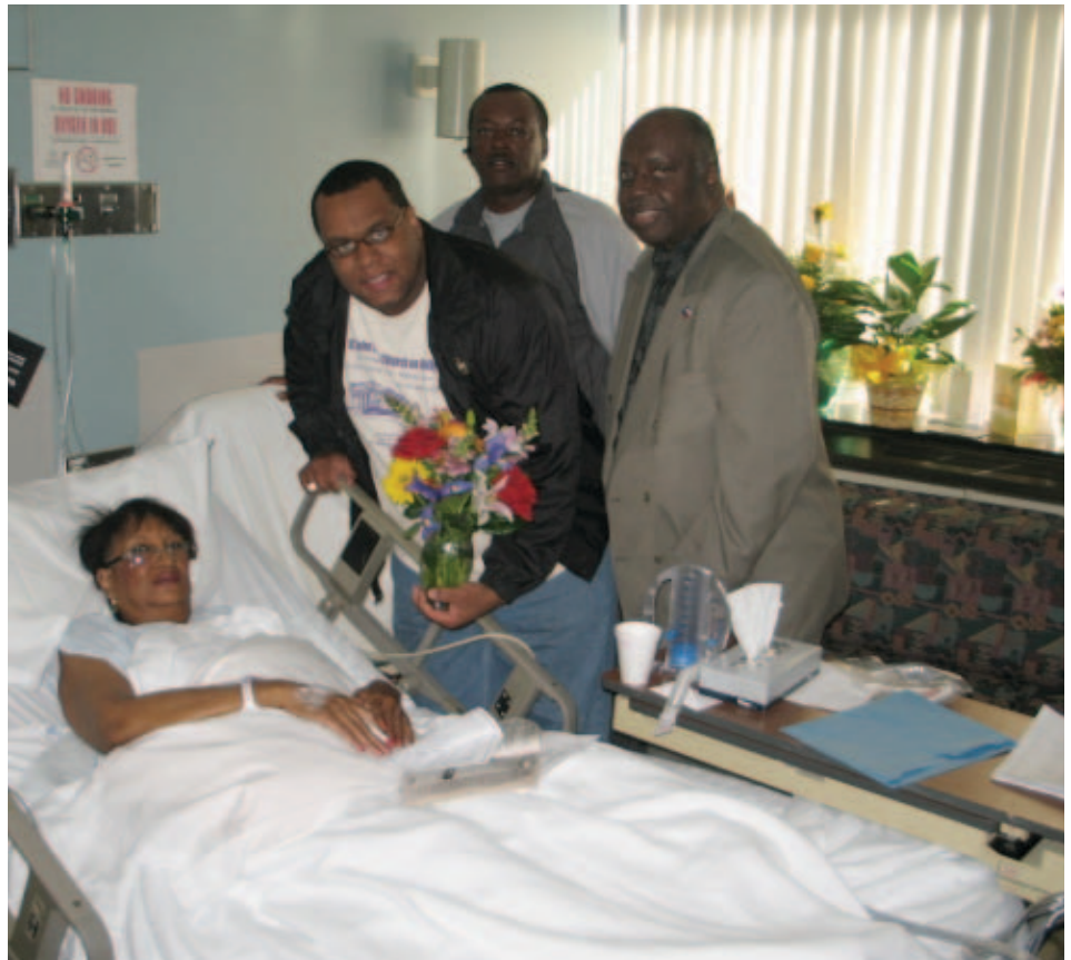
Alpha spiritual team provides encouragement to Alpha mother fighting cancer.

Caregivers should help the elder tap into appropriate community-based resources. Caregivers should identify expectations of the elder, find out what they believe is helpful, explore the elder's feelings about getting help, and gather information on the family (nuclear or extended). It is important to