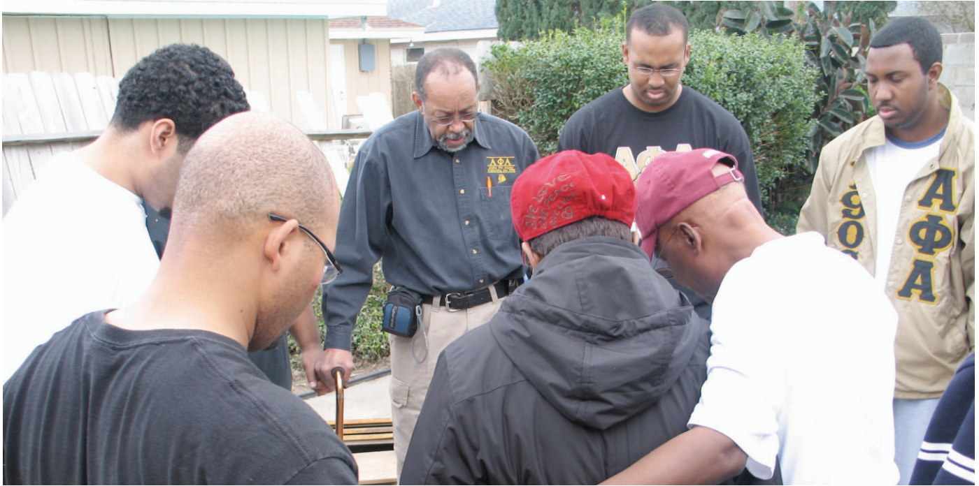
Brothers provide resources and pray for Alpha family members.

As our legacy for community service dictates, we must lead by example. We should demonstrate respect for our elders and their families within our own fraternal organization. Many of our elderly brothers have dedicated their lives in service to Alpha Phi Alpha and to their communities. It is out of deep admiration, appreciation, and respect for this body of work that Brother's Keeper has been developed.