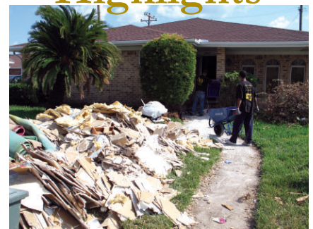
▲ Ike Brother's Keeper efforts Brothers of Texas Council of Alpha Chapters help brothers in local area.