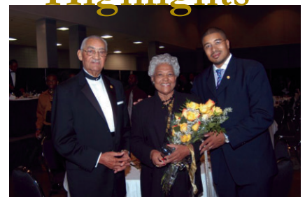
Alpha Widows and Seniors Go to Alpha Formal Ball