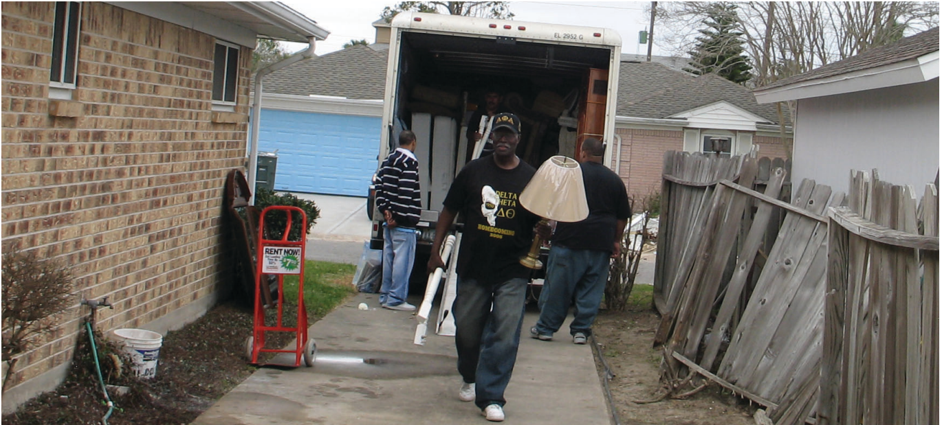
Brothers help unload truck filled with furniture and clothing for Alpha seniors affected by Hurricane Ike.

Also in 2006, 20% of all older persons had a bachelor's degree or higher. Among the most frequently occurring conditions among Black elderly in 2004–2005 were: hypertension (58%), diagnosed arthritis (46%), cardiovascular diseases (22%), sinusitis (15%), diabetes (23%), and cancer (12%). The comparable figures for all older persons were: hypertension (48%), diagnosed arthritis (47%), cardiovascular diseases (29%), sinusitis (14%), diabetes (16%), and cancer (20%). In 2006, 44% of Black elderly had both Medicare and supplementary private health insurance, whereas 56% of all elderly had both Medicare and supplementary private health insurance.