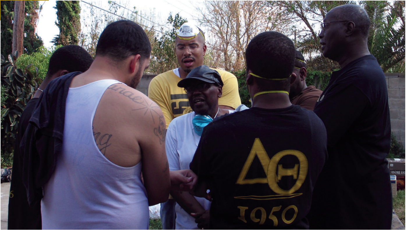
Brothers pray for Alpha brother affected by Hurricane Ike.

miles of a coast. Many of these areas, especially the Atlantic and Gulf coasts, are in the direct path of future hurricanes.