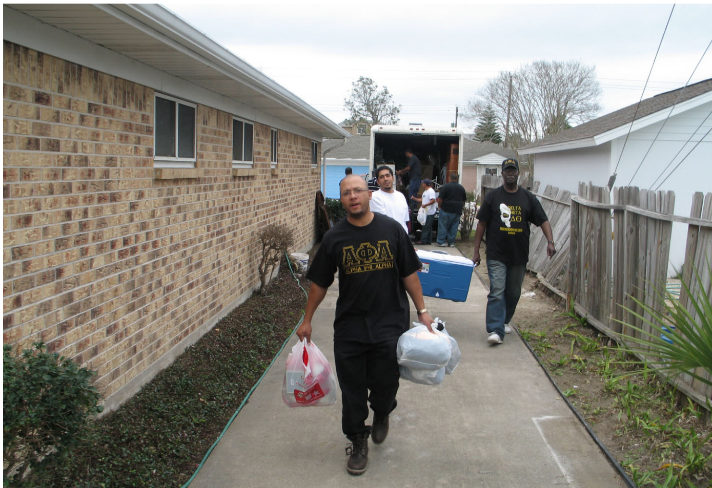
Brothers provide a truck load of food, water, furniture, and clothing to Alpha seniors affected by Hurricane Ike.

Objective 7. Ensure adequate supplies of food, water, shelter, and clothing, with special emphasis on disaster management and recovery