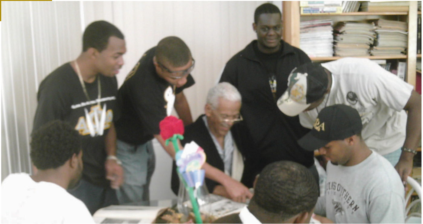
College brothers fellowship with senior Alpha brother and gain knowledge of Alpha and HBCU histories.