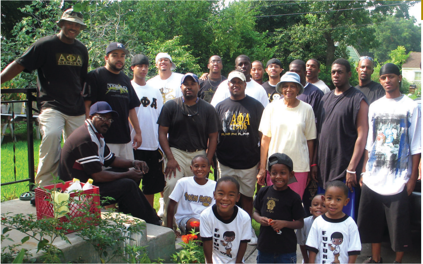
Alpha brothers model love for all mankind to their children, mentees, and Brother's Keeper recipient.

Brother's Keeper objectives. Each team member should form sub-teams to assist with the accomplishment of the objective(s).