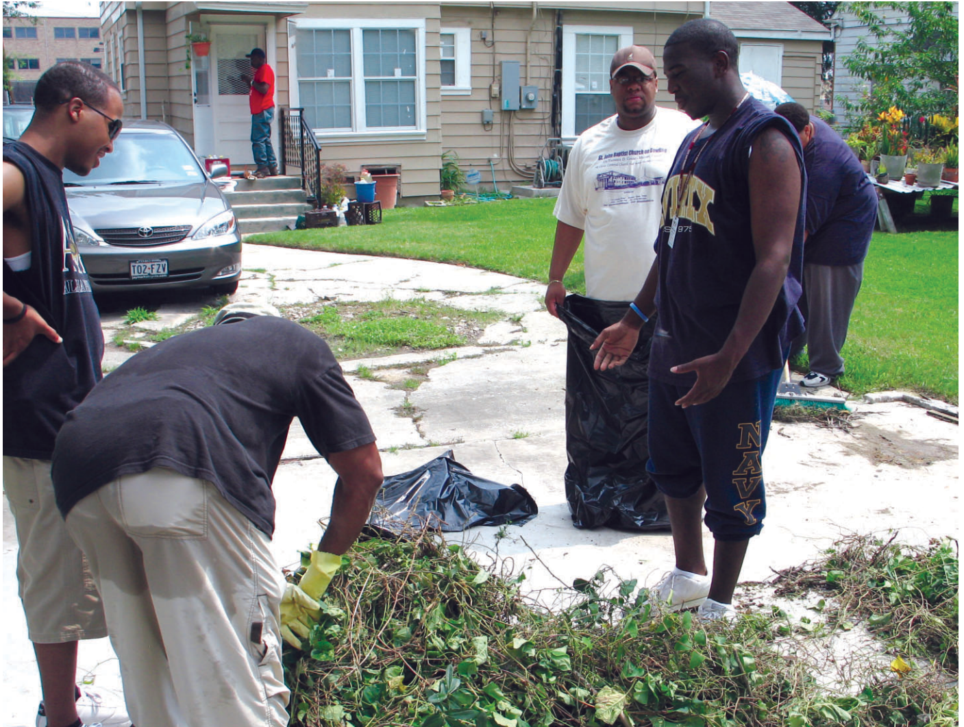
College brothers complete landscaping of Alpha widow's yard.

Objective 1. Assist in maintaining living environments that are compatible with program participants' levels of functioning