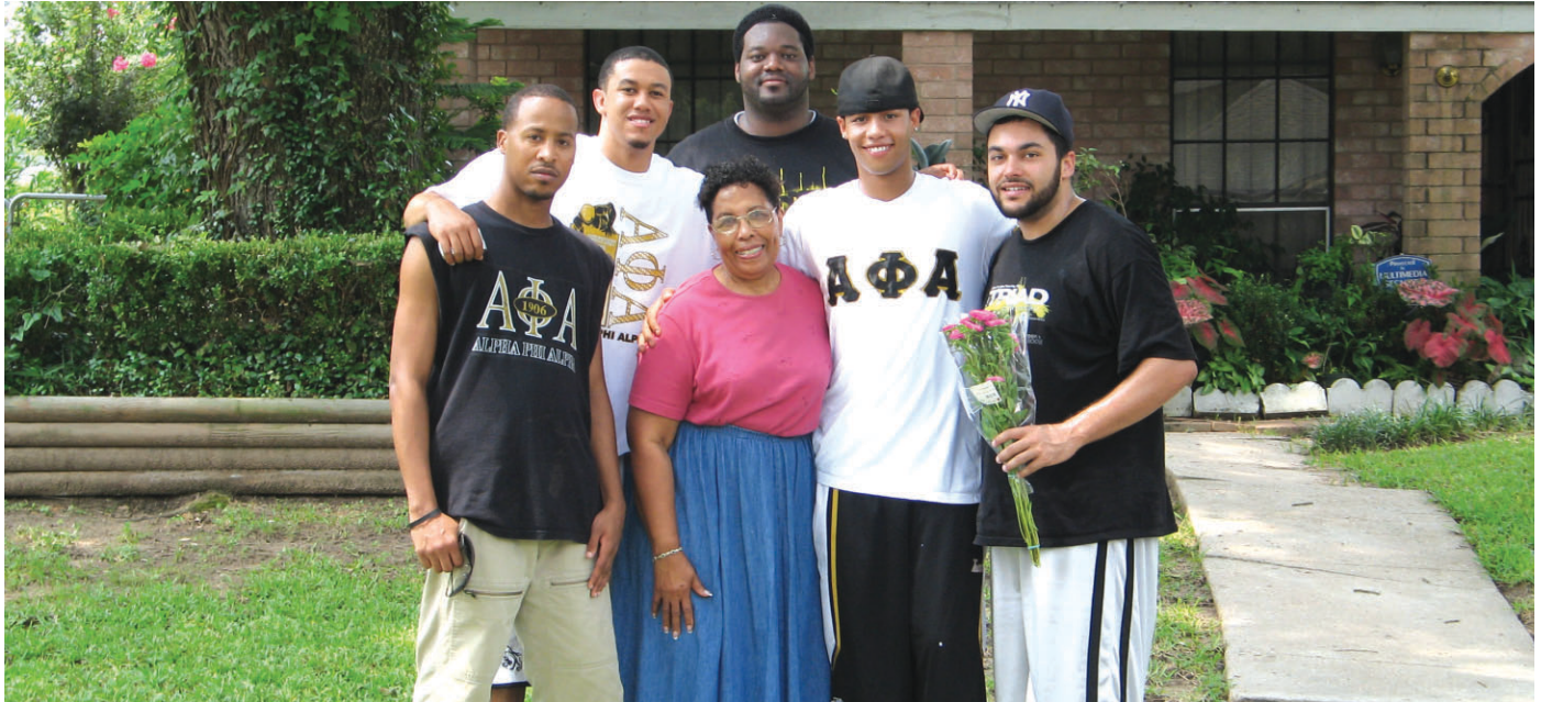
College and Alumni brothers provide flowers and visitation to Alpha widow.

More than 37 million Americans are age 65 and older. Over the next 40 years, the number of people age 65 and older is expected to double, and the number of people age 85 and older is expected to triple, due, in part, to longer life spans.