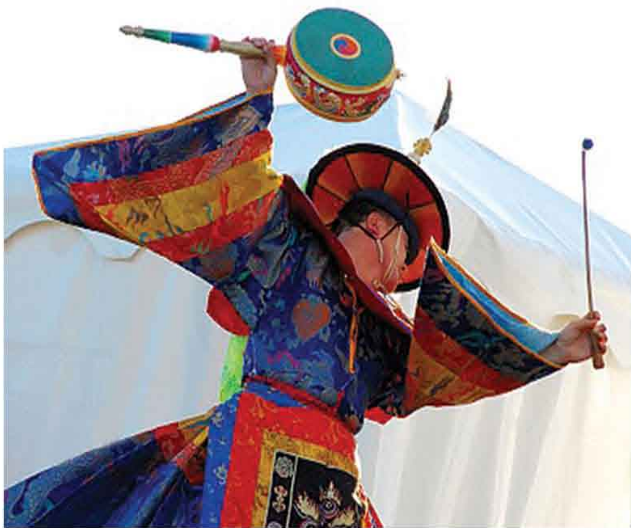
Karma Rinpoche performing sacred Black Hat Dance