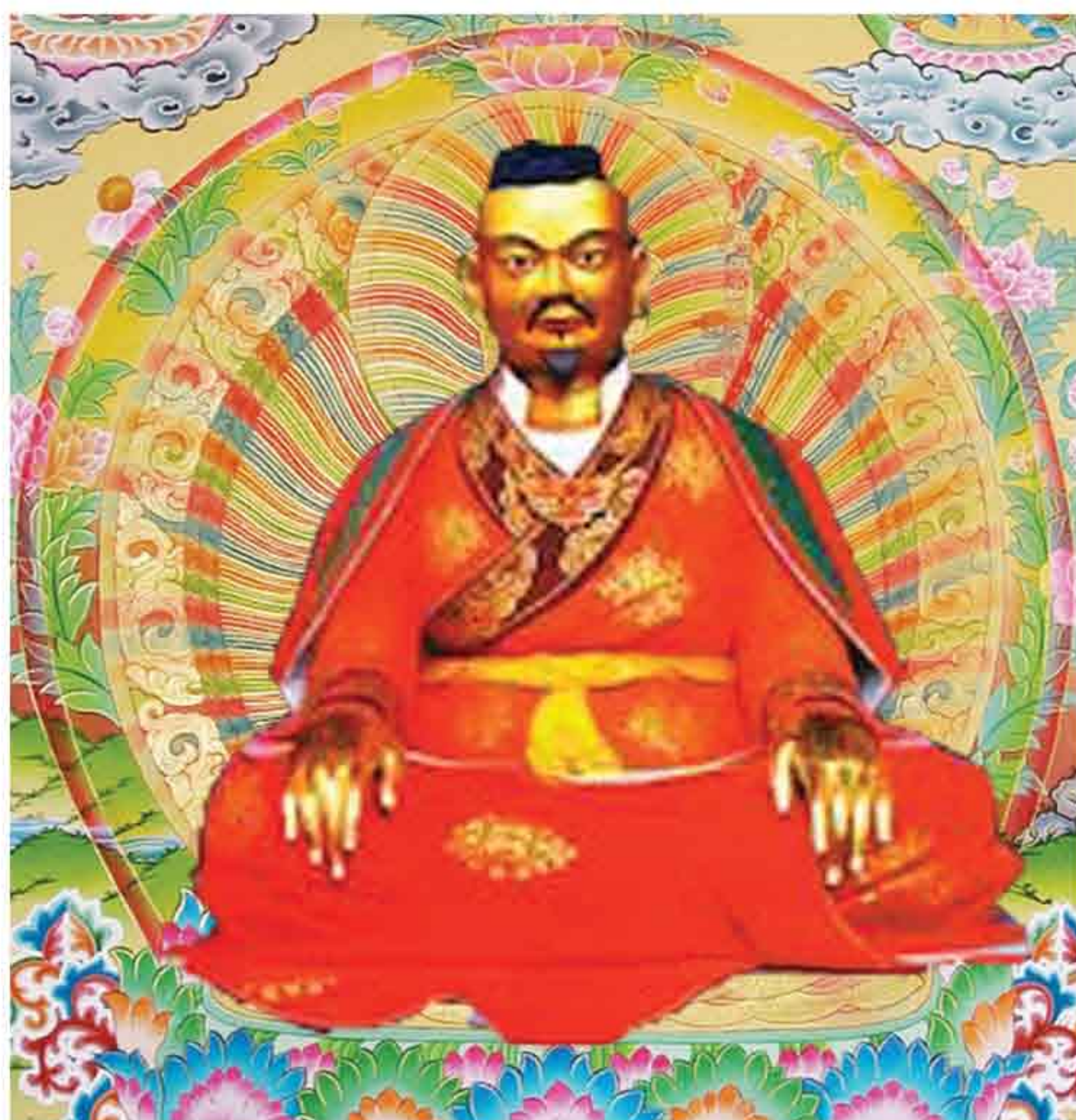
Phajo Drugom Zhigpo