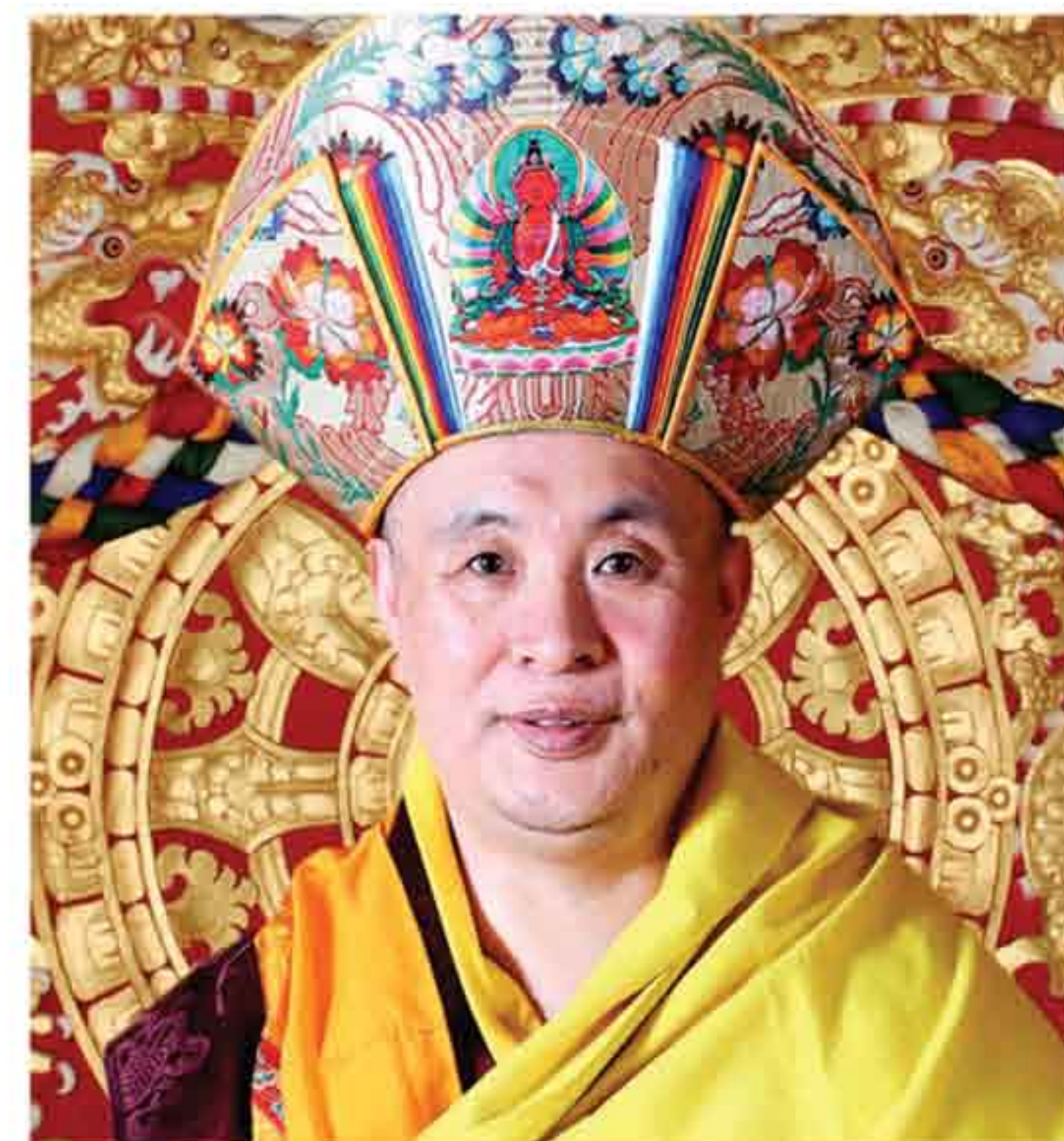
70th Je Khenpo

Of particular note, it also must be communicated here that on September 4, 2022, Karma Rinpoche was elevated to a newly created official position by the present 70th Je Khenpo of Bhutan, Tulku Jigme Chhoeda. The position is to act as the appointed representative of the Je Khenpo of the Drukpa Kagyu lineage of Bhutan, not only to the world, but more particularly to Bhutanese embassies worldwide, and all Bhutanese communities outside Bhutan. The creation of this new position then can be seen as manifesting a twofold intent. For one, it expresses the deepening desire of Bhutan's Drukpa Kagyu lineage to introduce itself to the world as a longstanding leading light of Vajrayana Buddhism. For the other, it acknowledges the increasing need to spiritually shepherd the growing numbers of Bhutanese people living outside of Bhutan--a situation only known to contemporary Bhutan.