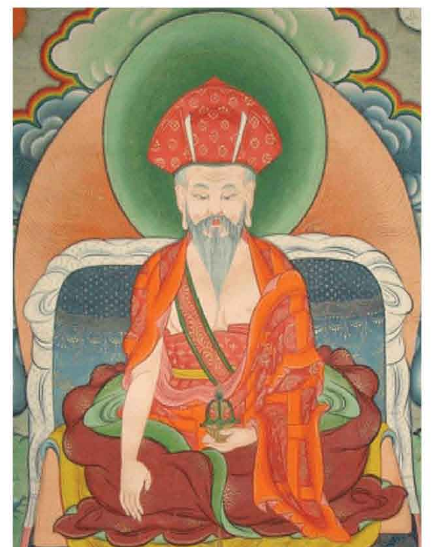
Shabdrung Ngawang Namgyal