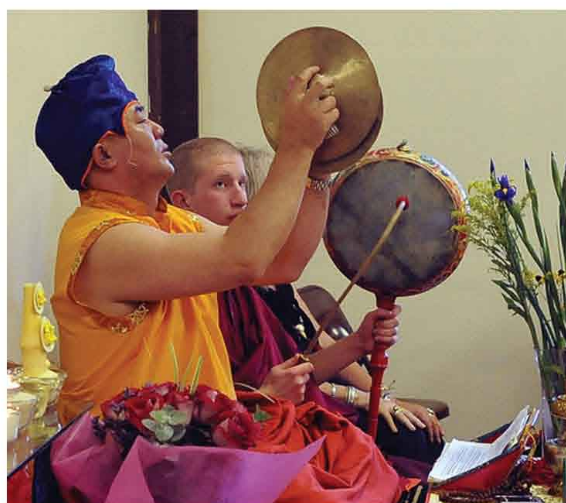
Sadhana Recitation with Ritual Musical Instruments