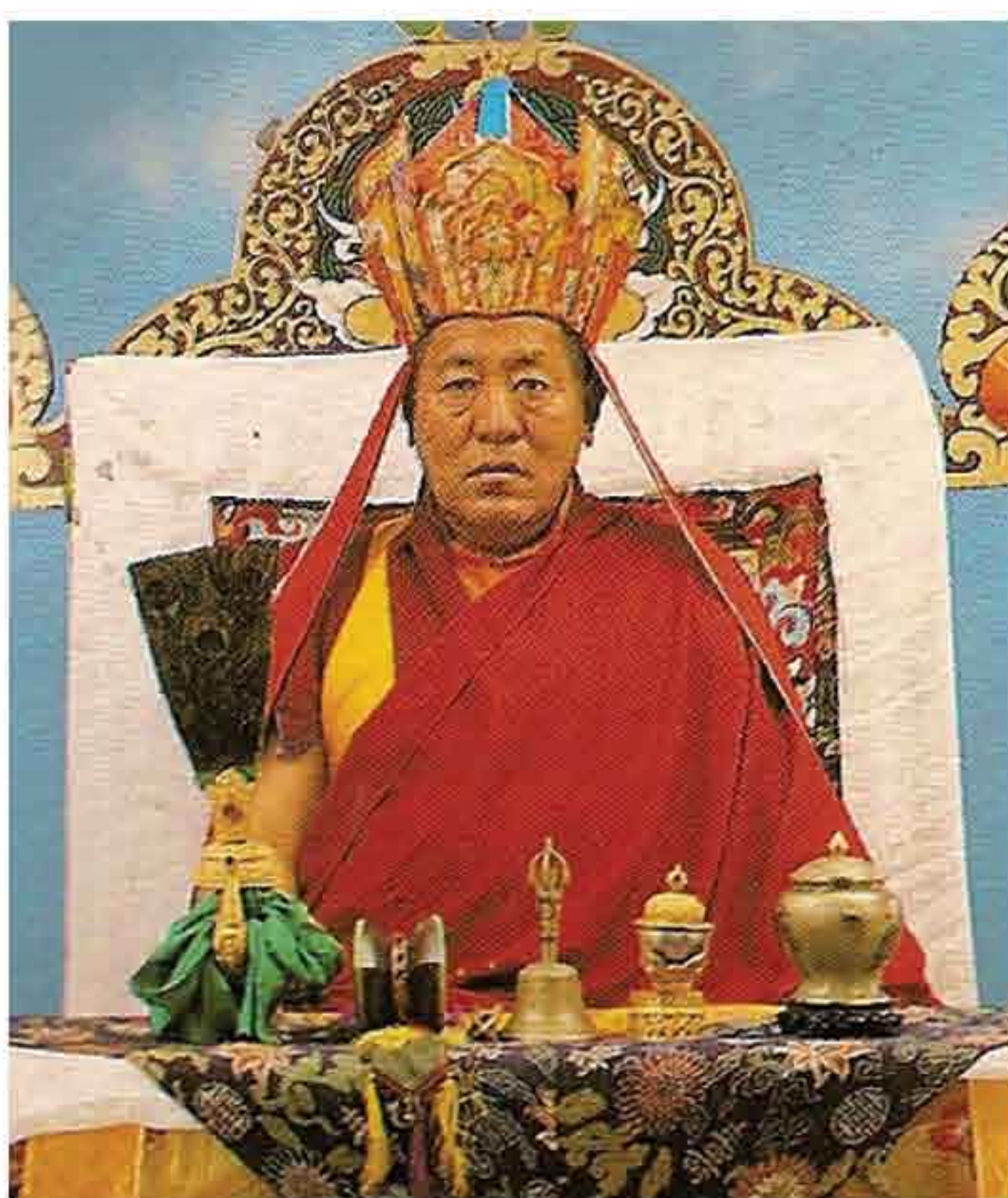
H.H. Khenchen Jigme Phuntsok Rinpoche