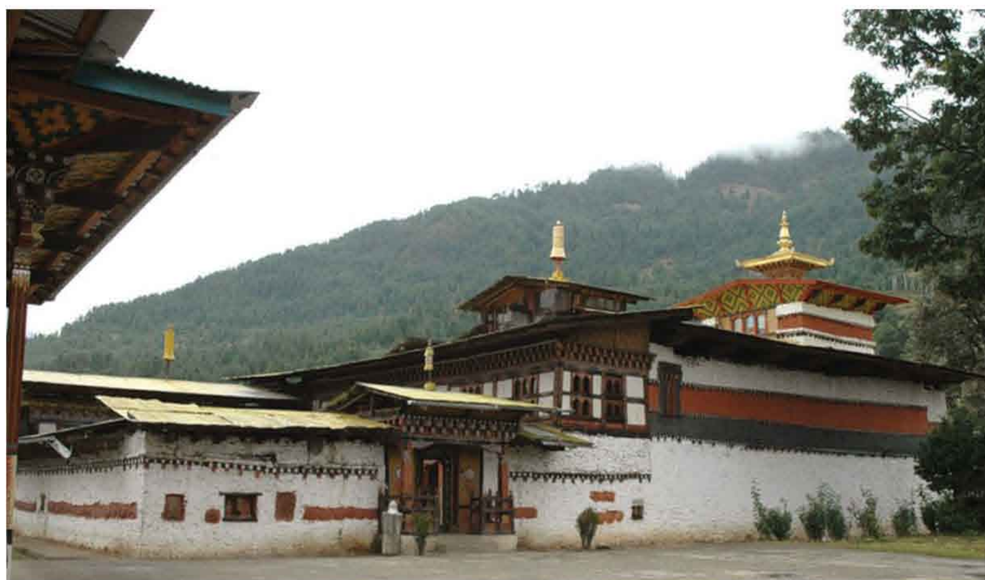
Tamzhing Monastery--Bumthang, Bhutan

Through his father's bloodline, he bears responsibility for the Tamzhing Monastery in Bumthang, which was built by the great Pema Lingpa himself. Both of these sites are suffering extensive disrepair and will need dedicated funding to accomplish essential repairs, maintenance, and artistic preservation.