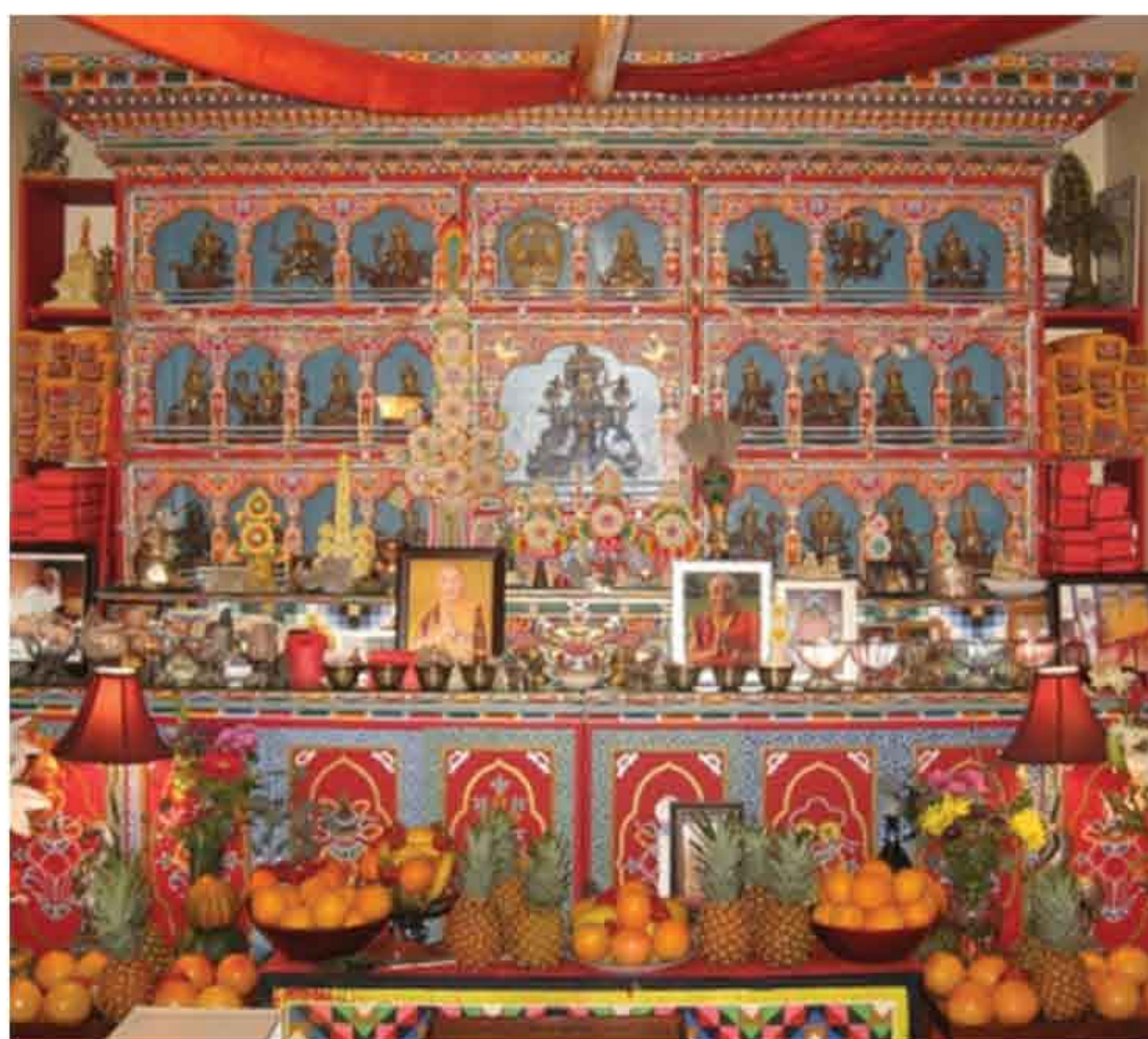
Shrine Room--Drukpa Mila Center-Longmont