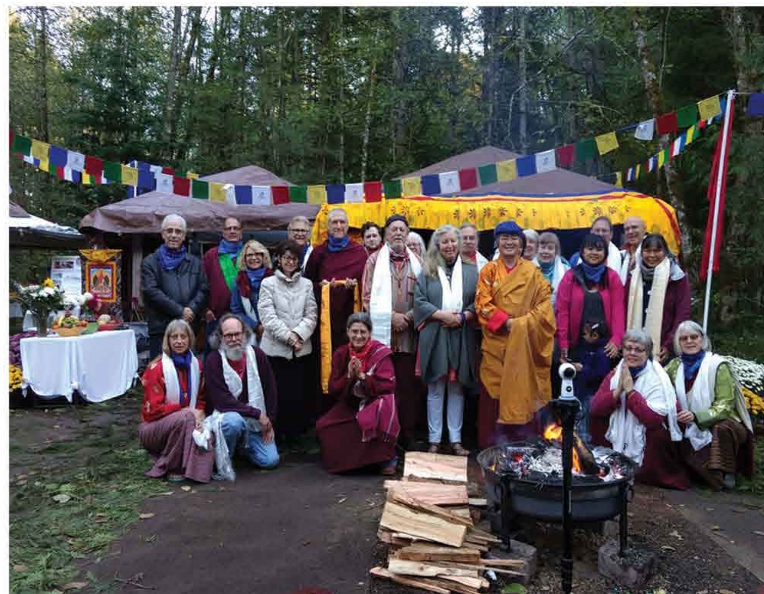
108th Buddha of Compassion Jinsek--Oregon, USA