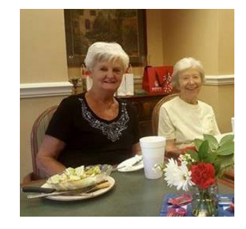
Every 2<sup>nd</sup> Thursday is Lunch with members living at Westminster-Canterbury Join us on September 13<sup>th</sup> Fauber 2 - 11:30am Ask the front desk for directions to the new location of Fauber 2