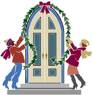
Hanging of the Greens

HANGING OF THE GREENS we will "Hang the Greens" November 20 th after church! We will begin our afternoon with lunch in the Refectory followed by fun and fellowship as our Church family gathers to prepare our Sanctuary and other spaces for the Season of Advent. There promises to be jobs for all ages, abilities and mobilities. LUNCH WILL BE PROVIDED