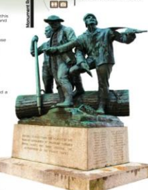
Lumberman's Monument

Visit Oscoda.com for map & more info In 2018, the Iosco Bikes and Trails Group envisioned a single-track mountain bike trail that would provide an expedition through the Huron National Forest. Following the contour of the AuSable River, 44 miles of trails are planned for development between Old Orchard Campground and Cooke Dam Road. The Wildcat features sections full of exciting rollers and challenging climbs with rewarding views. Access the trailhead at the Foote Site Overlook off River Road to experience the beginning phase of this exciting trail. The trail is open year-round, and when the snow flies it will be groomed for fat biking.