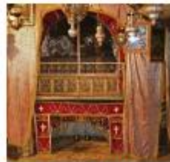
The Place of Christ's Birth, Basilica of the Nativity, Bethlehem

So let us hasten to witness to the Christ Child so that all may come to worship Him who gives us life. Let us stand in awe before the Cave, and let us share with all the Divine Mystery of love that unfolds there, the love of a God Who is here with us now and forever.