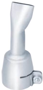
20x2 mm Flat Angled Nozzle

STEINEL heat tools work with our competitors' nozzles, saving you money and keeping you working as efficiently as possible.