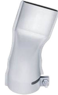
40 mm Angled Slit Nozzle