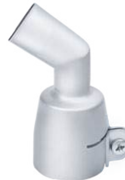
30x2 mm, 60° Flat Angled Nozzle