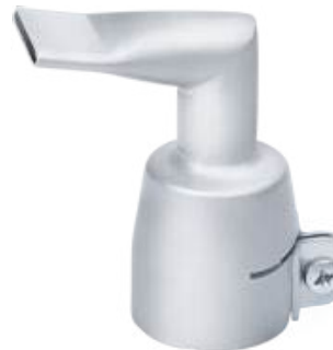
20x2 mm, 100° Flat Angled Nozzle