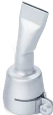
20x2 mm, straight Flat Angled Nozzle