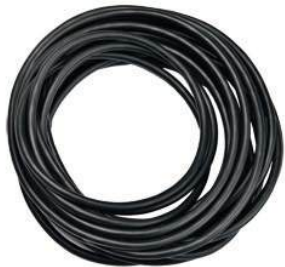
21 FT Power Cord No Strain Relief