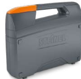
Heavy Duty Case for 20s Series Tools