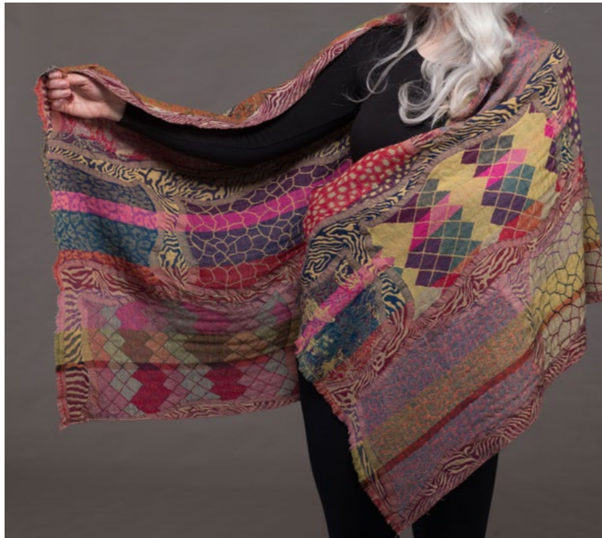
Animal Print Merino Wool Shawl MWSAWAP $38