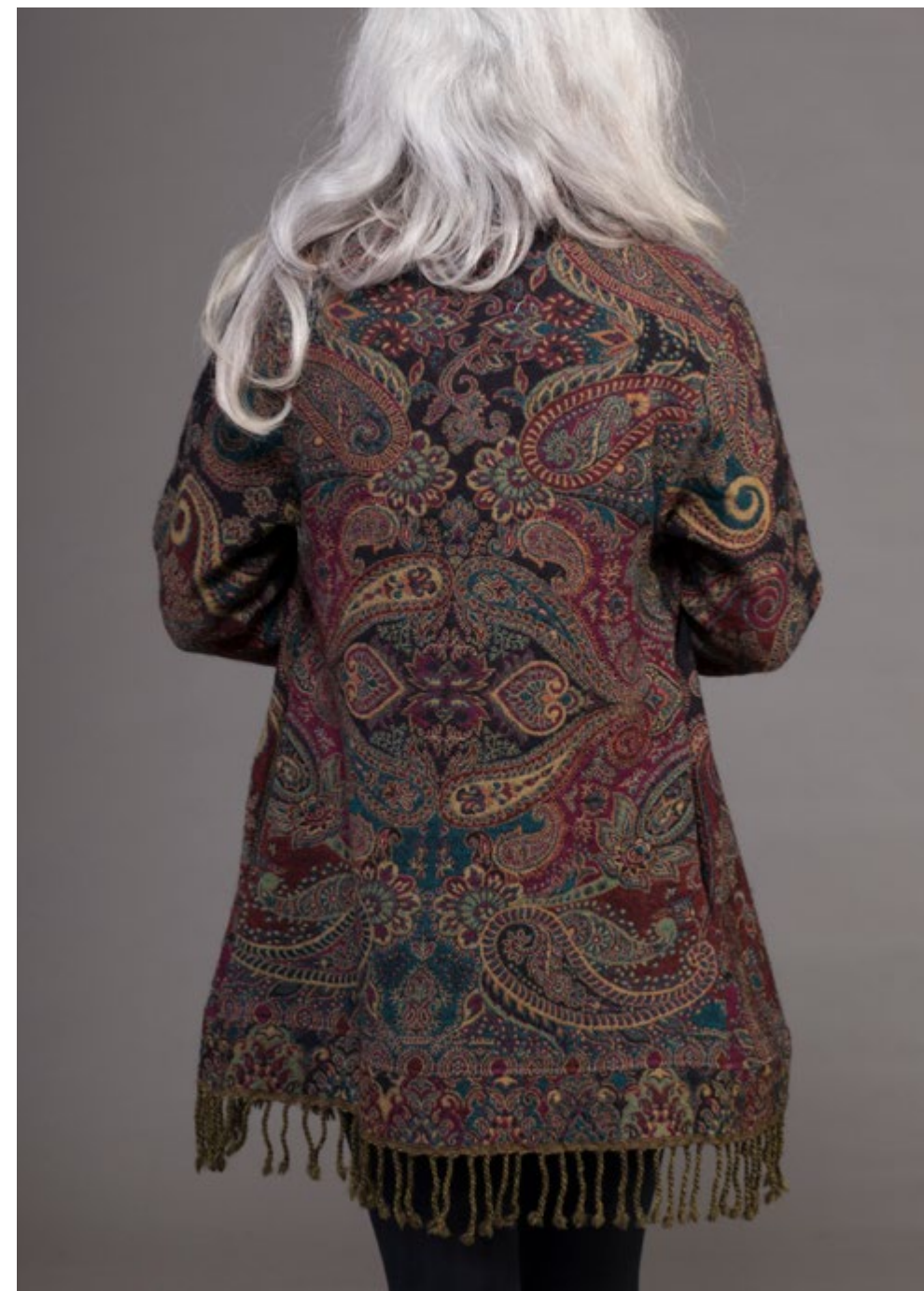
Sula Jacket Pure Wool 2 Sizes S/M & L/XL SJPW2108 $135