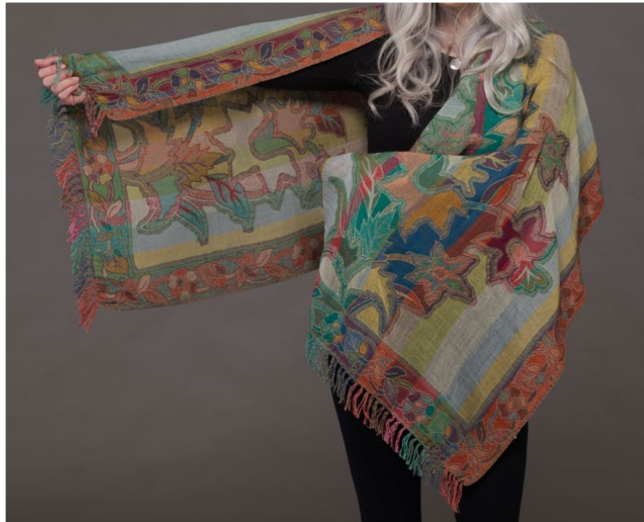
Geometric Flowers Merino Wool Shawl MWSAWGF $38