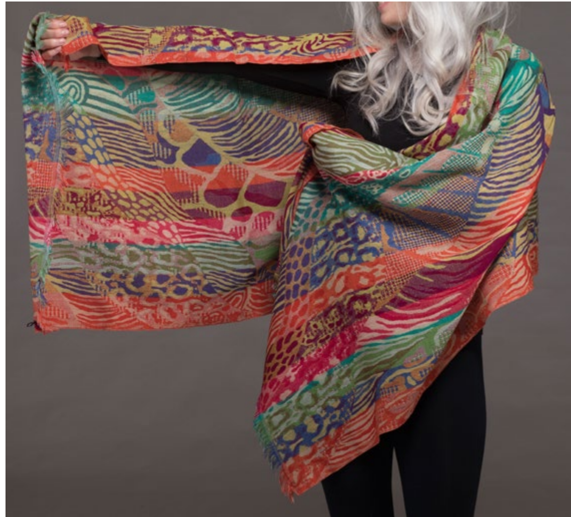
Animal Multi Merino Wool Shawl MWSAWAM $38