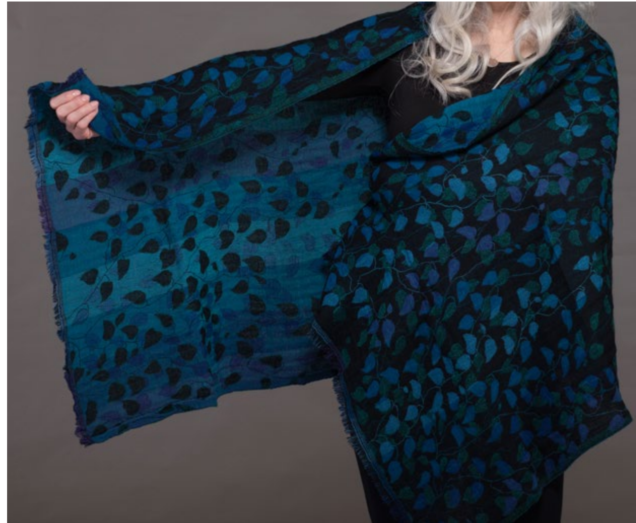
Midnight Leaves Merino Wool Shawl MWSAWMIL $38