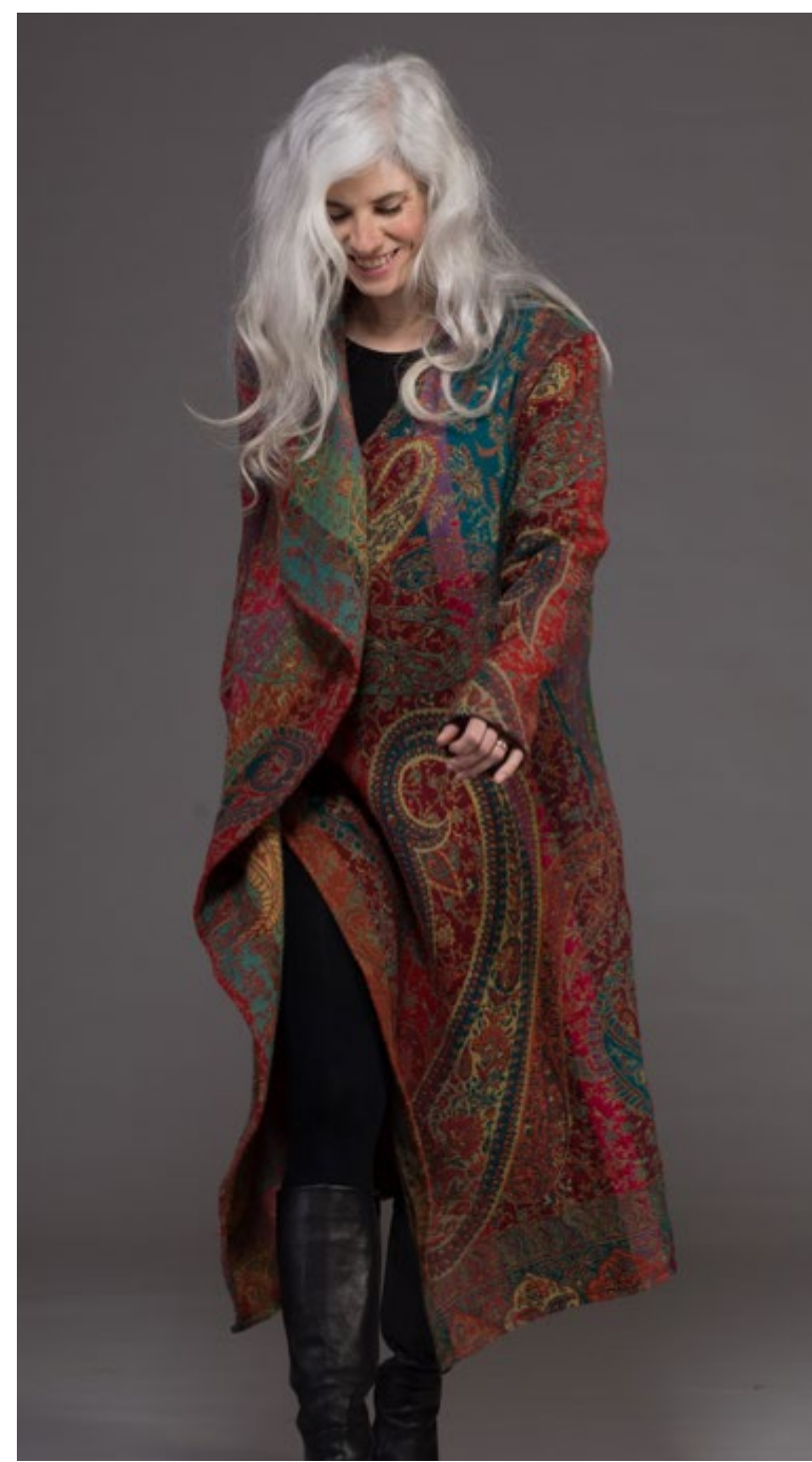
Nellore Jacket Pure Wool 3 Sizes S/M, L/XL, XXL NJPW2107 $160