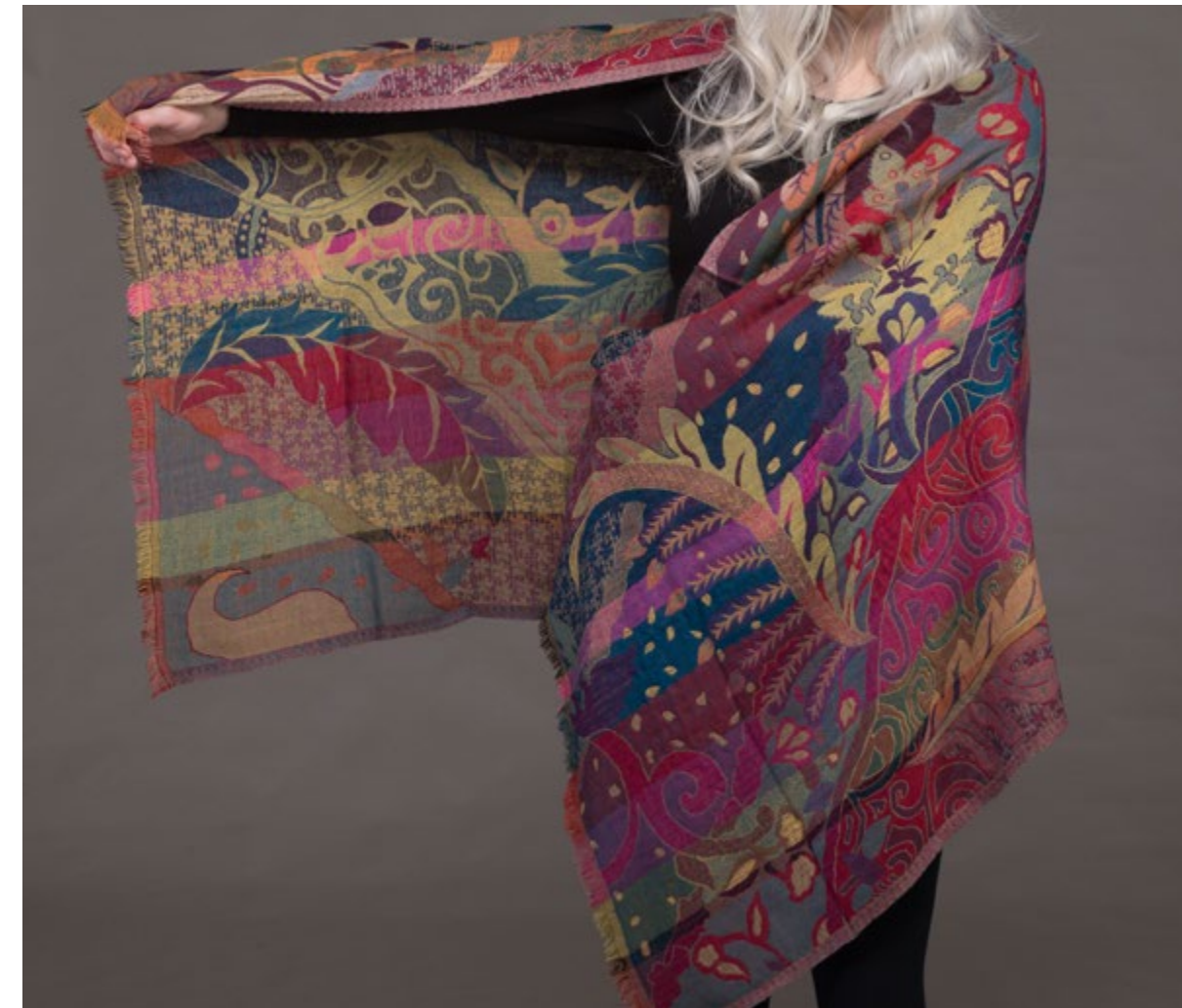
Tropical Forest Merino Wool Shawl MWSAWTF $38