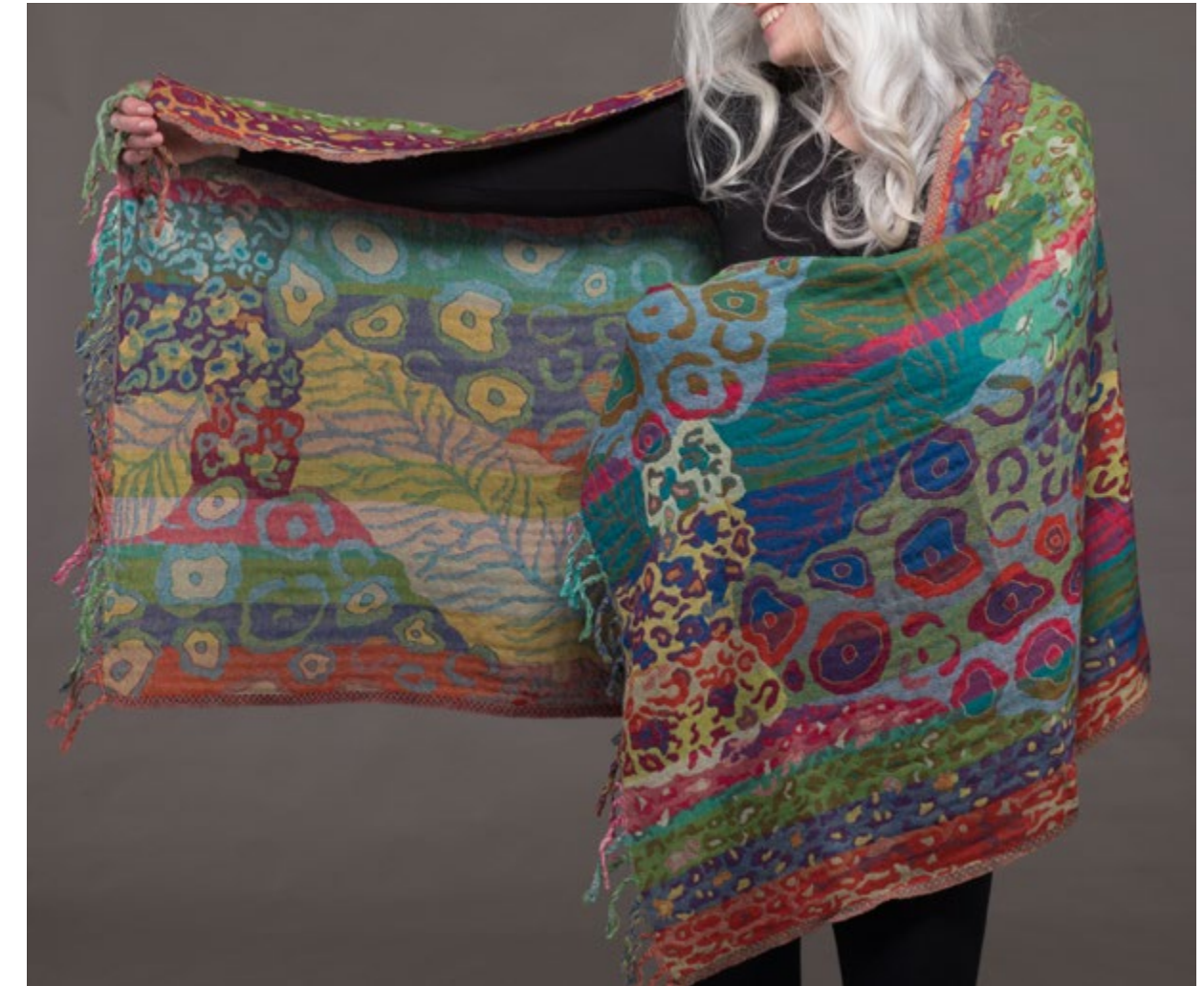
Klimt Merino Wool Shawl MWSAWKL $38