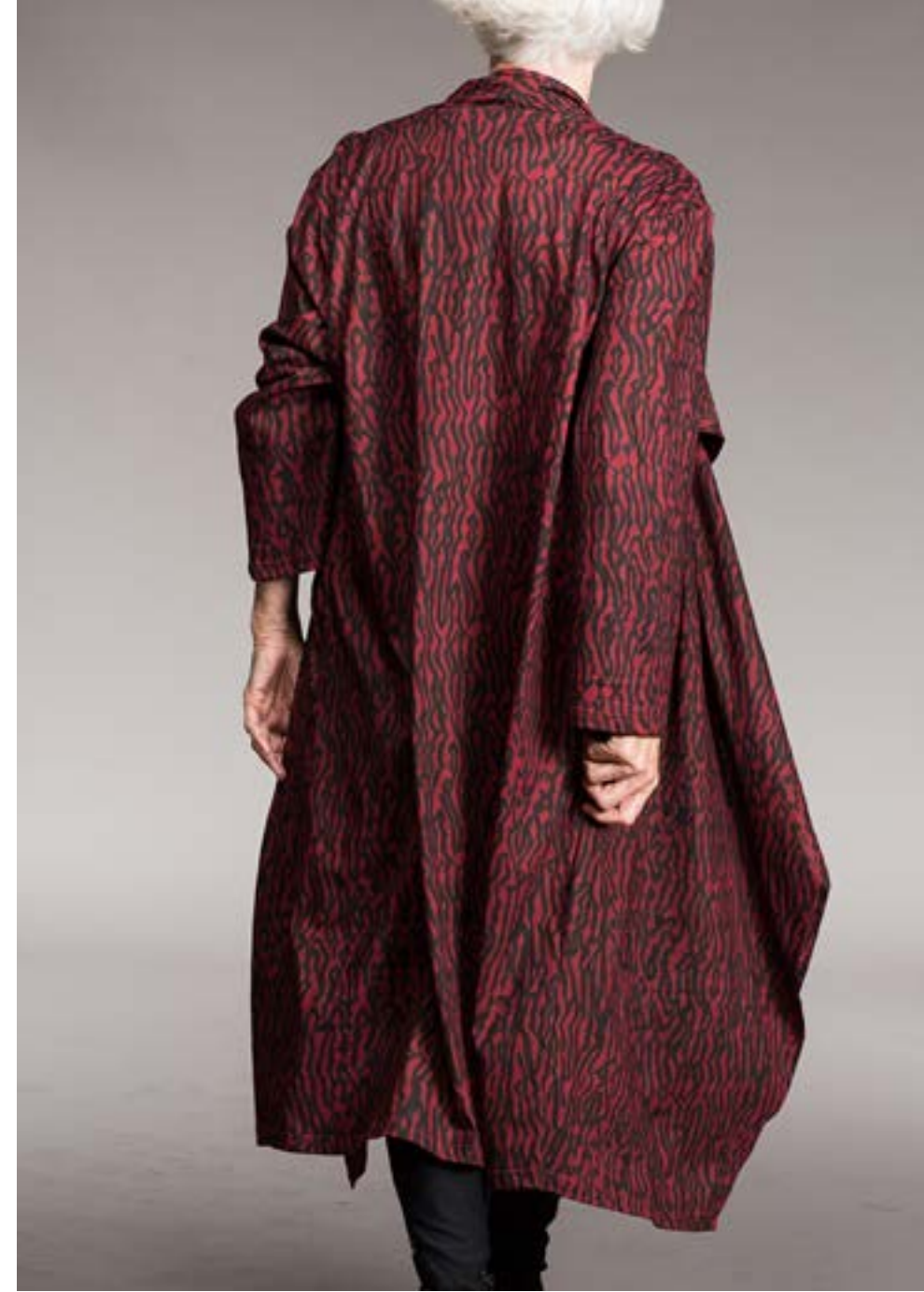
Nellore Jacket Cotton Jersey Shibori 2 Sizes S/M & L/XL NJJW22RS