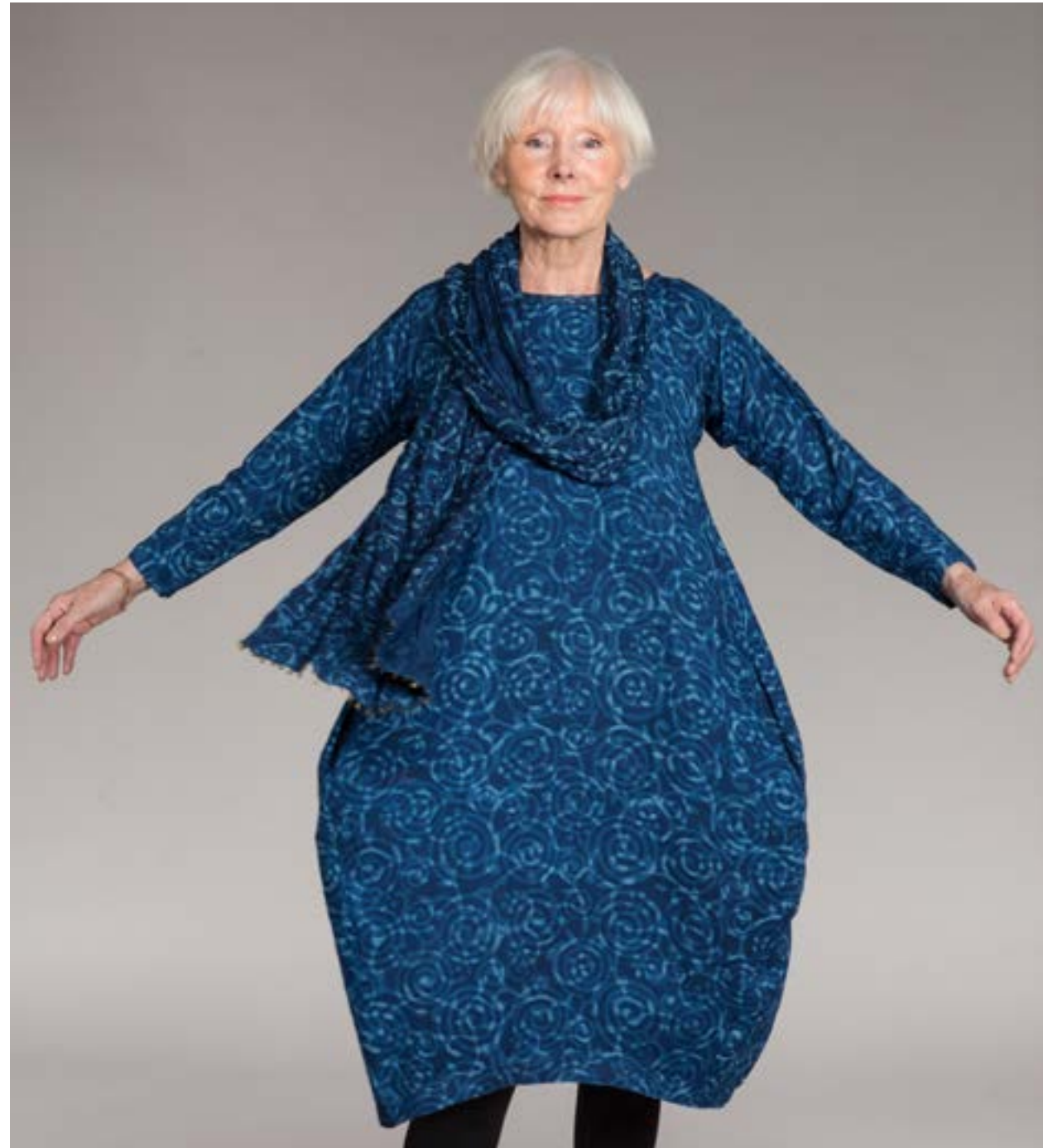
Farah Dress Moss Crepe Sustainable 3 Sizes S/M, L/XL & XXL FDMW2202