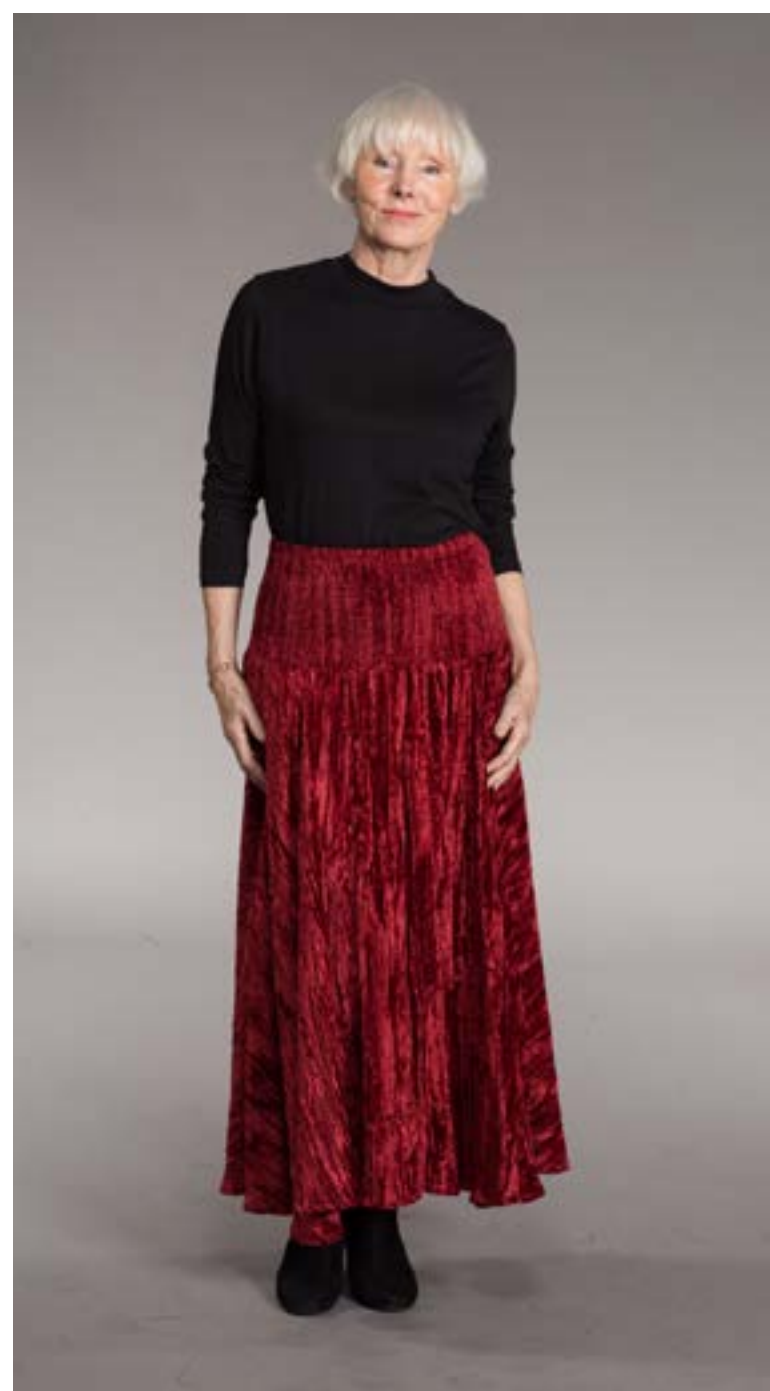
Asman Skirt Crushed Velvet One Size ASVW22GR