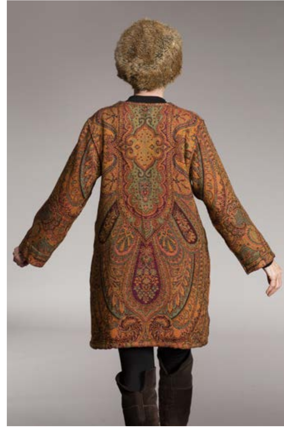
Jani Cardigan Reversible Pure Wool 5 Sizes S, M, L, XL & XXL JCPW22A2