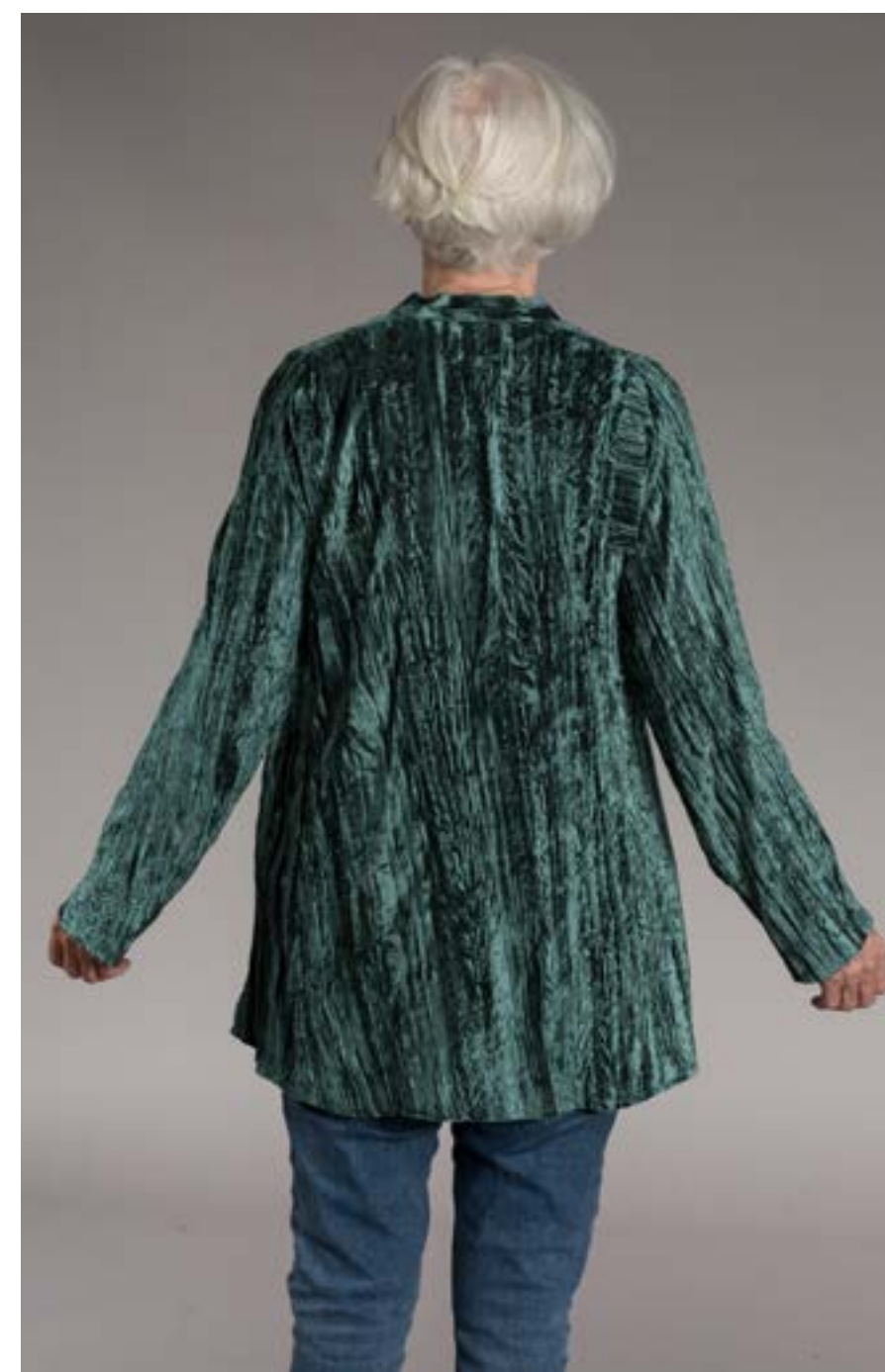
Choti Nargis Jacket Crushed Velvet 3 Sizes S/M, L/XL & XXL CNJV22TL