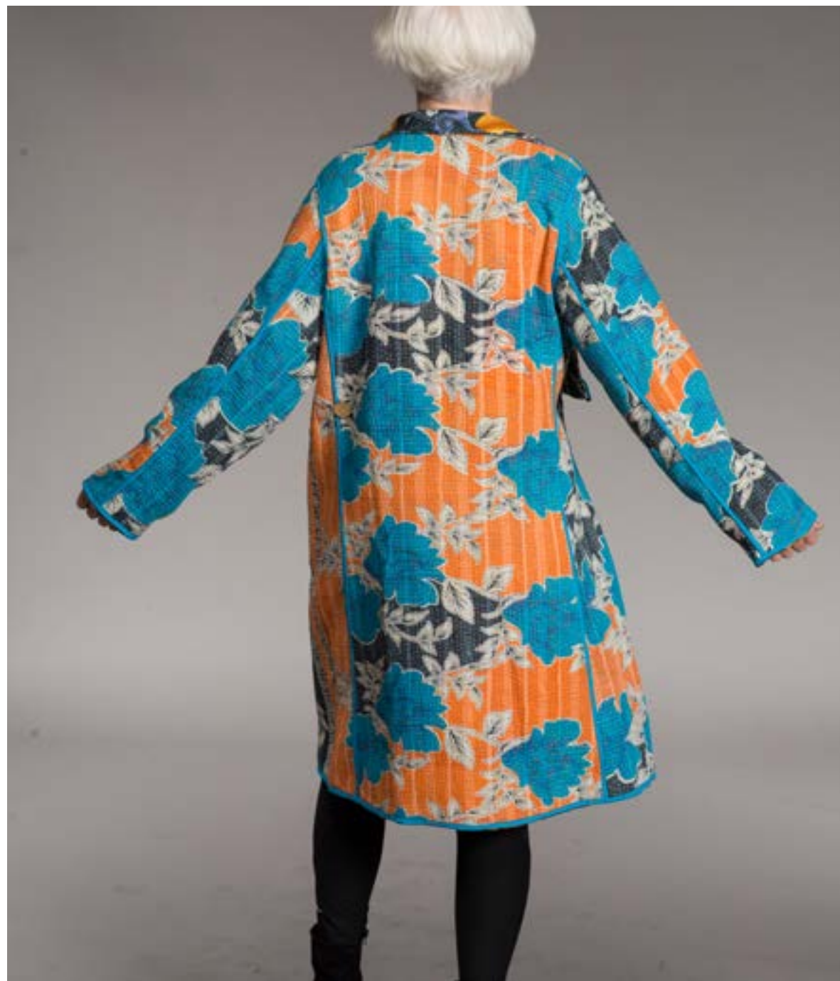
Ajuni Reversible Jacket Assorted Cotton 4 Sizes S, M, L, XL AJKC22AS