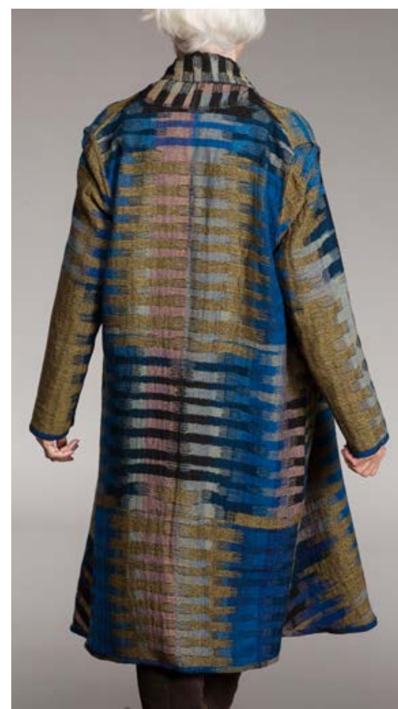
Dev Jacket Reversible Pure Wool 3 Sizes S/M, L/XL, XXL DJRW22BB