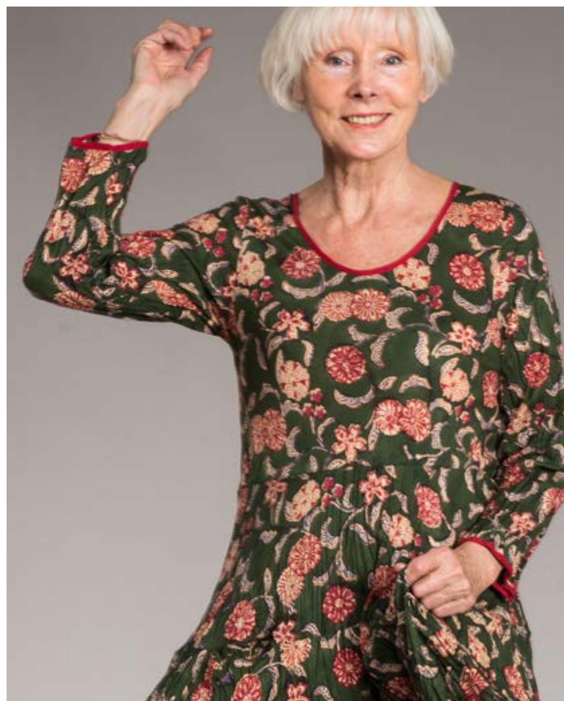
Dewani Dress Brushed Cotton With Red Piping 3 Sizes S/M, L/XL & XXL DDBC2201