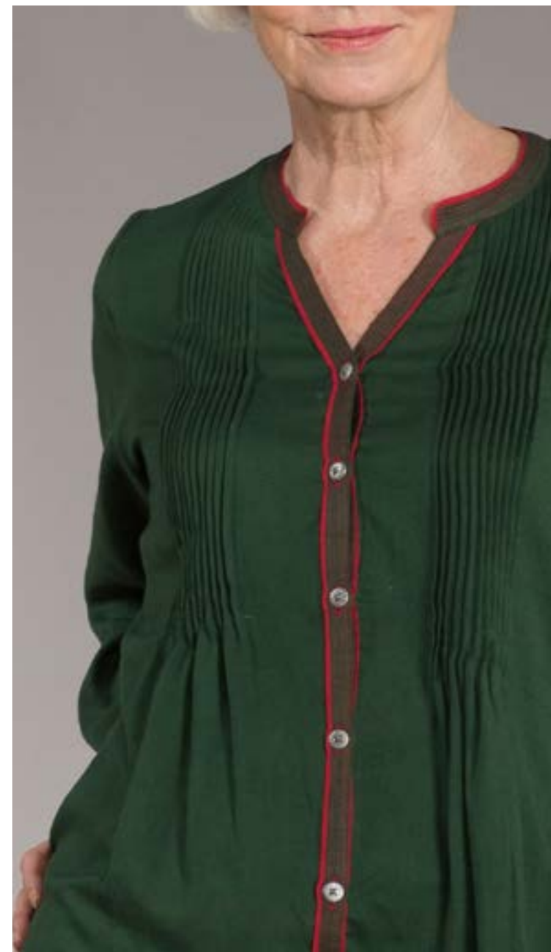
Shimla Tunic Brushed Cotton 5 Sizes S, M, L, XL, & XXL STBC22DG