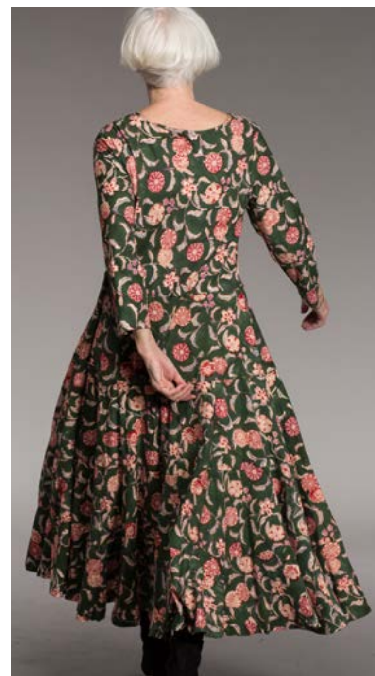
Dewani Dress Cotton Jersey 3 Sizes S/M, L/XL & XXL DDJW2201