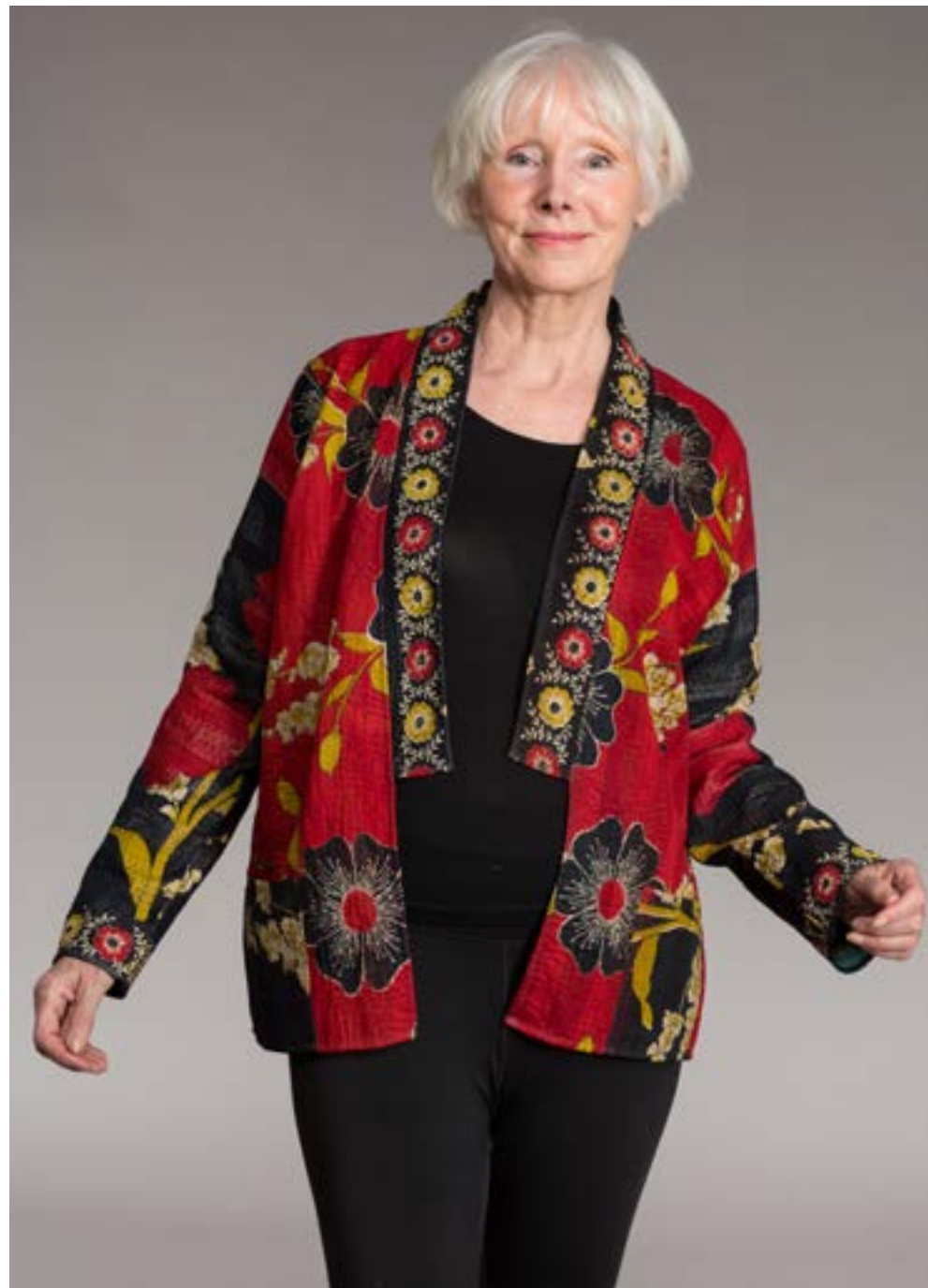
Kantha Short Jacket Assorted Cotton 4 Sizes S, M, L, XL KSJA22AS