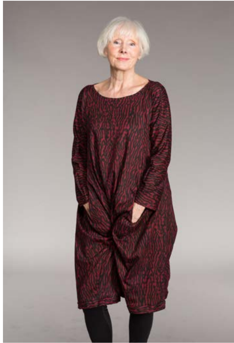
Farah Dress Cotton Jersey 3 Sizes S/M, L/XL, XXL FDJW22RS