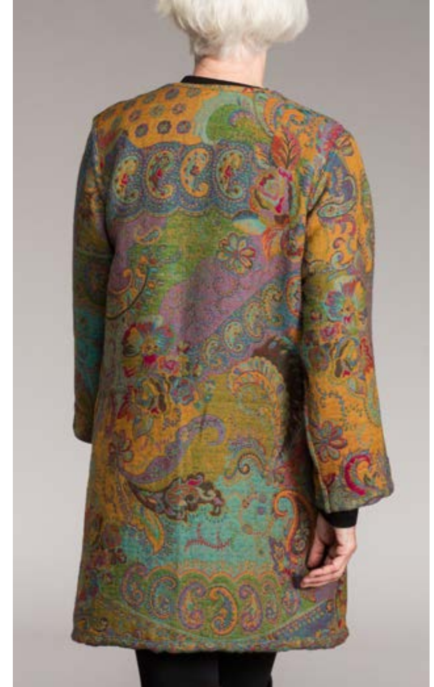
Jani Cardigan Reversible Pure Wool 5 Sizes S, M, L, XL & XXL JCPW22A1