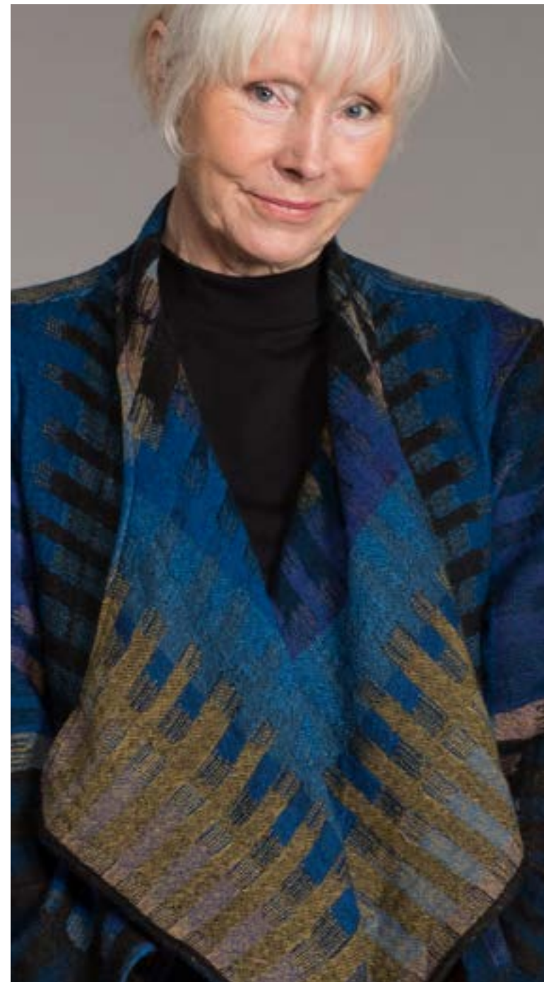
Nellore Jacket Pure Wool 3 Sizes S/M, L/XL & XXL NJPW22BB