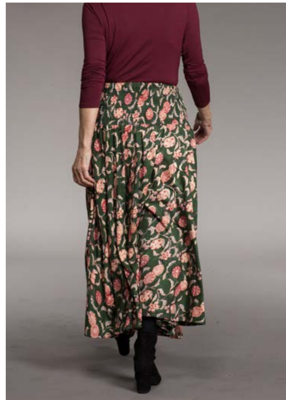
Asman Skirt Cotton Jersey One Size ASJW2201