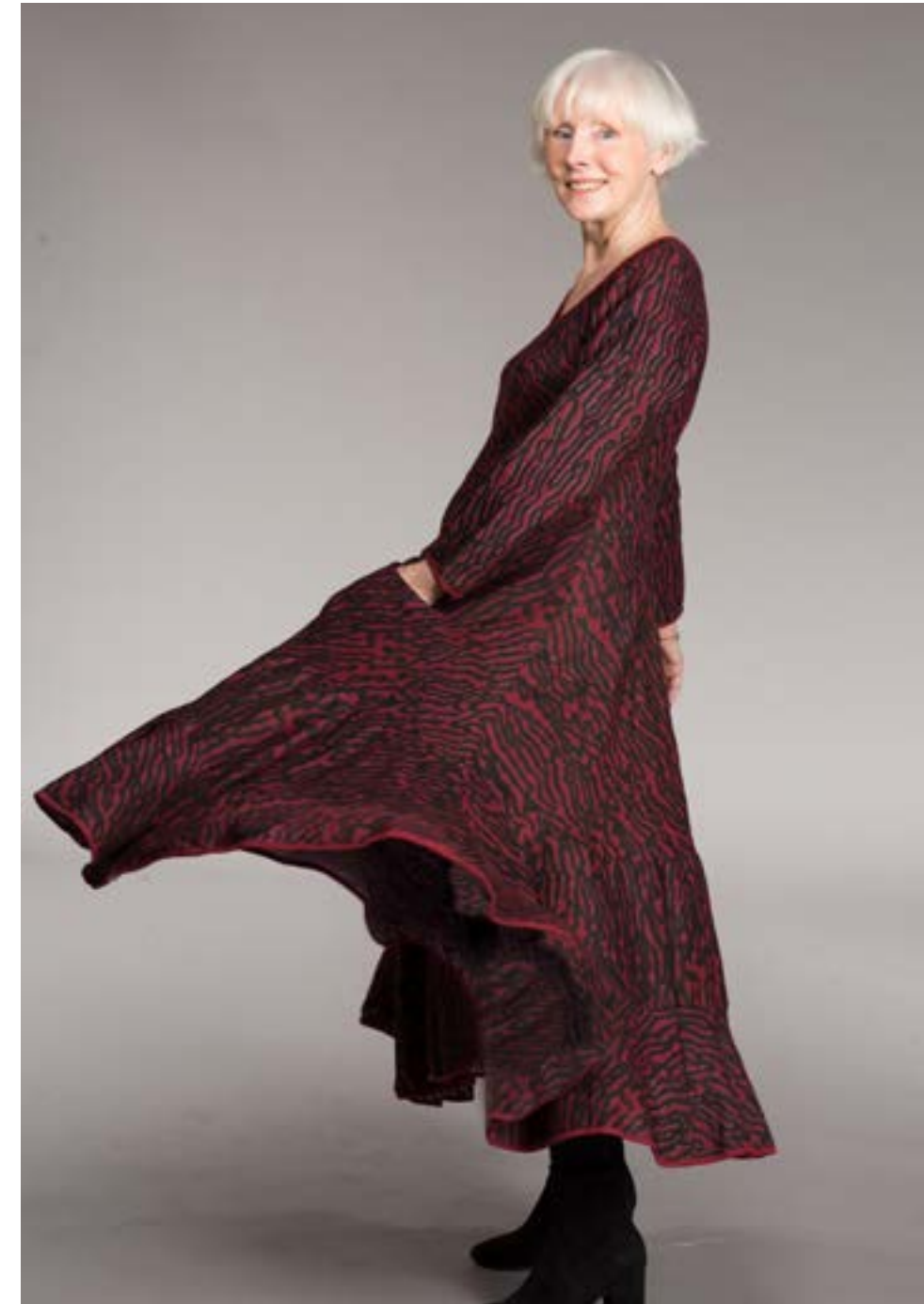
Dewani Dress Moss Crepe Sustainable 3 Sizes S/M, L/XL & XXL DDMC22RS