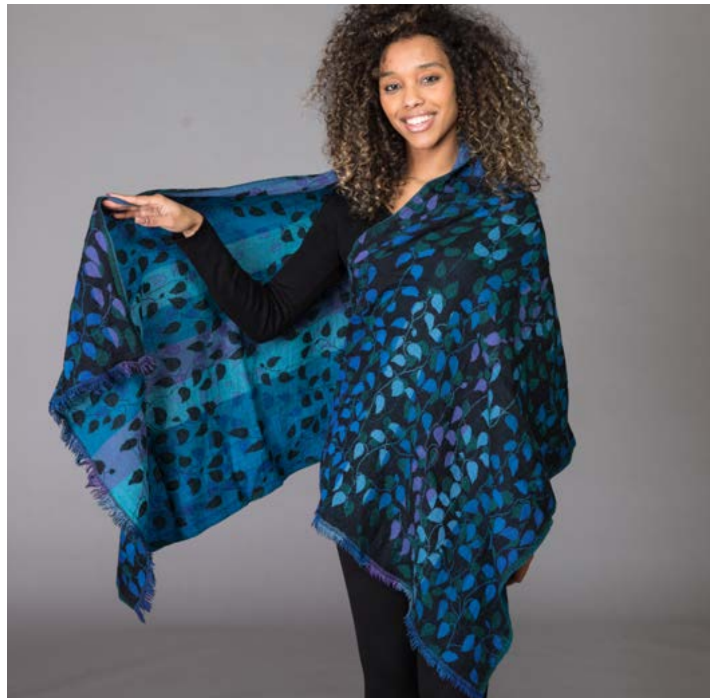
Midnight Leaves Merino Wool Shawl MWSWMIL