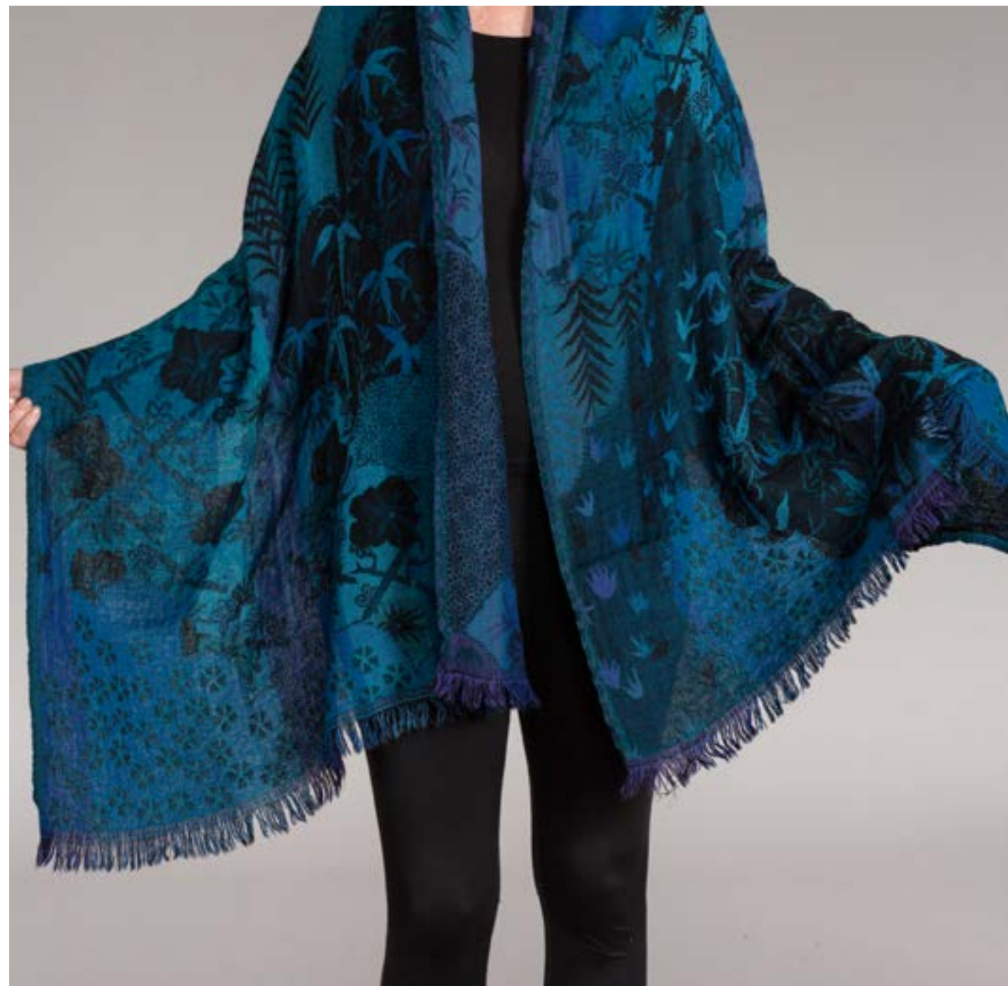
Jungle Birds Blue Merino Wool Shawl MWSWJBB