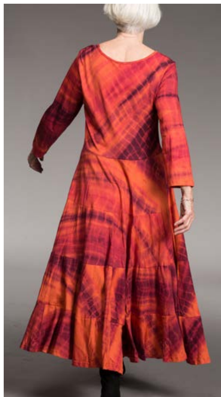
Dewani Dress Cotton Jersey Shibori 3 Sizes S/M, L/XL & XXL DDJW2204