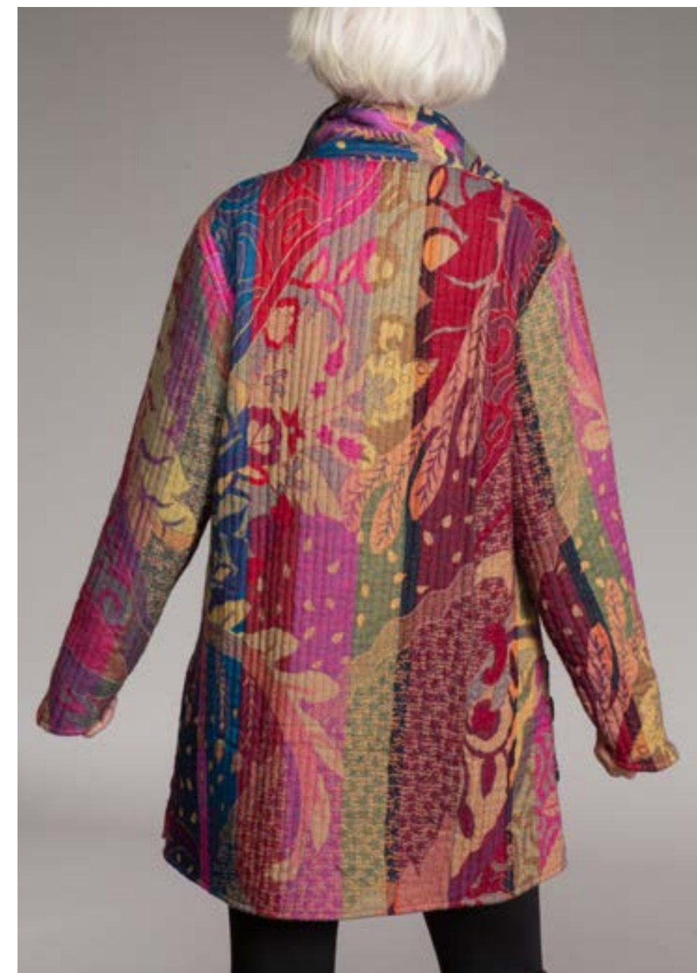
Ludhiana Coat Pure Wool 5 Sizes S, M, L, XL & XXL LCPW22TF