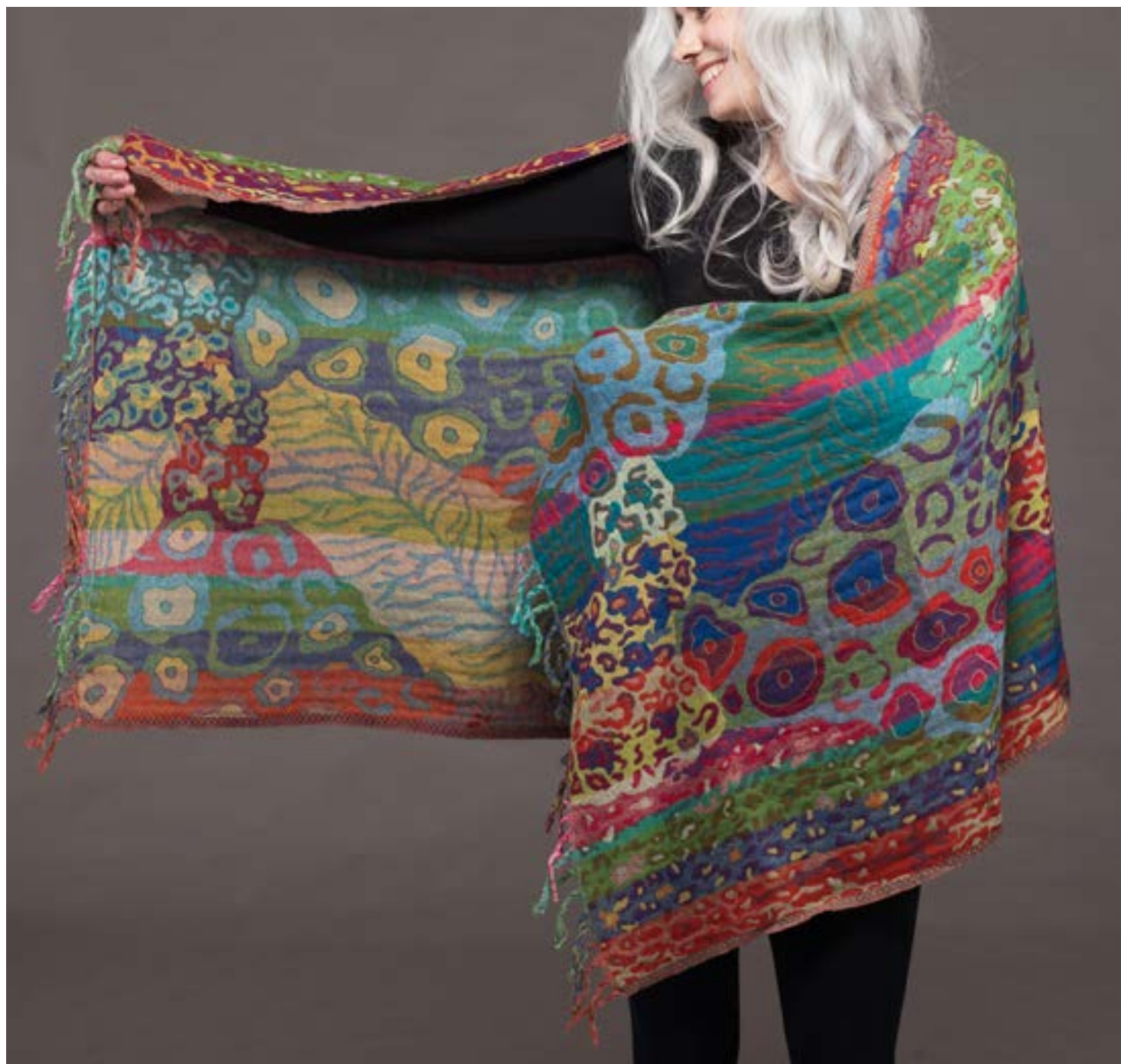
Klimt Merino Wool Shawl MWSAWKL