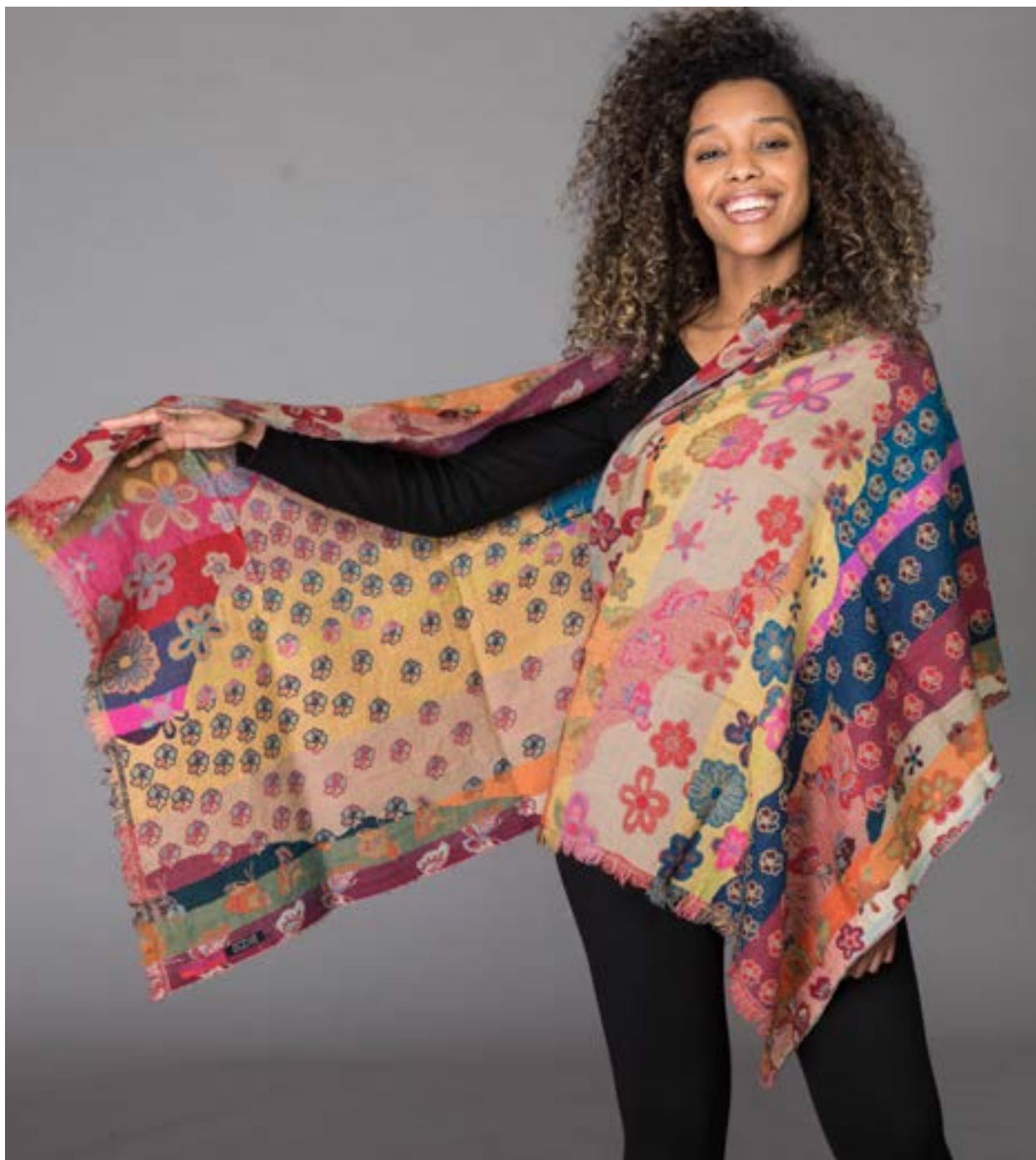
Butterfly Field Merino Wool Shawl MWSAWBF