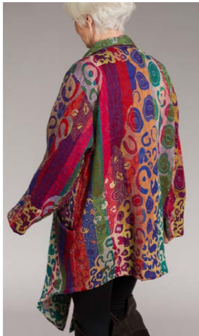
Tilak Jacket With Point Pure Wool 3 Sizes S/M, L/XL & XXL TJPW22KL