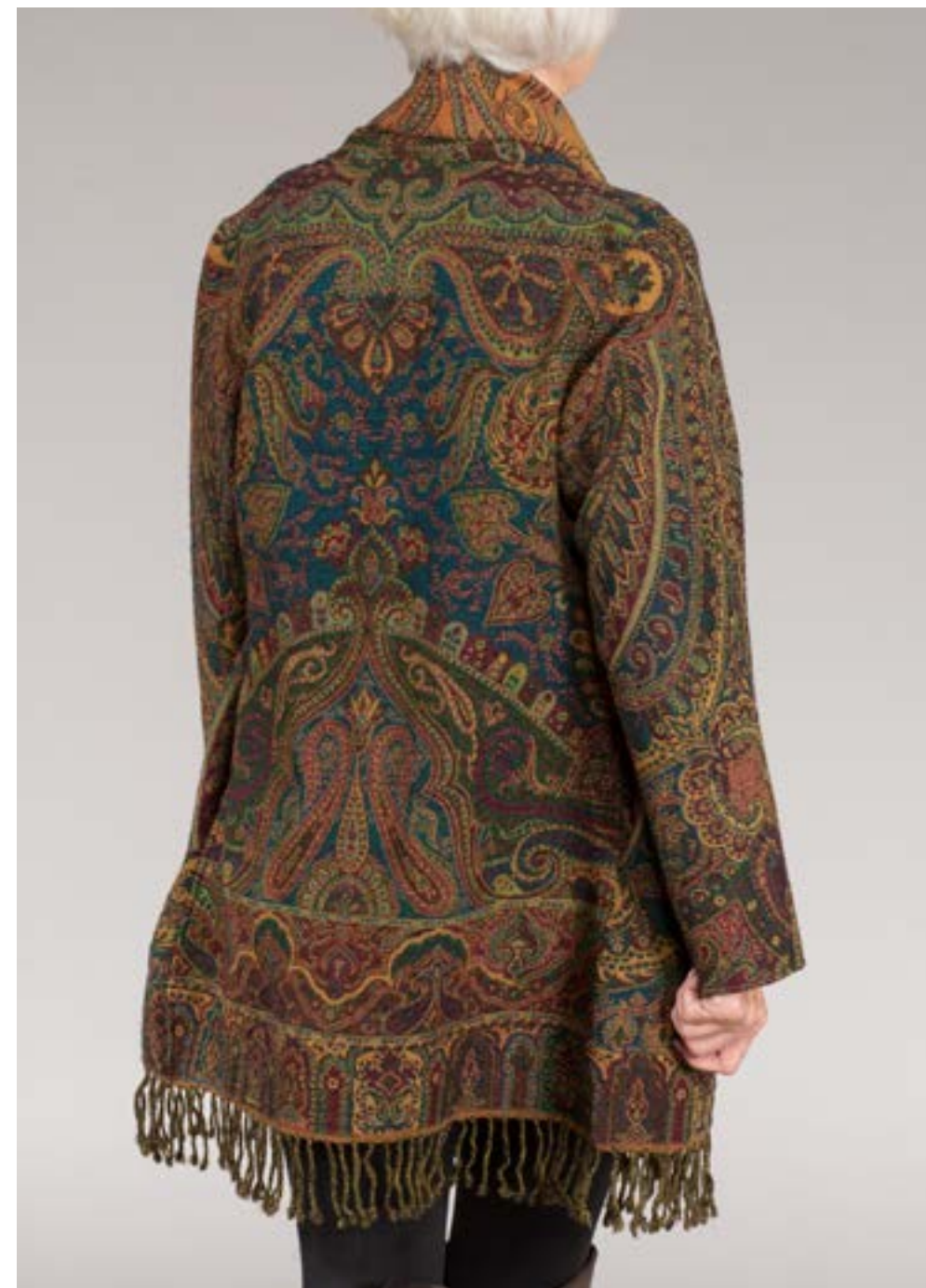
Sula Jacket Pure Wool 3 Sizes S/M, L/XL & XXL SJPW22A2