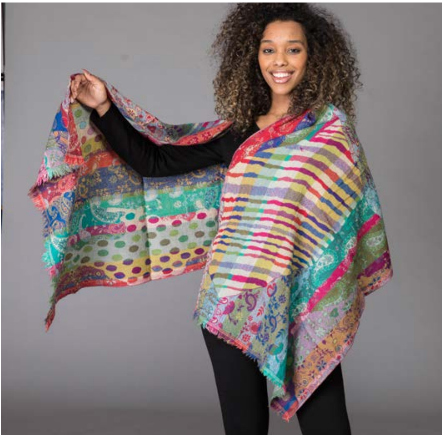
Leela Merino Wool Shawl MWSAWLE