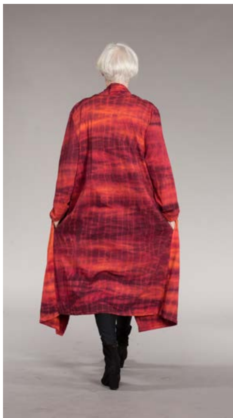
Nellore Jacket Cotton Jersey Shibori 3 Sizes S/M, L/XL & XXL NJJW2204