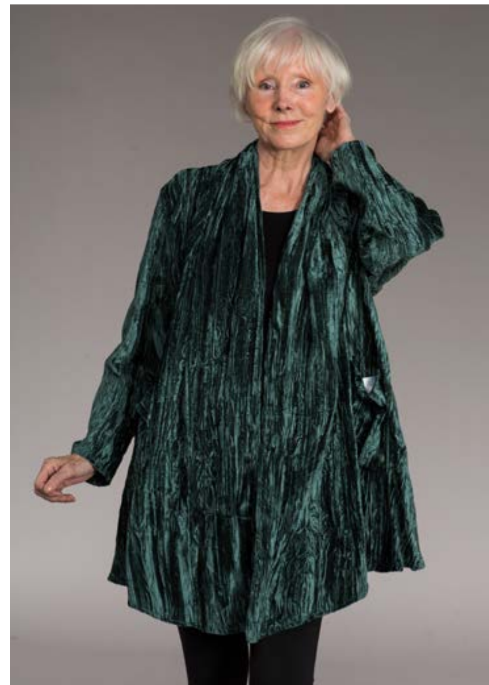
Thar Jacket Crushed Velvet 3 Sizes S/M, L/XL & XXL TRJV22TL