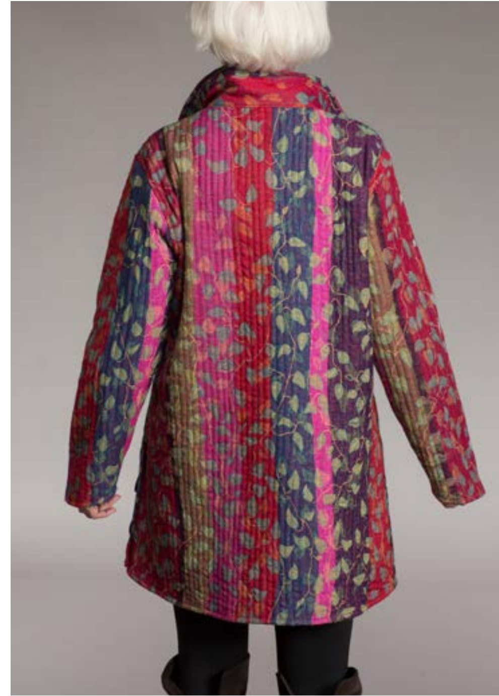
Ludhiana Coat Pure Wool 5 Sizes S, M, L, XL & XXL LCPW22ML