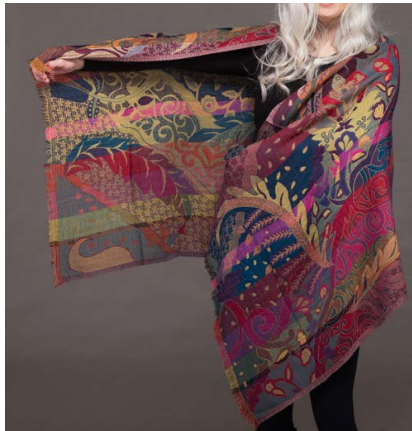
Tropical Forest Merino Wool Shawl MWSAWTF