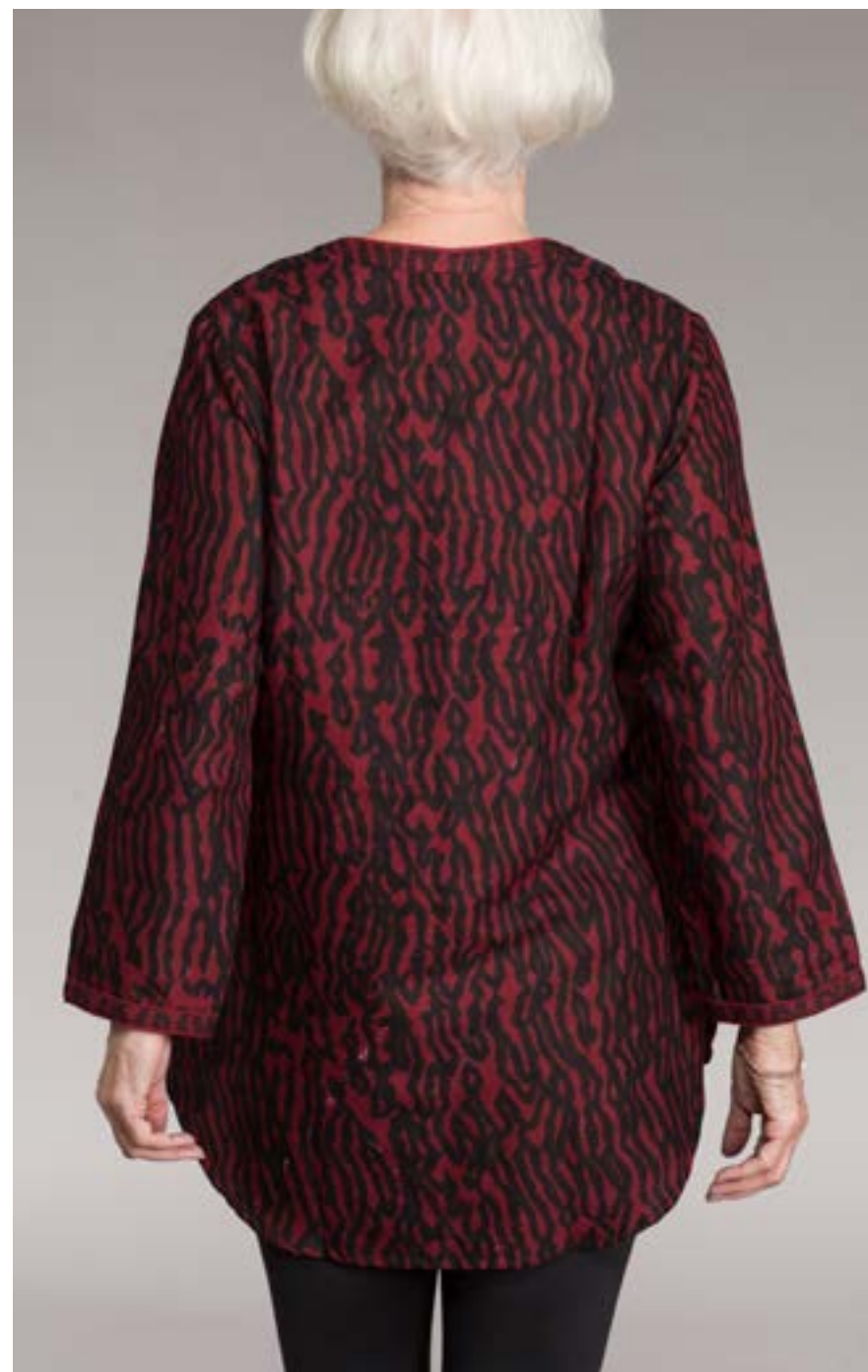
Shimla Tunic Moss Crepe Sustainable 5 Sizes S, M, L, XL, & XXL STMC22RS