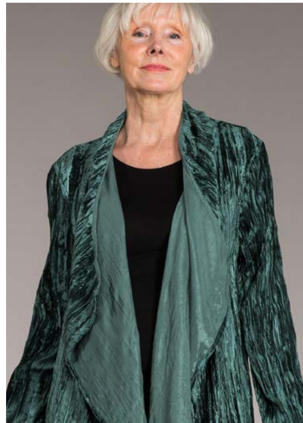
Nellore Jacket Crushed Velvet 3 Sizes S/M, L/XL & XXL NJVW22TL