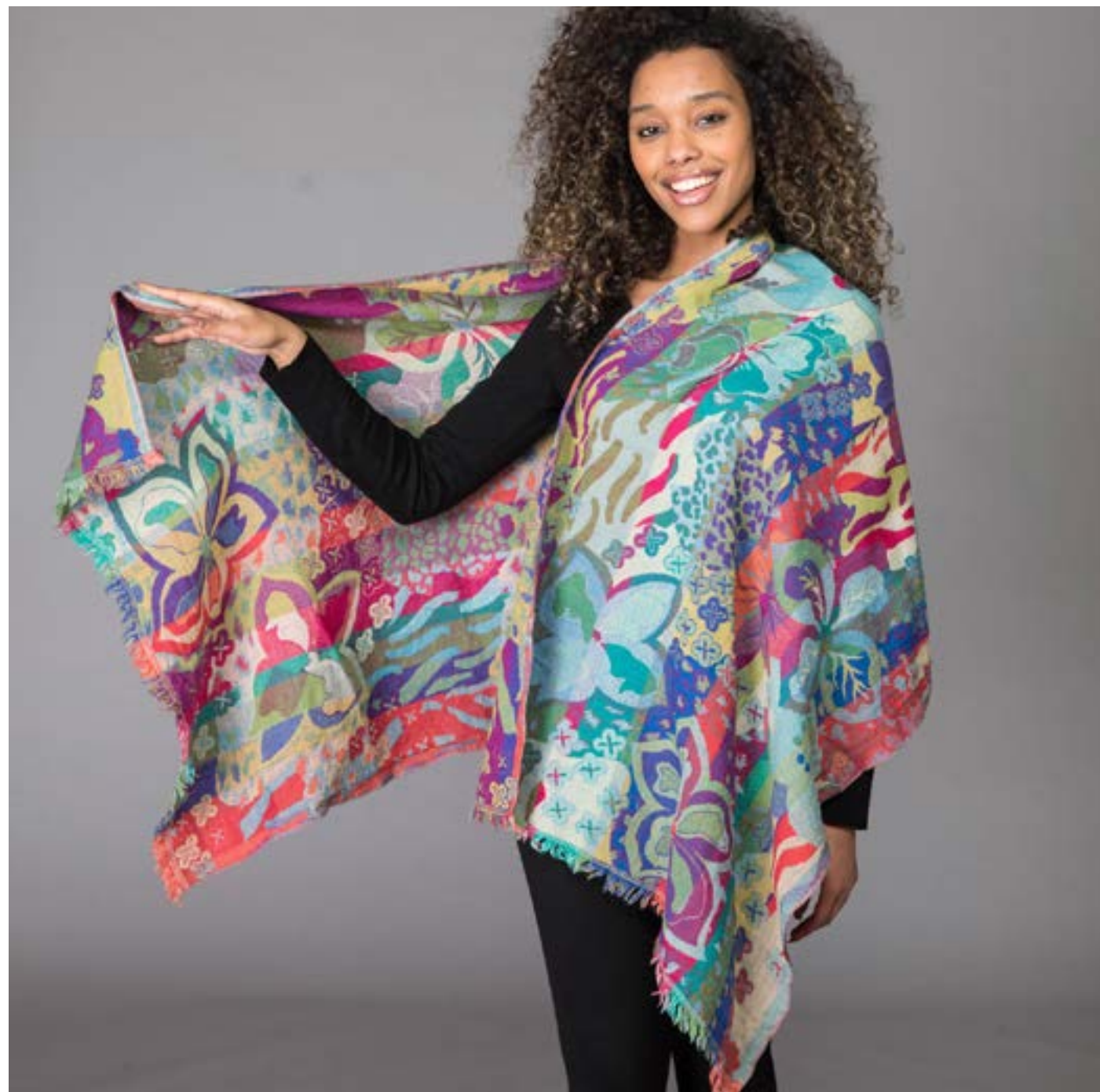
Jungle Flower Merino Wool Shawl MWSAWJF