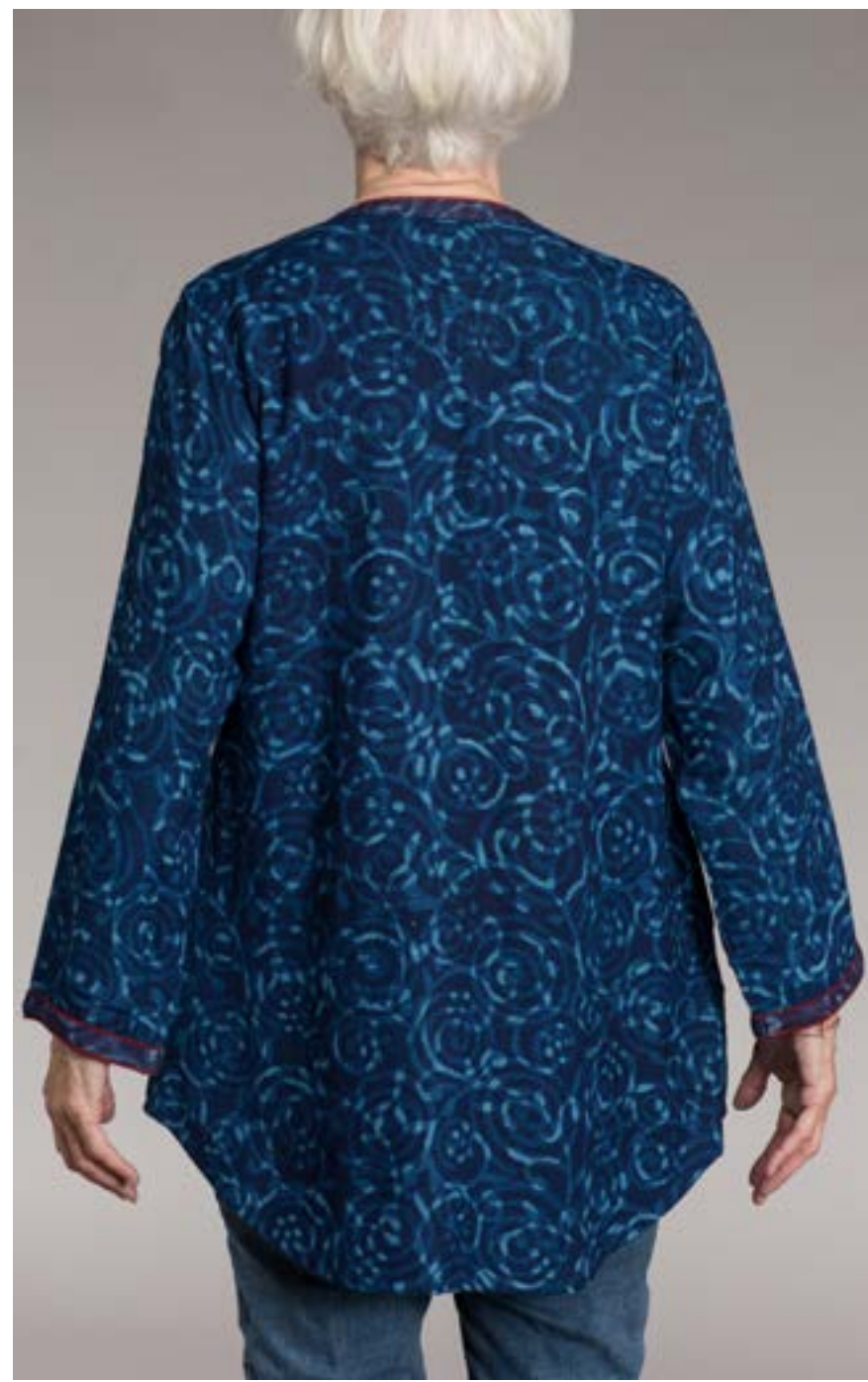
Shimla Tunic Moss Crepe Sustainable 5 Sizes S, M, L, XL, XXL STMW2202