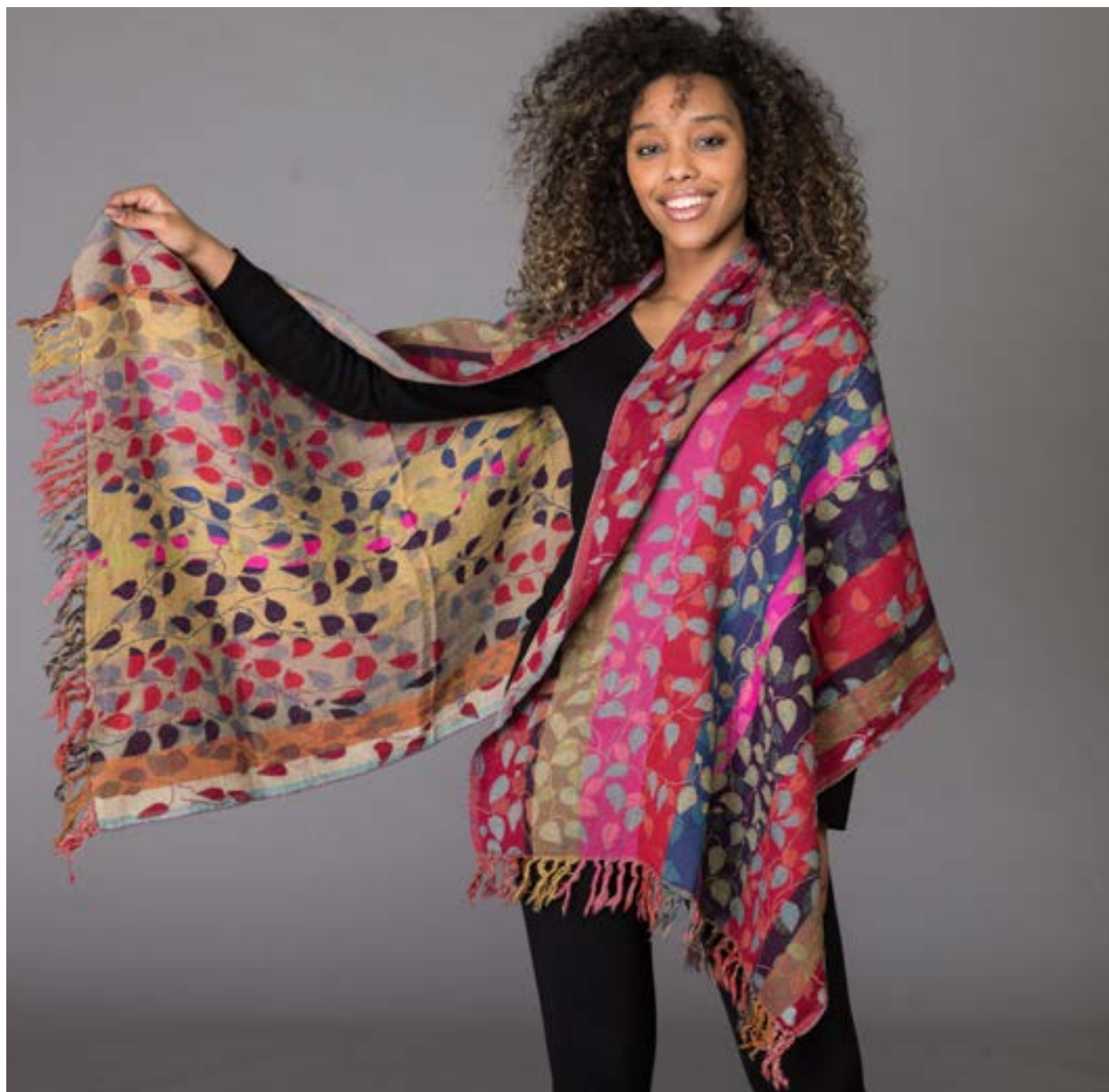
Multi Leaves Merino Wool Shawl MWSAWML