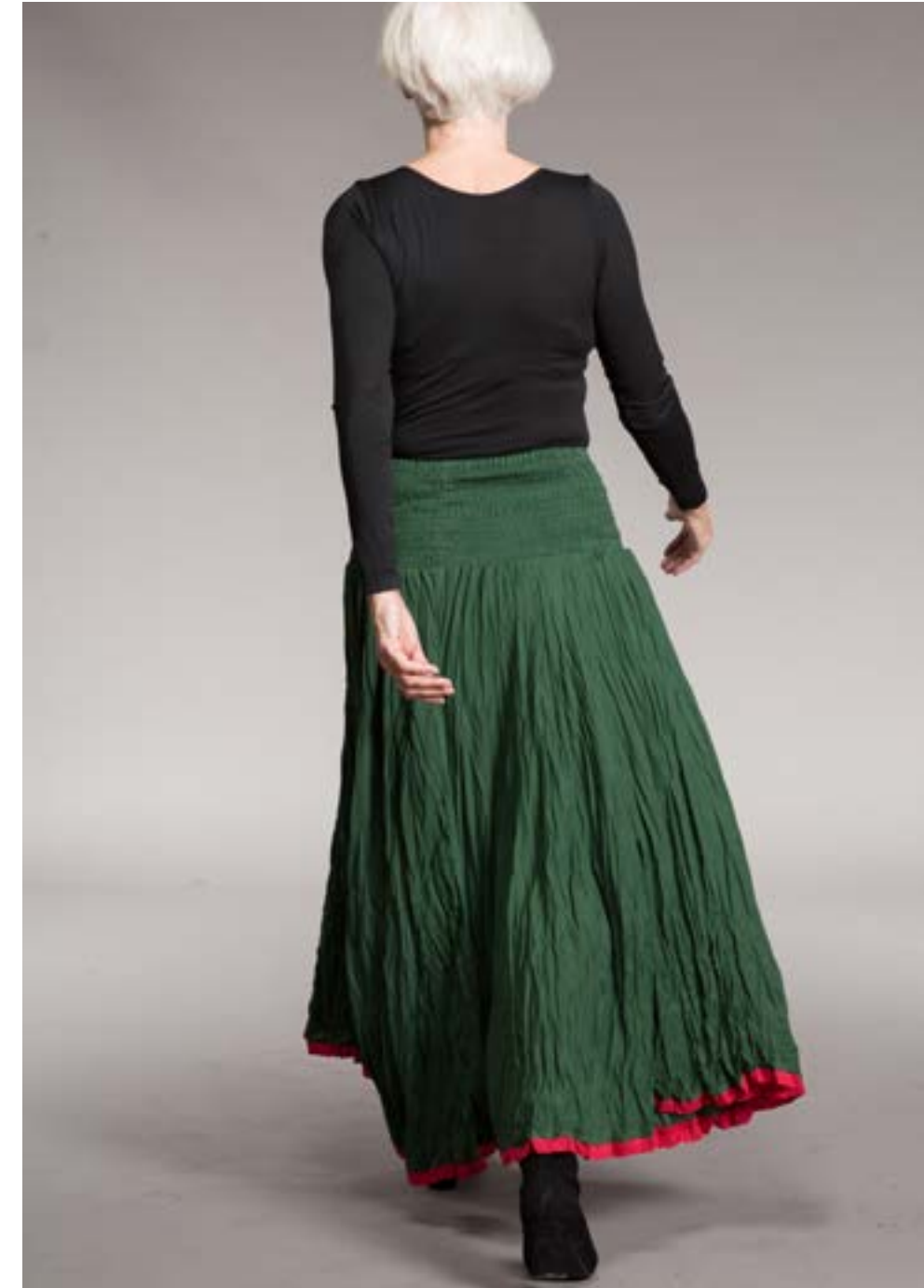
Asman Skirt Brushed Cotton One Size ASBC22DG