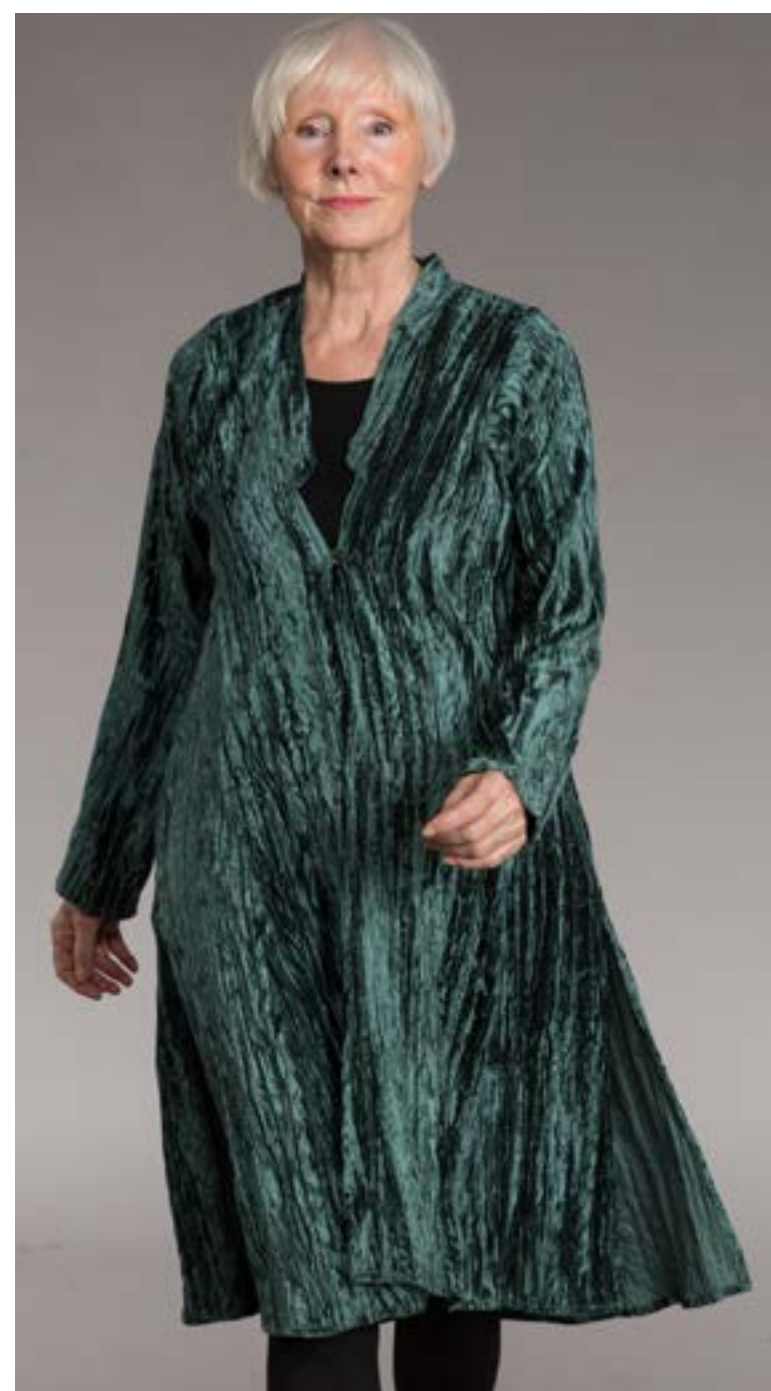
Nargis Jacket Crushed Velvet 3 Sizes S/M, L/XL & XXL NAJV22TL