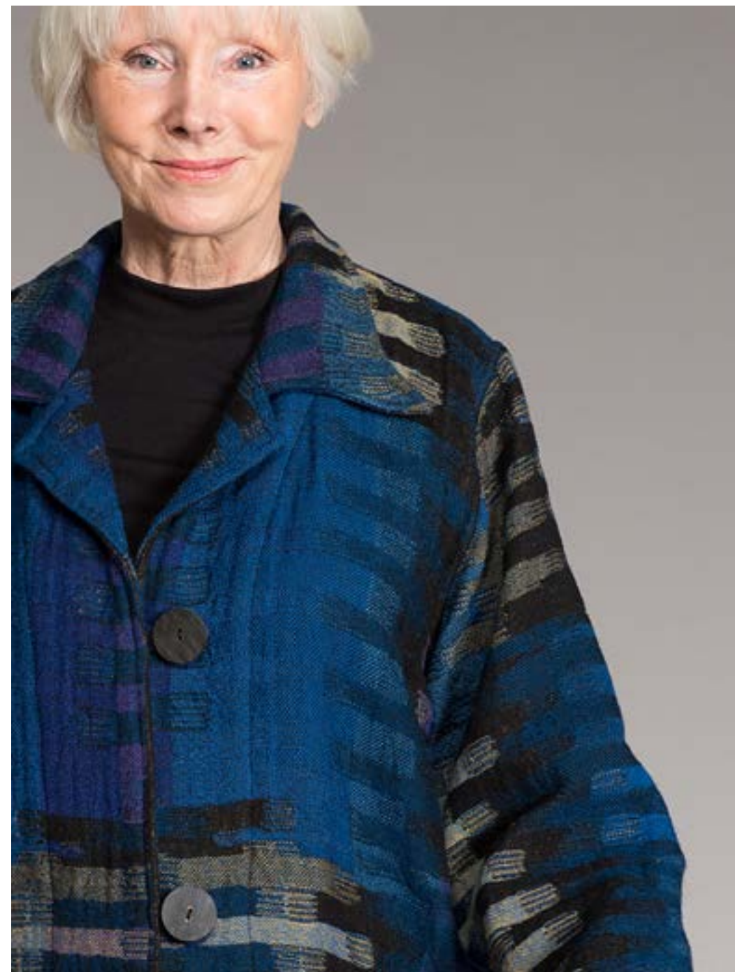
Tilak Jacket With Point Pure Wool 3 Sizes S/M, L/XL & XXL TJPW22BB