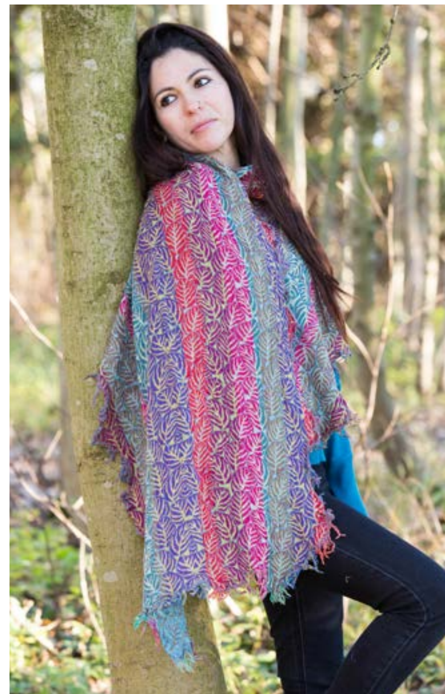
Japanese Leaves Merino Wool Shawl MWSWJL