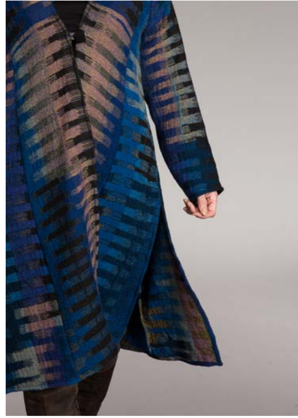
Nargis Jacket Pure Wool 3 Sizes S/M, L/XL & XXL NAJW22BB