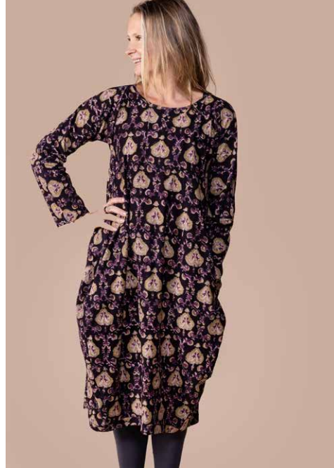
Farah Dress Cotton Jersey 3 Sizes S/M, L/XL & XXL FDJW2301