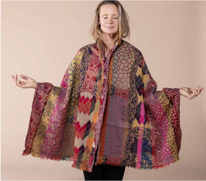
Animal Print Merino Wool Shawl MWSAWAP