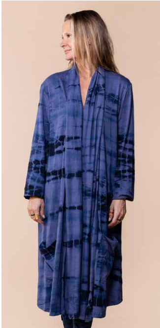
Dev Jacket Cotton Jersey 3 Sizes S/M, L/XL & XXL DJJW2306