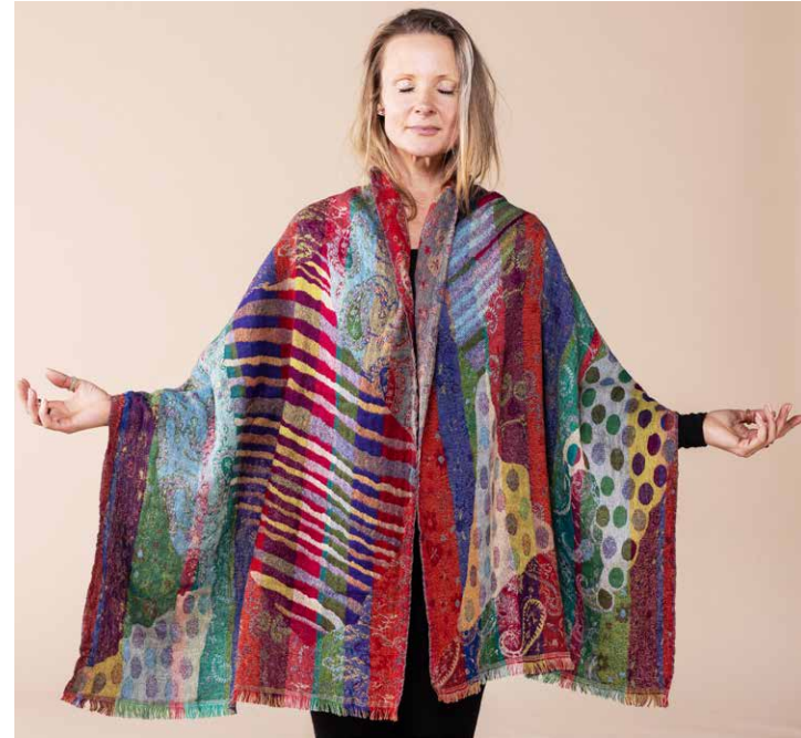
Leela Merino Wool Shawl MWSAWLE