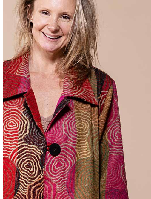
Tilak Jacket With Point Pure Wool 3 Sizes S/M, L/XL & XXL TJPW23MS