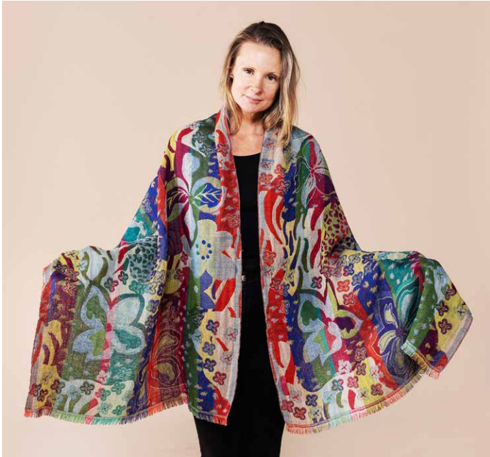
Jungle Flowers Merino Wool Shawl MWSAWJF