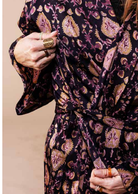
Dressing Gown Bamboo Silk 3 Sizes S/M, L/XL & XXL DGBS2301