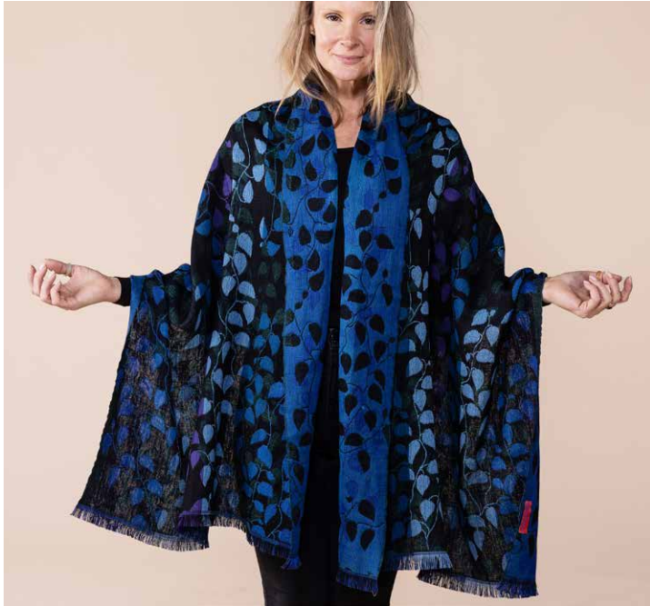
Midnight Leaves Merino Wool Shawl MWSAWMIL