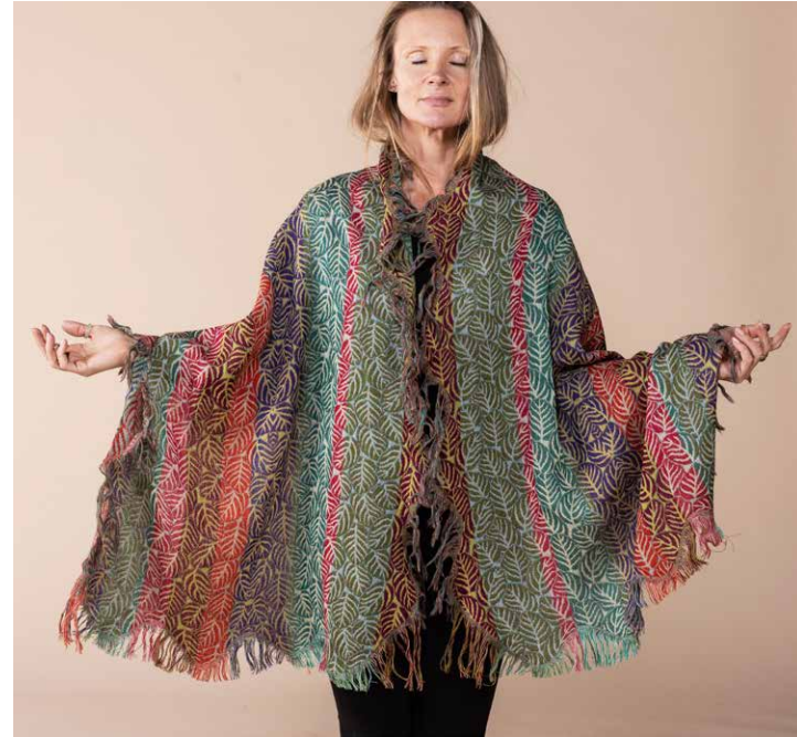
Japanese Leaves Merino Wool Shawl MWSAWJPL