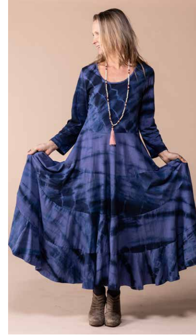
Dewani Dress Cotton Jersey 3 Sizes S/M, L/XL & XXL DDJW2306