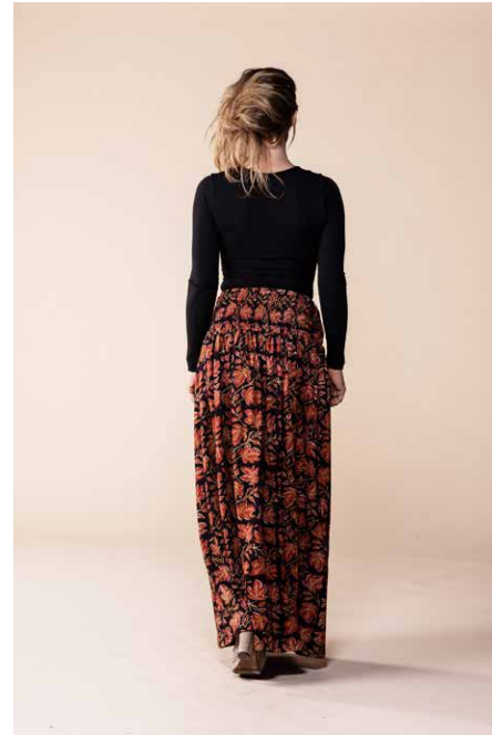
Shahad Skirt Cotton Jersey 3 Sizes S/M, L/XL & XXL SAJW2302