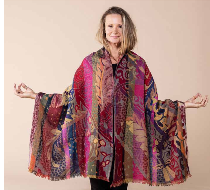
Tropical Forest Merino Wool Shawl MWSAWTF