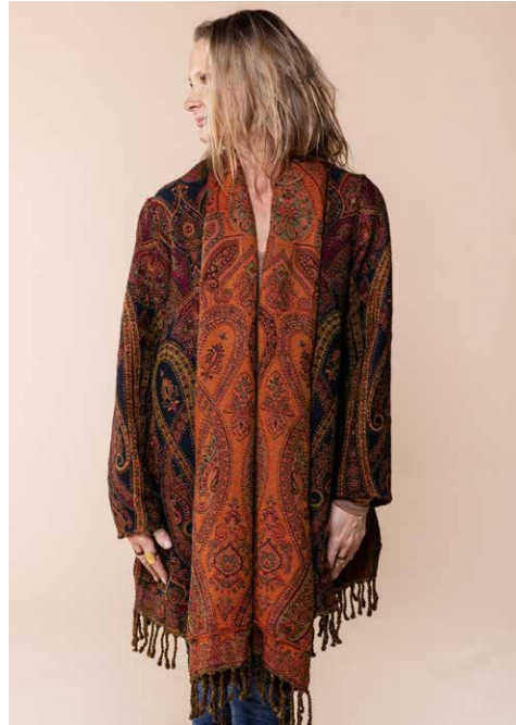
Sula Jacket Pure Wool 3 Sizes S/M, L/XL & XXL SJPW23A1