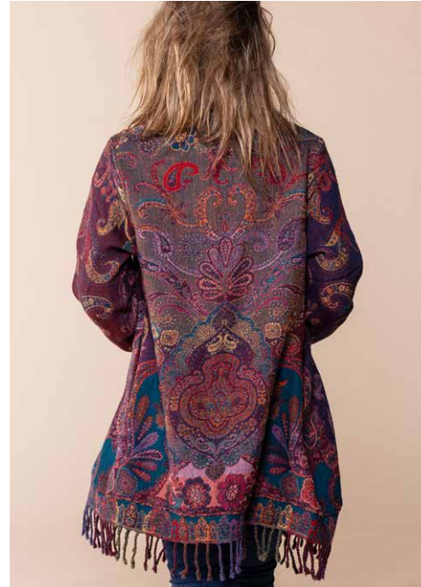
Sula Jacket Pure Wool 3 Sizes S/M, L/XL & XXL SJPW23A3