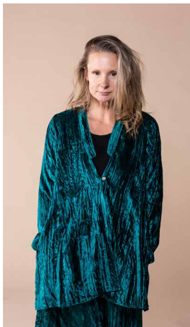
Chota Nargis Jacket Crushed Velvet 3 Sizes S/M, L/XL & XXL CNJV23EM