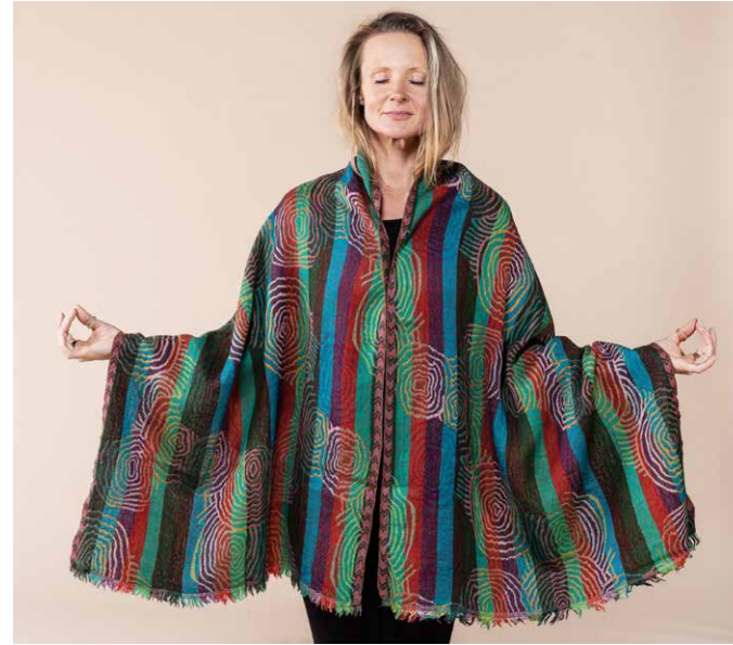
Spiral Merino Wool Shawl MWSAWNSP