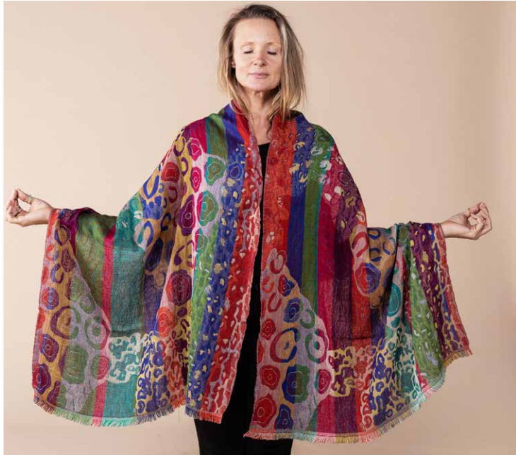
Klimt Merino Wool Shawl MWSAWKL