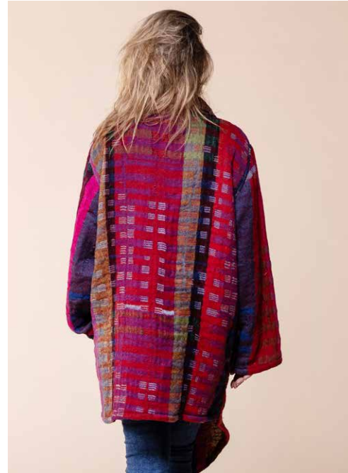
Tilak Jacket With Point Pure Wool 3 Sizes S/M, L/XL & XXL TJPW23MB