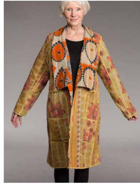
Ajuni Reversible Jacket Assorted Recycled Kantha Cotton 5 Sizes S, M, L, XL, XXL AJKC23AS