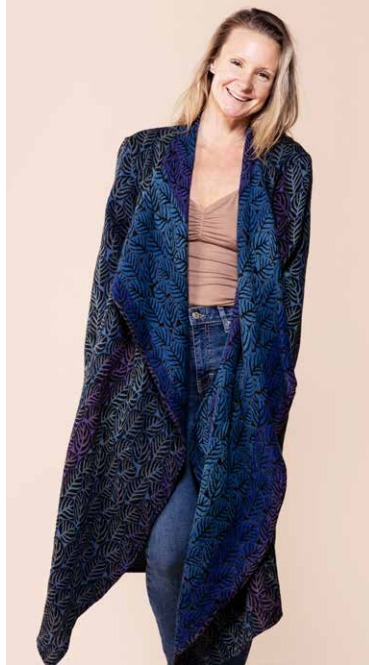
Nellore Jacket Pure Wool 3 Sizes S/M, L/XL & XXL NJPW23JB