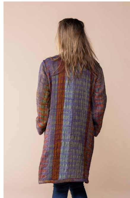
Jani Cardigan Reversible Pure Wool 5 Sizes S, M, L, XL, XXL JCPW23MB