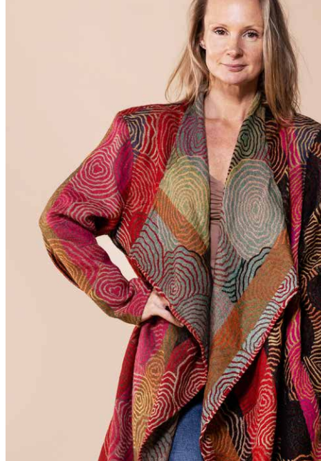
Nellore Jacket Pure Wool 3 Sizes S/M, L/XL & XXL NJPW23MS