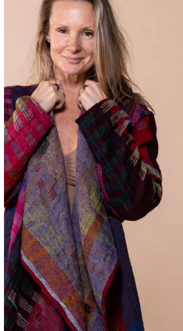
Nellore Jacket Pure Wool 3 Sizes S/M, L/XL & XXL NJPW23MB