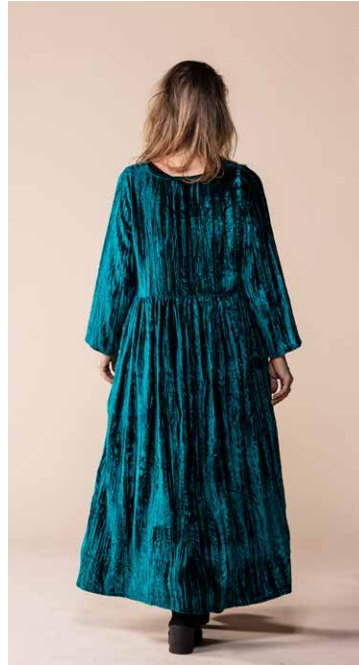
Topaz Dress Crushed Velvet 3 Sizes S/M, L/XL & XXL TDVT23BL