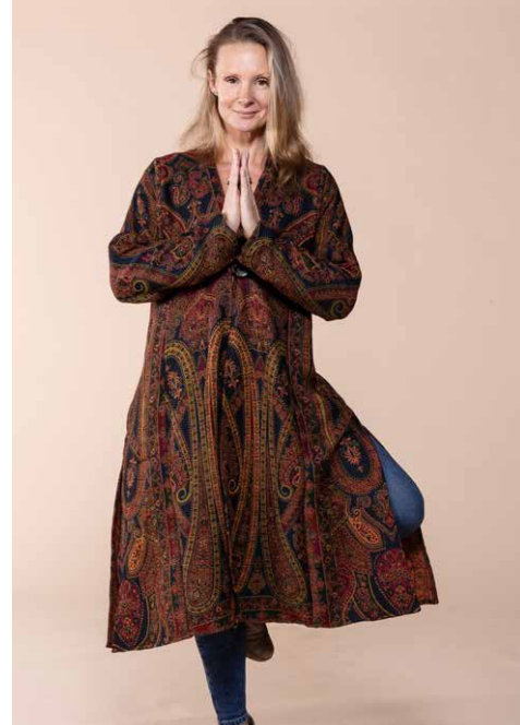
Nargis Jacket Pure Wool 3 Sizes S/M, L/XL & XXL NAJW23A1