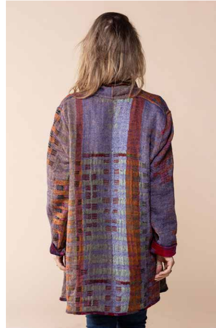
Thar Jacket Reversible Pure Wool 3 Sizes S/M, L/XL & XXL THPW23MB