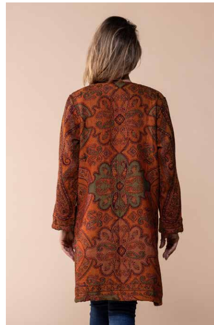
Jani Cardigan Reversible Pure Wool 5 Sizes S, M, L, XL, XXL JCPW23A1