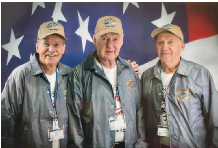
Upper Peninsula Honor Flight