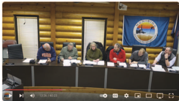
City of Munising

This YouTube screen capture is from the Munising City Commission’s Dec. 4 meeting. The city is now capable of recording meetings on video and posting them online.