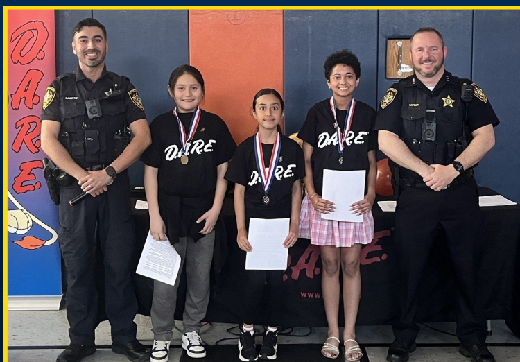
Hanover Countryside essay winners