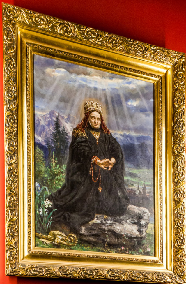
Jan Matejko, 1892 r. ŚWIĘTA KINGA SAINT KINGA