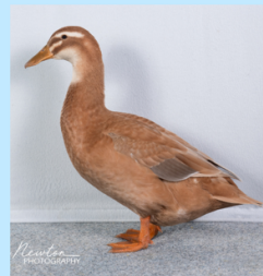
Saxony Standard and Bantam

$50.00 for each Champion (overall) feature breed