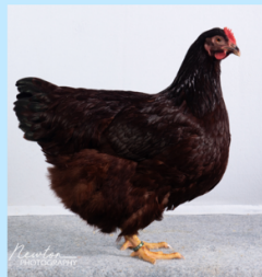
Rhode Island Standard and Bantam