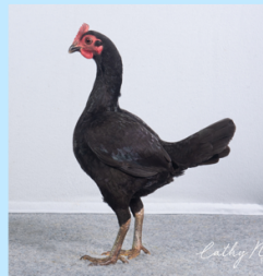
Australian Pit Game Standard and Bantam