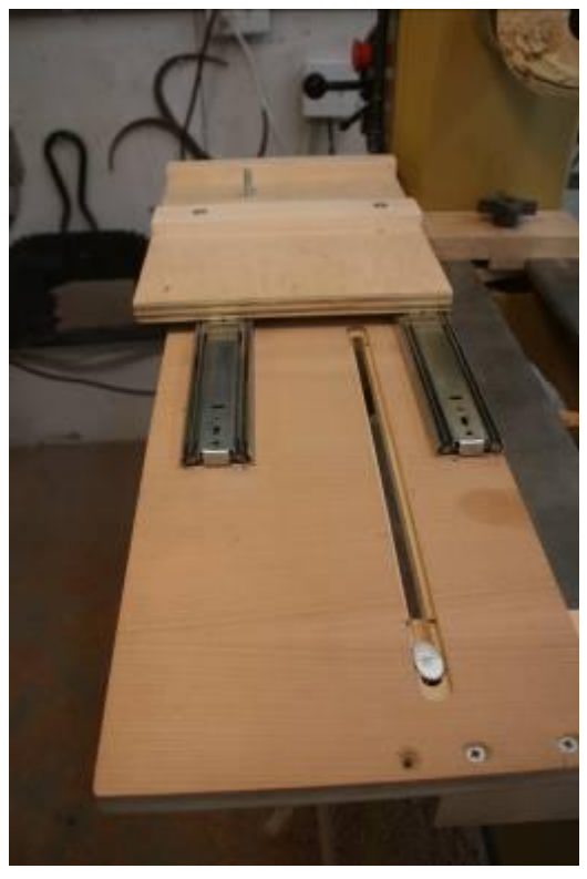
End view of sliding platform

Sliding platform locked in place. Note drawer guides to align fixture.