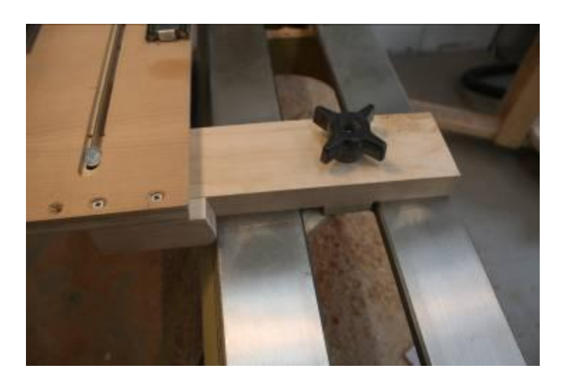
Locking mechanism for platform, right side