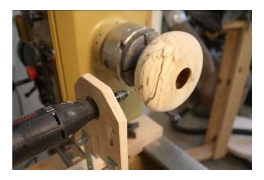
Dremel lined up with vessel