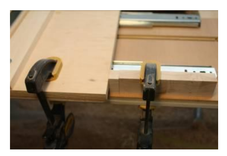
Stop block in place