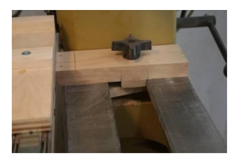
Locking mechanism for platform, left side