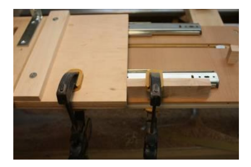
Stop block removed