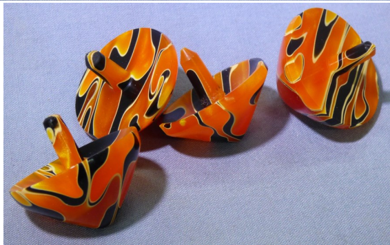
← Tops , Pens for the Troops → and Bowl made by ↓ Les Isbell