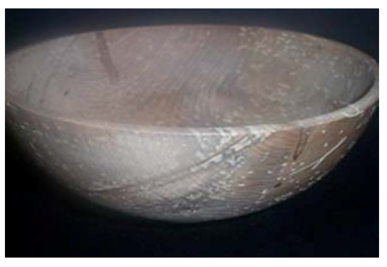
Figure 1. Surface of wormy wood.