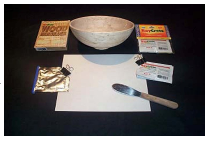
Figure 3. All the kit to fix the bowl.

It is a two-part polymer material that can be described as a bonding structural filler. That is, it is a glue, strong filler, and sealant. Also, it has no VOCs or discernable odor. I had some on hand, which I always do for many purposes, so mixed up about 2 tablespoons full, and massaged it into the inner surface of the bowl with my fingertip inside a plastic Ziploc baggie to save later hand washing. This only took a few minutes, during which the polymer started to set up. I noticed a deep hole about 1/4" diameter was absorbing the polymer, so took the mixing spatula, lifted up a final polymer nugget which was now about the consistency of soft clay, and puttied this hole and several others I discovered while closely examining the work. Figure 3 shows the bowl, EZ Poly Wood Rebuilder, RayCrete, cardboard for mixing, and my wife's kitchen spatula used for brownies.