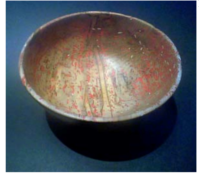
Figure 7. Top View of Finished Bowl

This information is provided by More Woodturning Magazine. Please visit their web site: www.morewoodturningmagazine.com