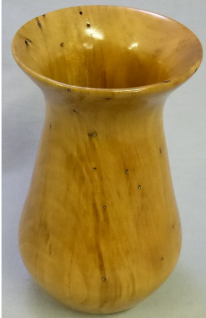
Table Pedestal → And other items below Created by Doug Spohn