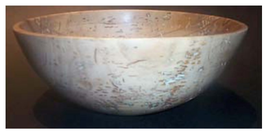
Figure 6. Side of Finished Bowl.