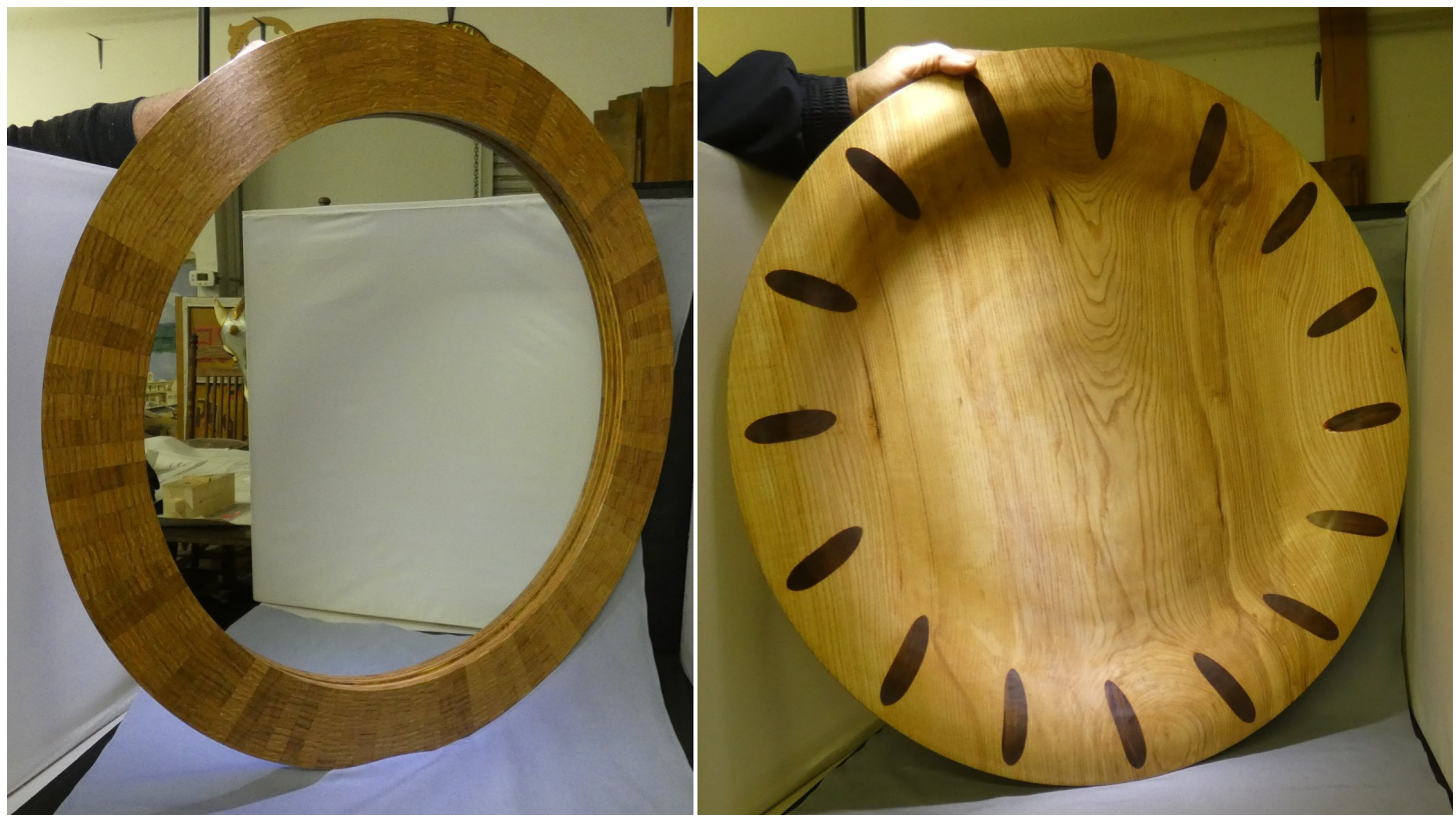
CUTS AND SCRAPES