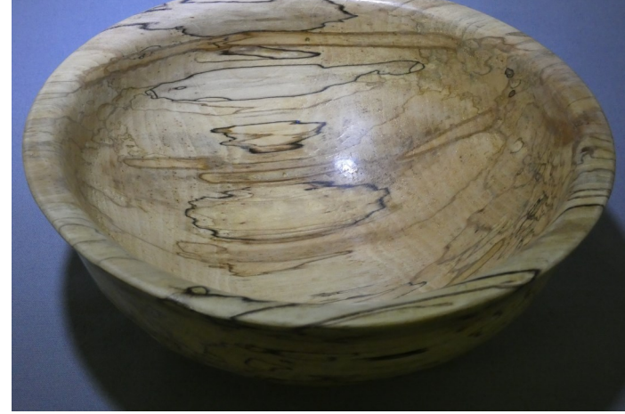
Bowls on this page all created by Don Moore