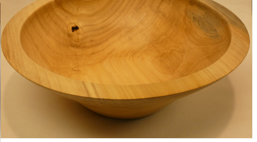
CUTS AND SCRAPES