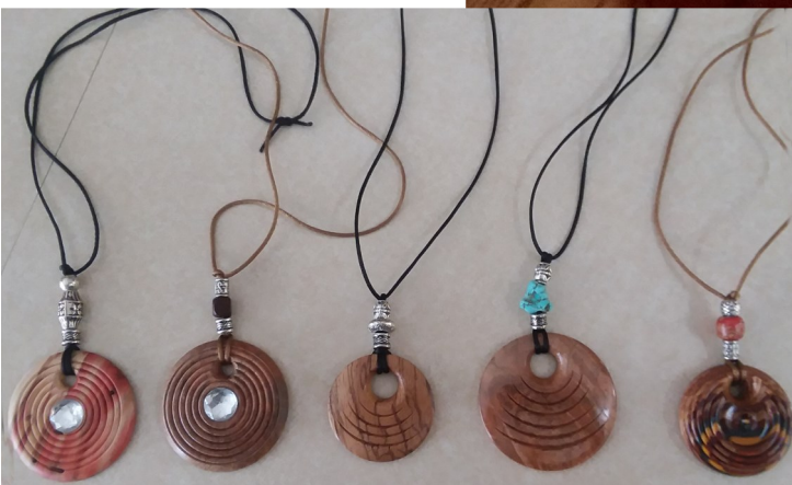
This square bowl, kitchen utensils, replacement grill handle, super large Maple bowl and necklaces all made by Charles Jennings