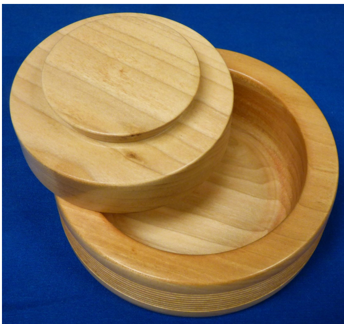
Cuts and Scrapes