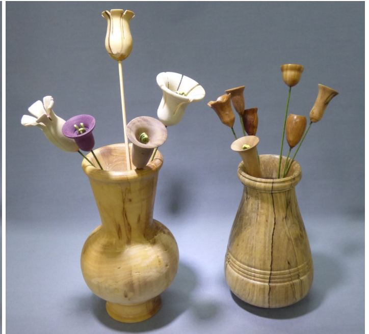
Dom Moore top row Vases & Flowers