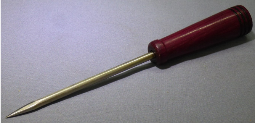
↙ Charles Abercrombie