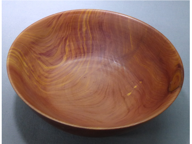
Pens for the Troops and 3 Bowls turned by