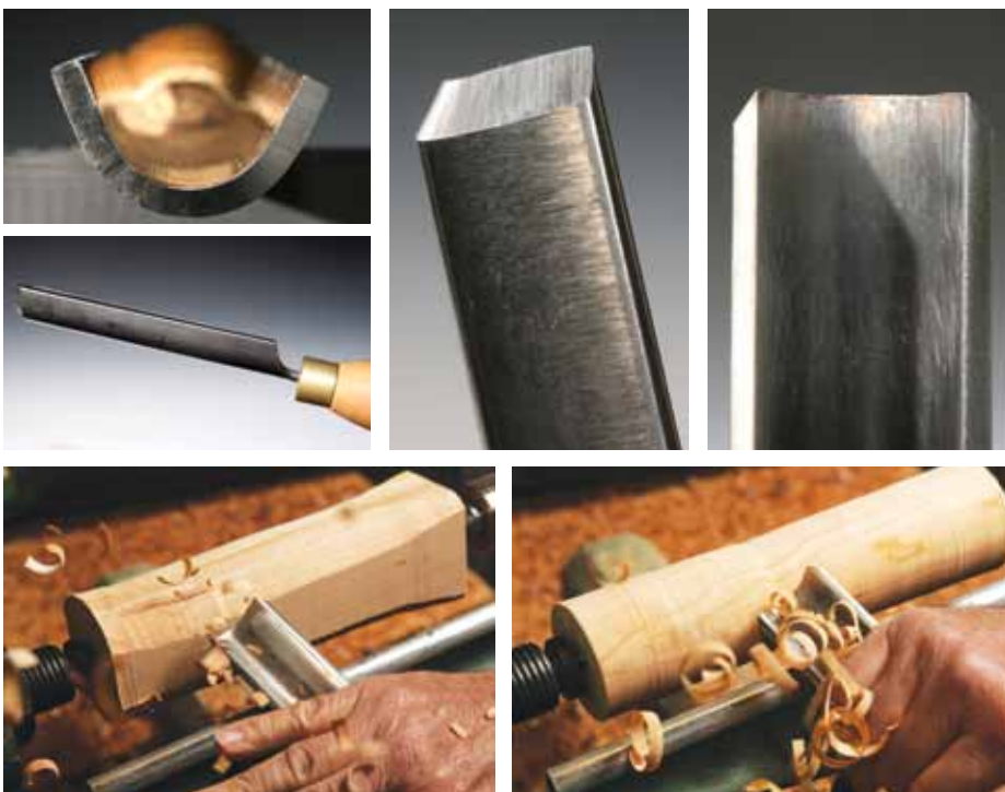
A spindle-roughing gouge (SRG) is used to turn a square spindle into a cylinder.