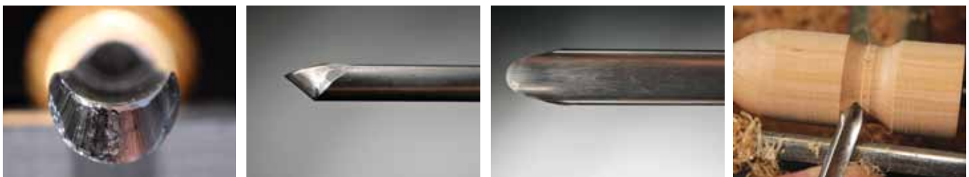
A spindle gouge cleanly cuts coves.