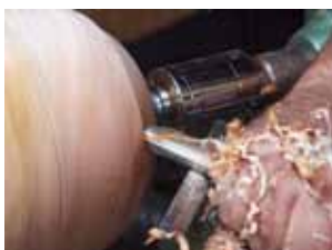
A roughing cut on the outside of a bowl.