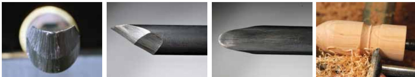
A detail gouge is primarily used for spindle turning and is ideal for cleanly cutting tight transitions.

them in much the same fashion as a skew chisel.