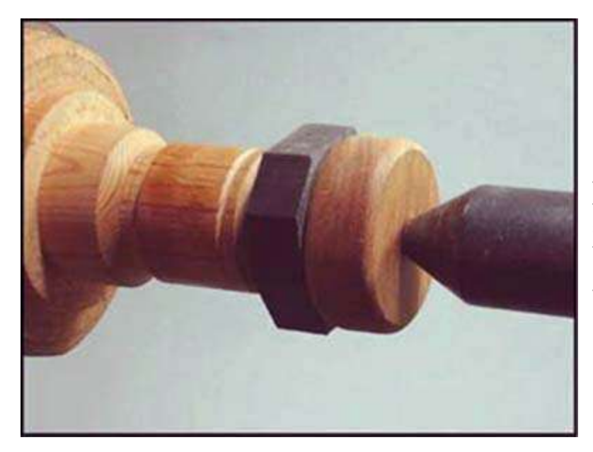
Use another waste block and bring the tail stock up to put pressure on the collar blank. Tighten the tail stock and keep the tension on for a few minutes to allow the collar blank to stick to the double sided tape.

Turn the collar to fit the opening of the hollow form. Check the fit often. The collar should be snug, but not too tight. Also, shape and sand the top edge of the collar.