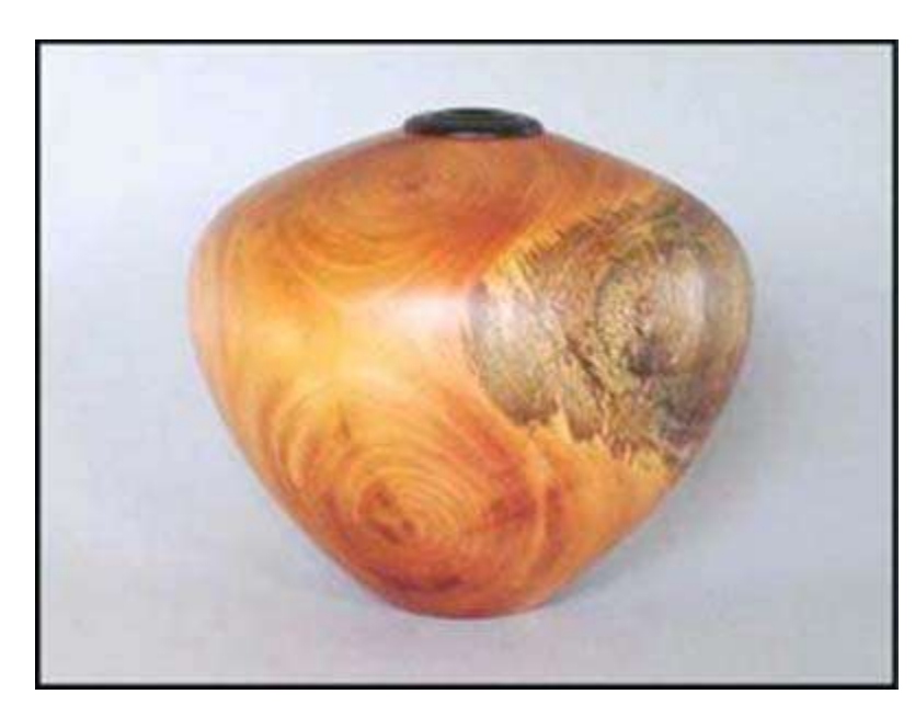
Described here is one way to make a collar for a hollow form.