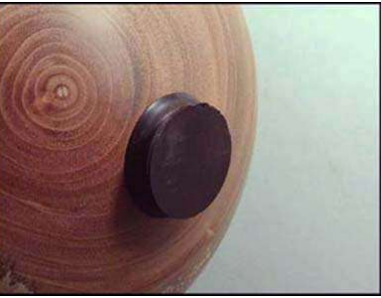
The collar is now ready for shaping.