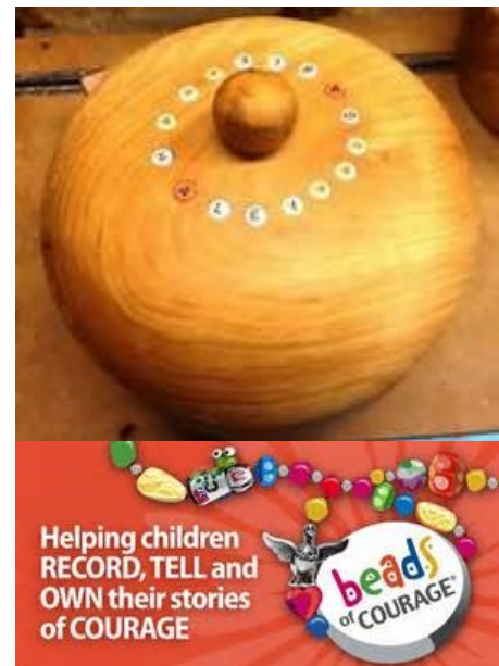
A Beads of Courage Box may replace one months challenge (your choice)