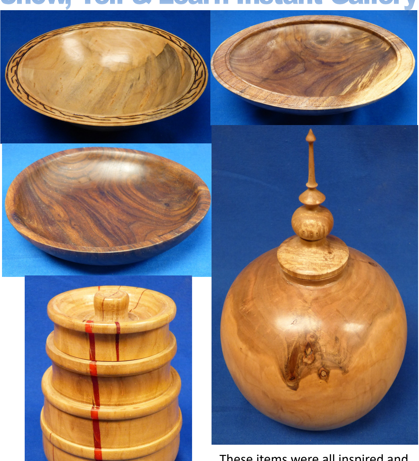
These items were all inspired and created by Don Moore