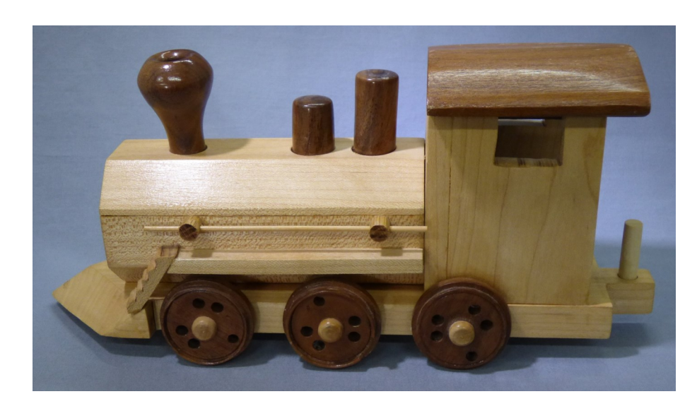
\downarrow Charles Abercrombie