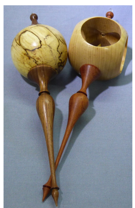
CUTS AND SCRAPES