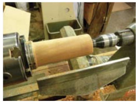
Figure 1. Here the wood has been turned round and to about 1-1/2" in diameter.

I've used about every type of hardwood for these rattles, but I find that the harder and closer-grained the wood, the better the ring cutting tools work. The rattle I made for this article was made from a chunk of plum wood and I used the Robert Sorby ¼-inch set of ring cutting tools. The