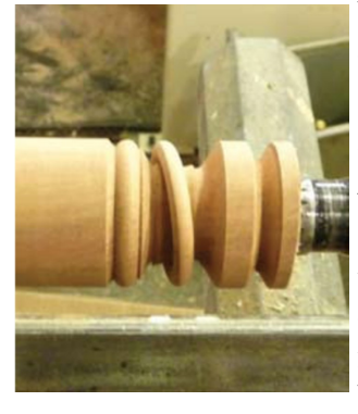
Figure 5. Starting the second loose ring.

Form the handle and put in two decorative "V" cuts with the skew. At this time I cut the "V" at the end of the handle down to about 1/4 inch. I then shift to the far right side and turn the piece between the first "V" cut and the ring recess into a pleasing knob shape.