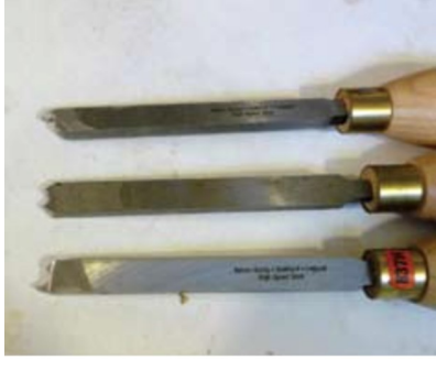
Figure 7. The Robert Sorby tools used in this project: (top to bottom) Right hand side tool, beading tool, and left hand side tool.

Add a coat of non-toxic oil and you have a completed rattle. I used the Mahoney Walnut Oil finish, which works very well. The finished baby rattle is not too large, but it meets the minimum size requirement for baby toys.