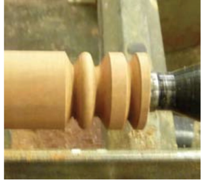
Figure 3. Here the top of the ring-to-be has been cut with the Sorby beading tool.

Now, take the ¼-inch beading tool and cut a bead. The right side of the tool should just cut into your "V". I've found it works best if you gently rock the tool handle from side to side. This tool is basically a scraper, so it should be tipped slightly downward also. Don't try to cut too heavily or you may break out pieces of your ring. I generally cut in with the beading tool until the ring has just cleaned up. See Figure 3. The only sharpening you need to do on the beading tool is to hone the top face. You should never grind the other parts that were ground to shape at the factory.