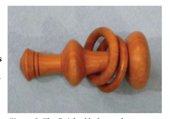
Figure 8. The finished baby rattle

This information is provided by More Woodturning Magazine. Please visit their web site: <a href="https://www.morewoodturningmagazine.com">www.morewoodturningmagazine.com</a>